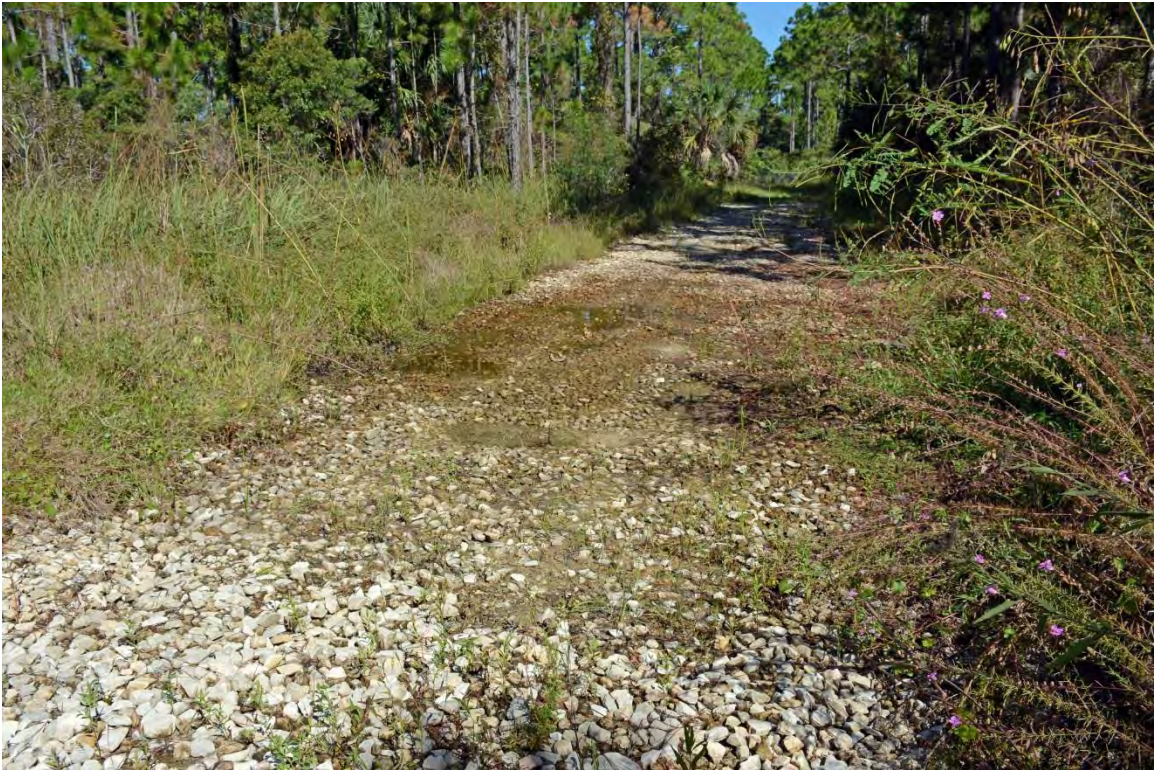
Figure 2: Island Road LWC (10/13/2016)