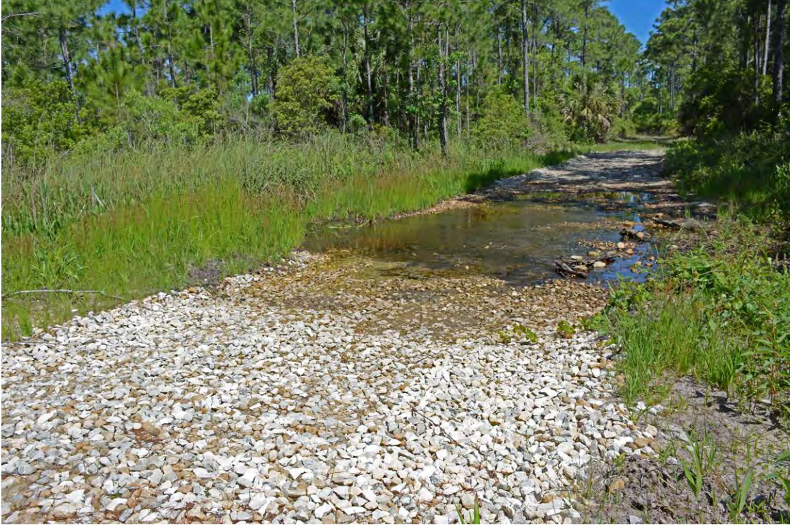
Figure 1: Island Road LWC (4/19/2016)