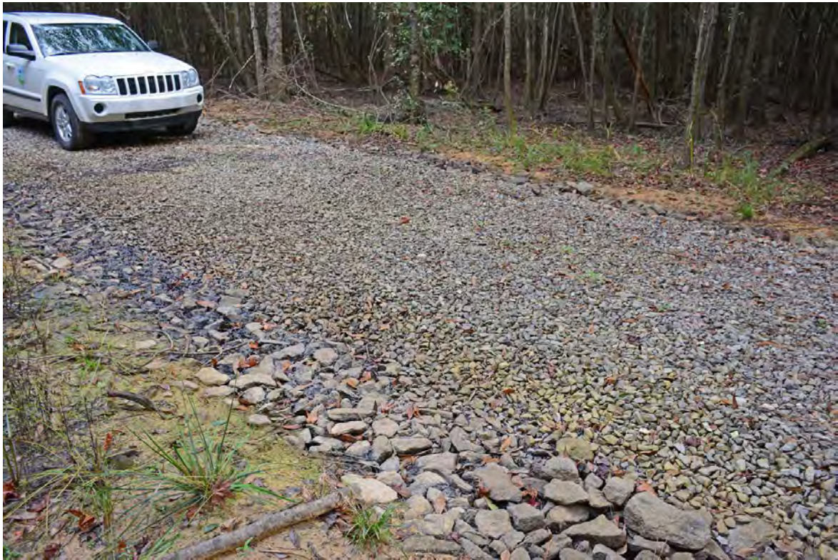
Cotton Creek Road LWC (10/28/2016)