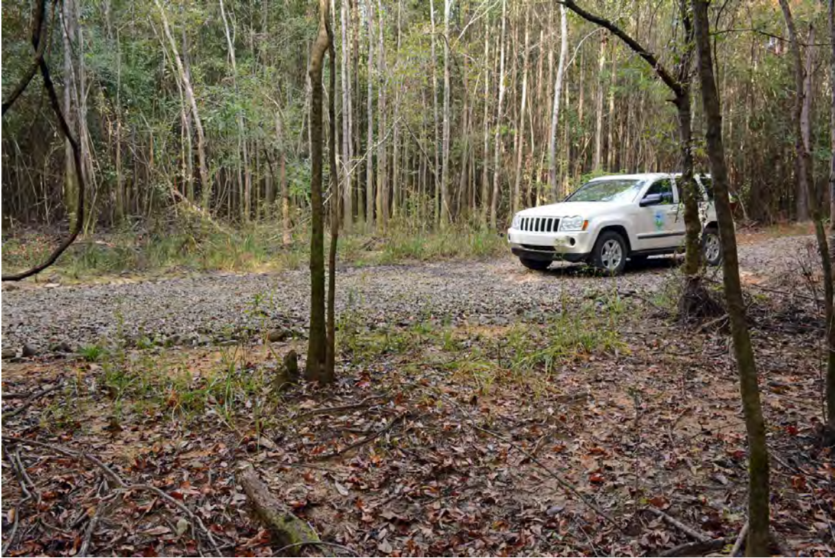
Cotton Creek Road LWC (10/28/2016)