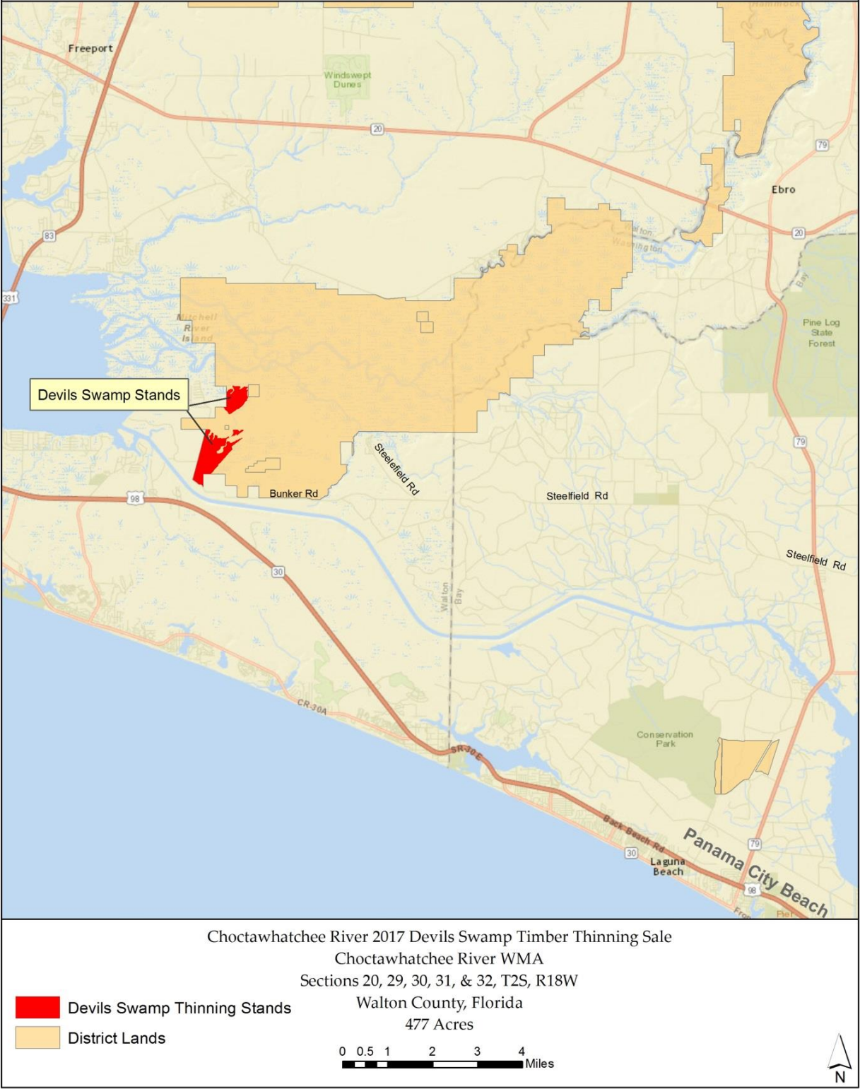
Exhibit Map A - Locator