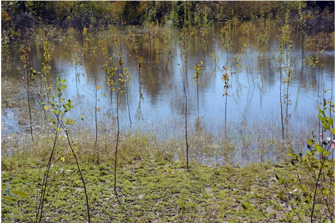
Mystic Springs (10/25/2017)