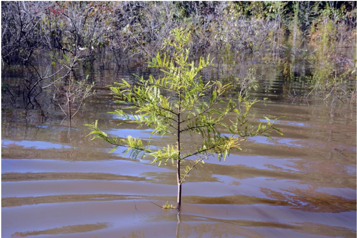
Mystic Springs (10/25/2017)