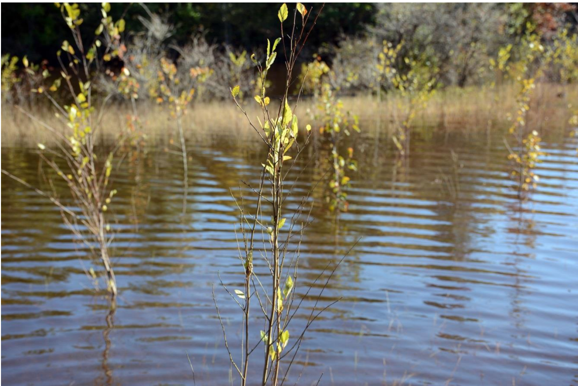
Mystic Springs (10/25/2017)