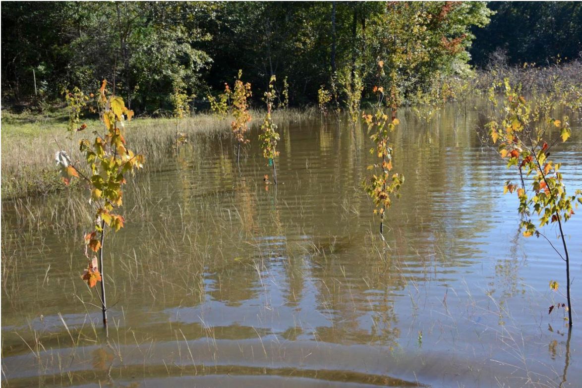
Mystic Springs (10/25/2017)