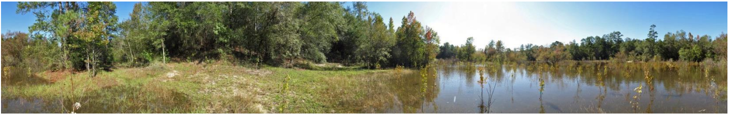
Mystic Springs (10/25/2017)