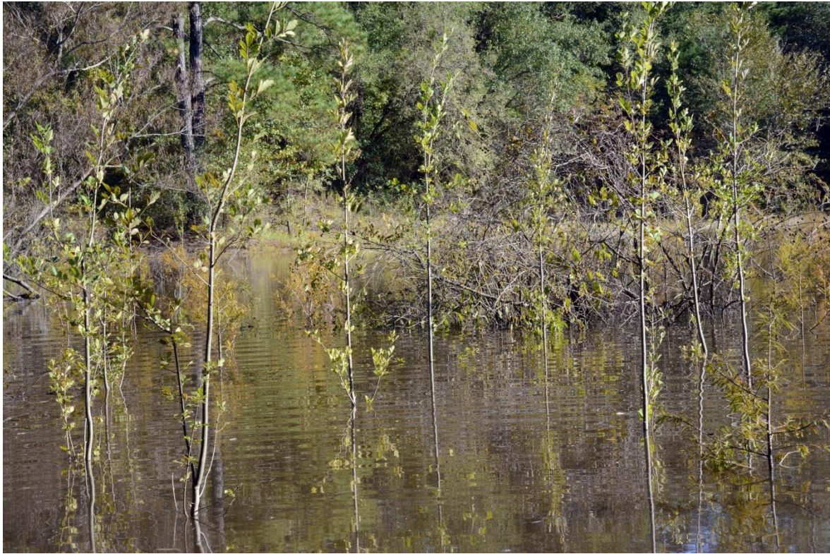
Mystic Springs (10/25/2017)