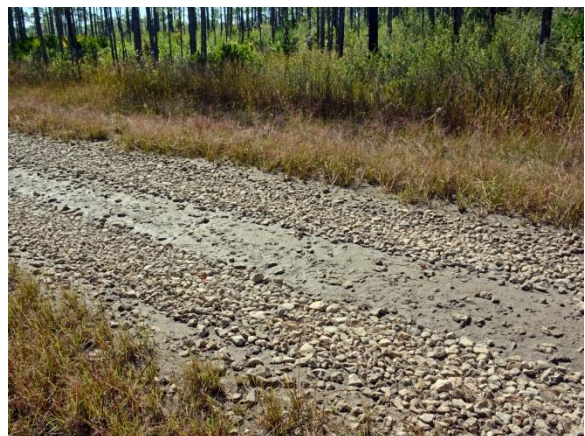
LWC - #6 (10/26/2017)