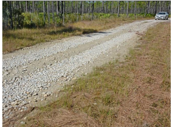
LWC - #2 (10/26/2017)