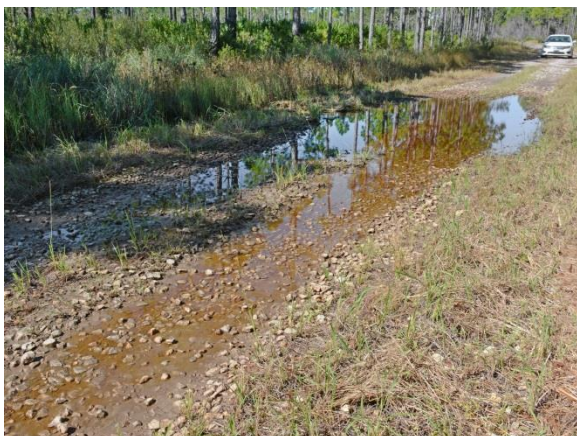
LWC - #5 (10/26/2017)