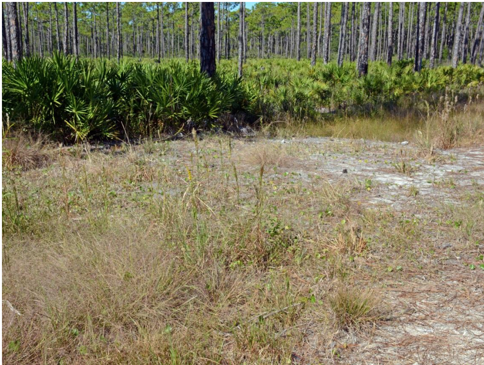
Typical Ditch Plug with Adjacent Hydric Pine Flatwoods in Background (10/26/2017)