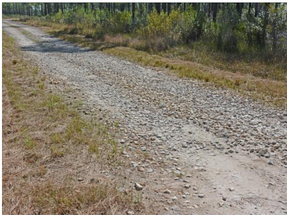
LWC - #3 (10/26/2017)