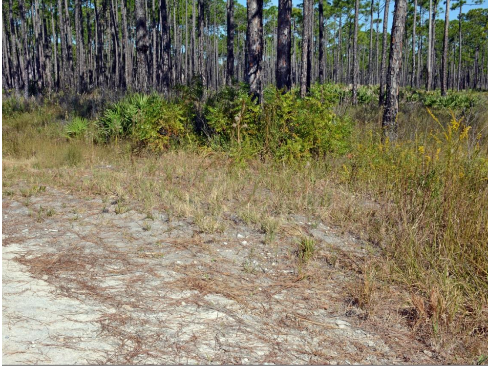
Typical Ditch Plug with Adjacent Hydric Pine Flatwoods in Background (10/26/2017)