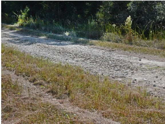
LWC - #1 (10/26/2017)