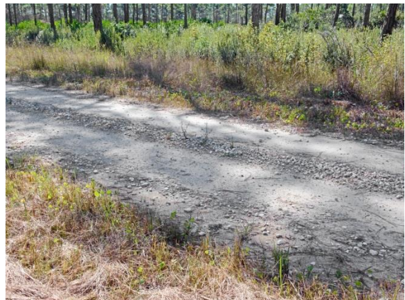
LWC - #4 (10/26/2017)