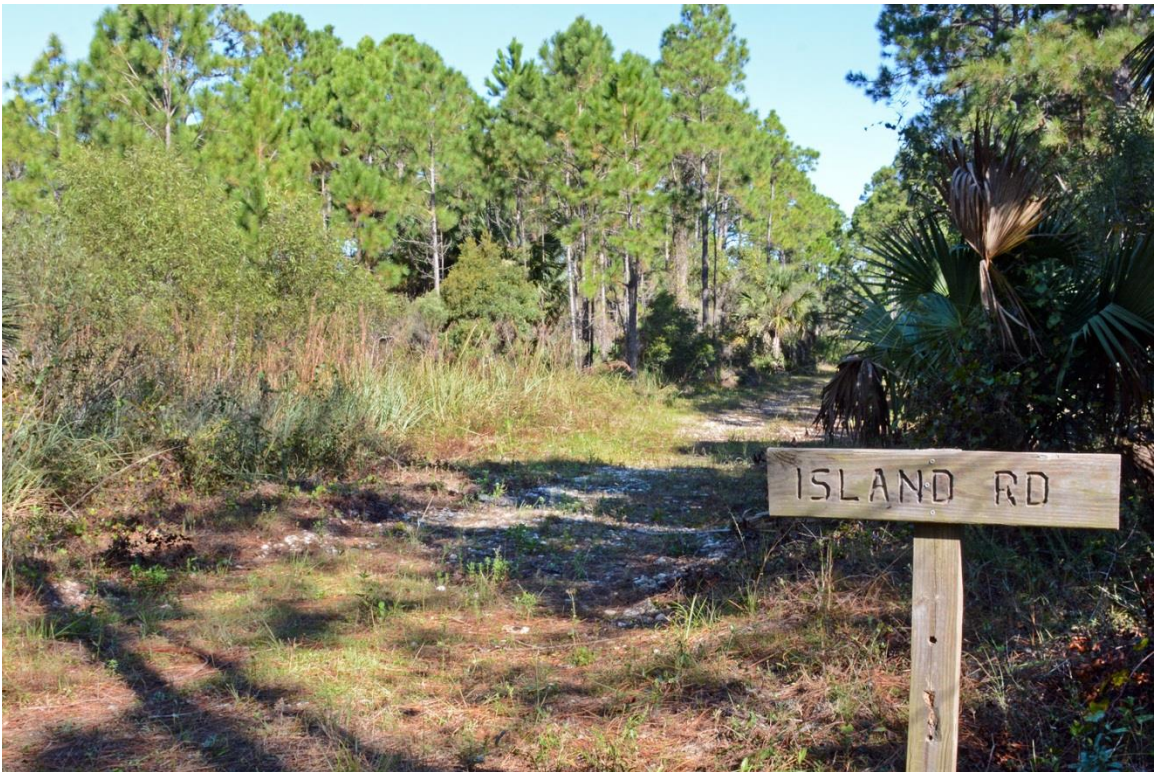
Figure 2: Island Road LWC (10/26/2017)