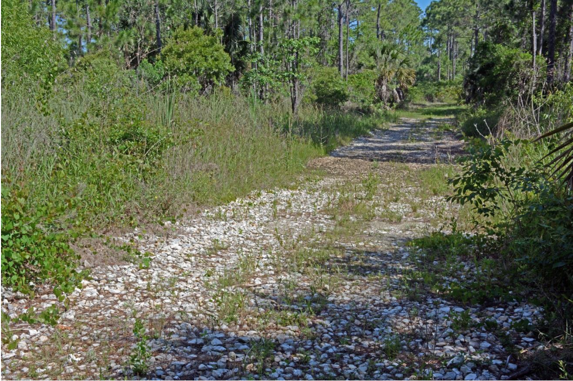
Figure 1: Island Road LWC (4/25/2017)