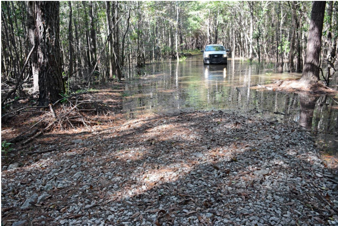
Cotton Creek Road LWC (10/25/2017)