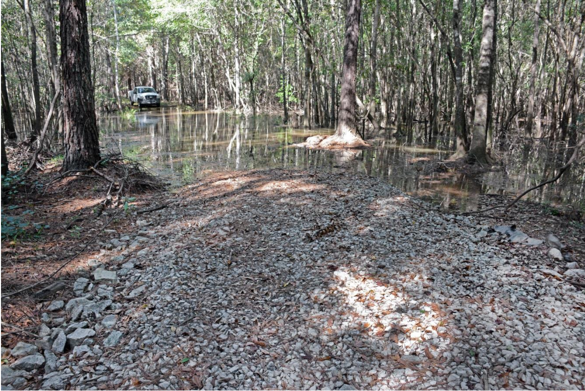
Cotton Creek Road LWC (10/25/2017)