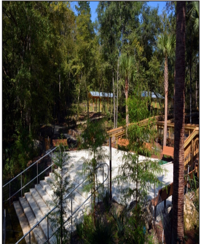
Bottom right: Photo of steps leading down into Williford Springs and sitting area