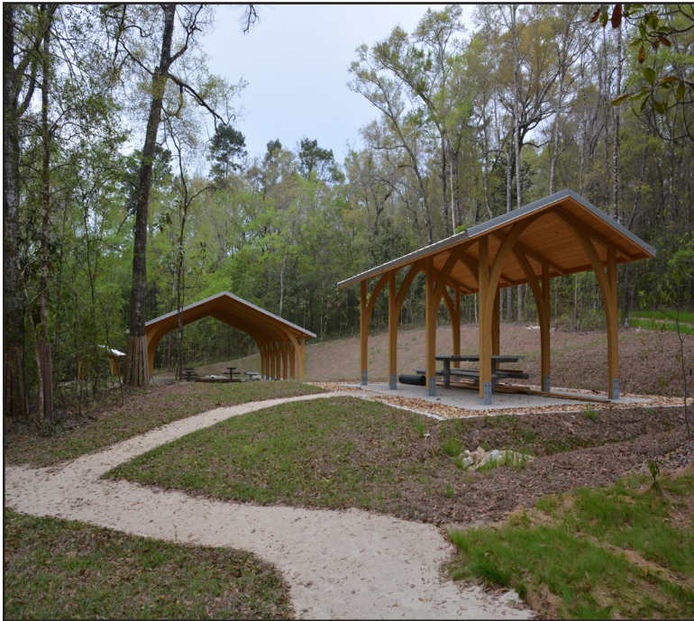
Above: Williford Spring Picnic Pavilions Photo