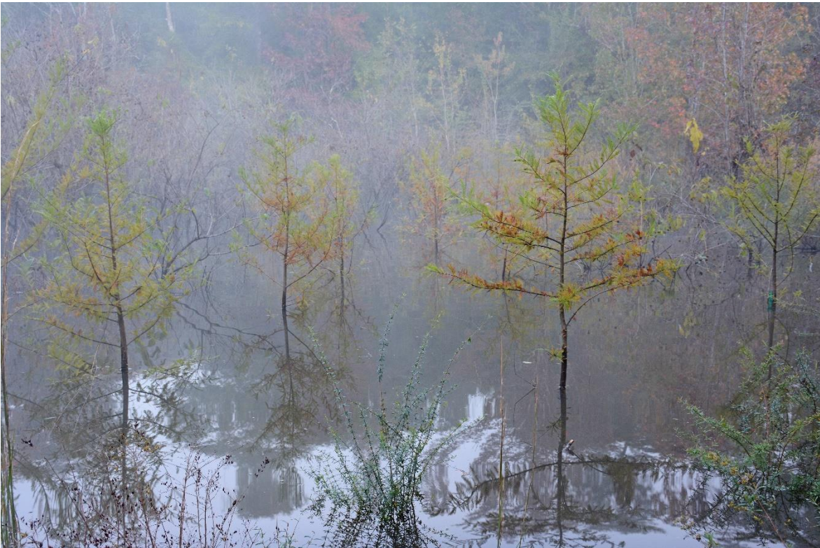
Mystic Springs (11/16/2018)