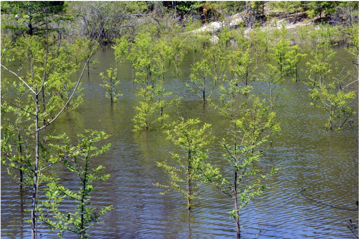
Mystic Springs (4/18/2018)