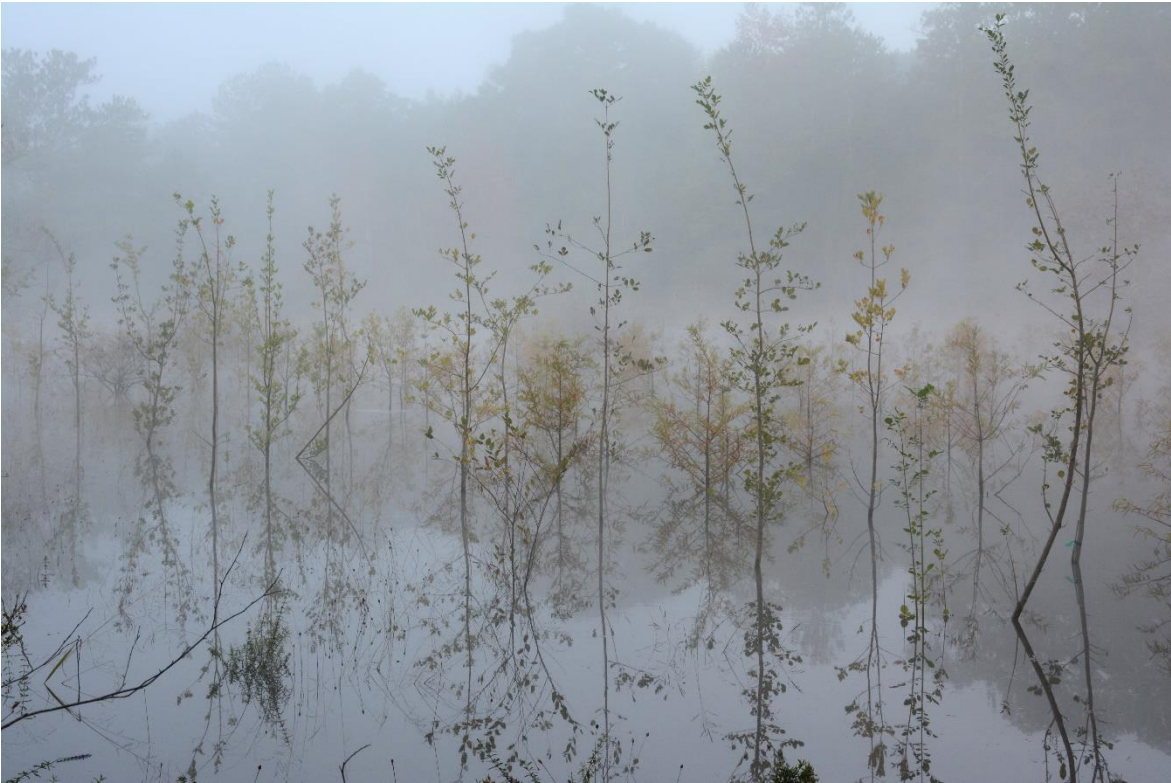
Mystic Springs (11/16/2018)