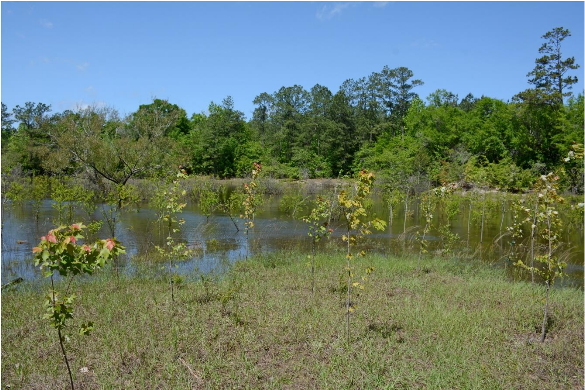
Mystic Springs (4/18/2018)