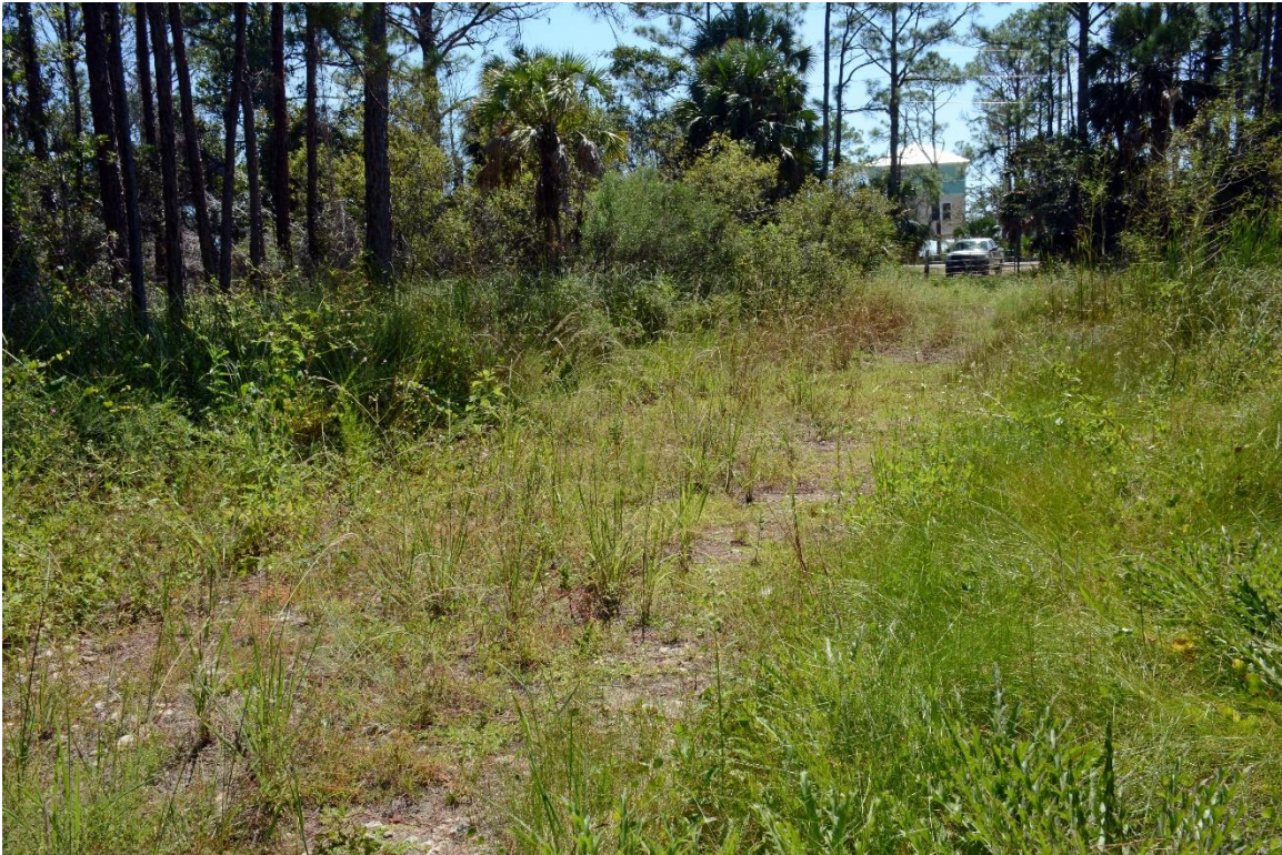
Figure 2: Island Road LWC (9/24/2019; Looking South)