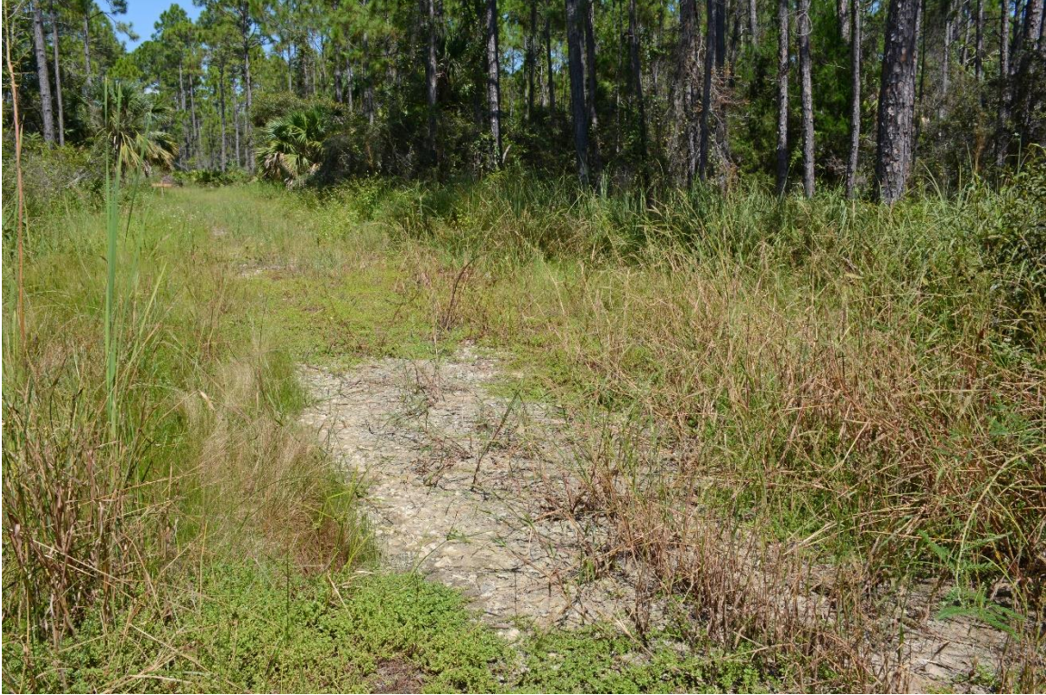
Figure 1: Island Road LWC (9/24/2019; Looking North)