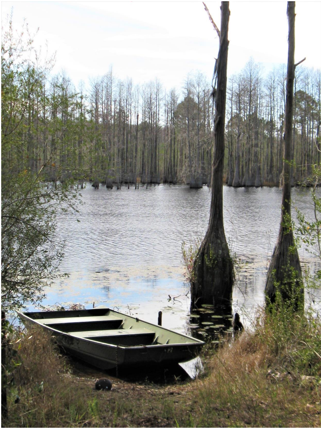
Figure 6. Green pond #2, facing west (12/27/2019)