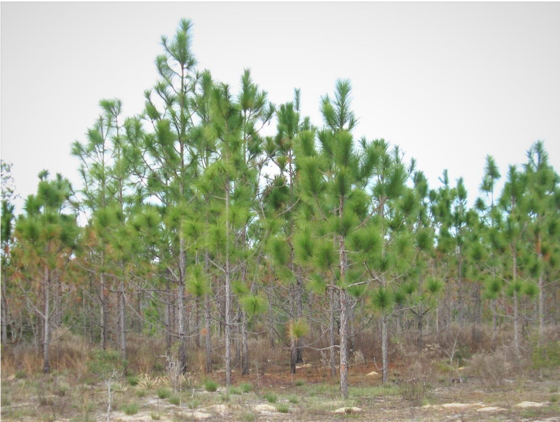
Figure 4. Sandhill restoration adjacent to Dykes Mill Pond, facing west (12/27/2019)