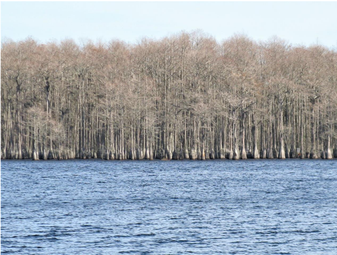
Figure 2. Black Pond facing south (12/27/2019)