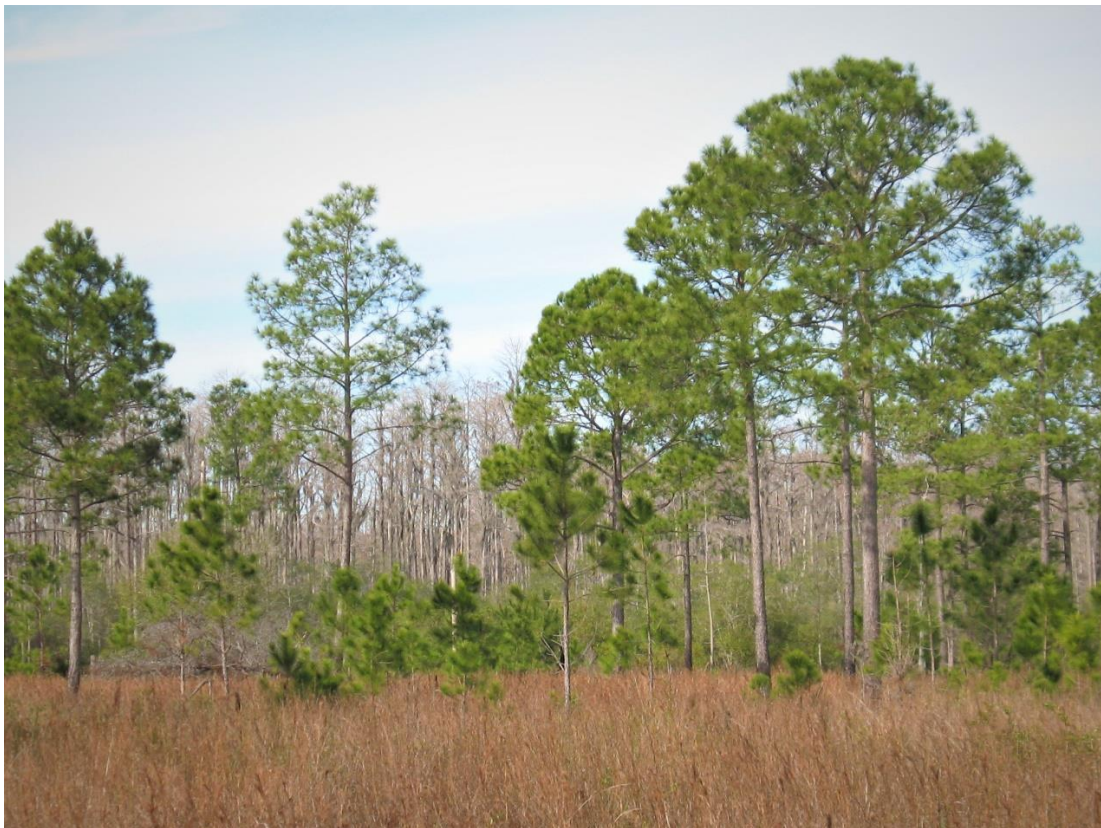
Figure 5. Hydric pine flatwoods restoration, facing southwest (12/27/19)