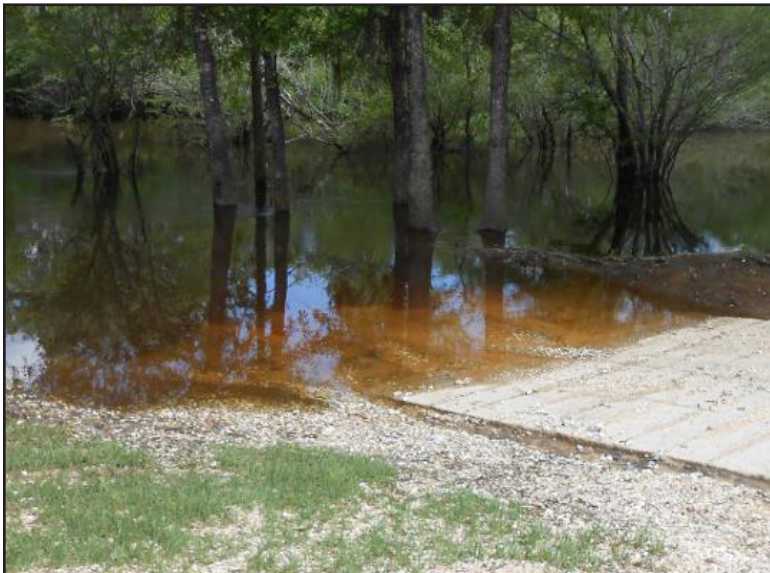
Above: Webb Landing Boat Ramp Top right: Webb Landing Campsite 1 Center: Webb Landing Campsite 3 Bottom right: Webb Landing Campsite Diagram