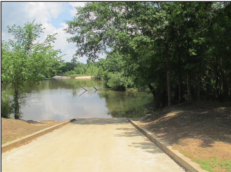
Above: Keyser Landing Boat Ramp Top right: Keyser Landing Campsite 1 Center: Keyser Landing Day Use Area Bottom right: Keyser Landing Campsite Diagram