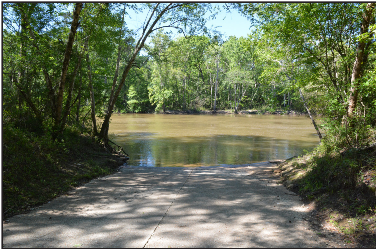
Above: Boynton Landing Boat Ramp Top right: Boynton Landing Campsite Center: Boynton Landing Campsite Bottom right: Boynton Landing Campsite Diagram