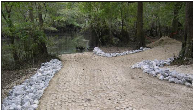
Above: Lost Lake Boat Ramp