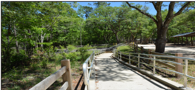
Above: Cotton Landing Boat Ramp Top right: Cotton Landing Campsite Center: Cotton Landing Day Use Area Picnic Pavilion Bottom right: Cotton Landing Campsite Diagram