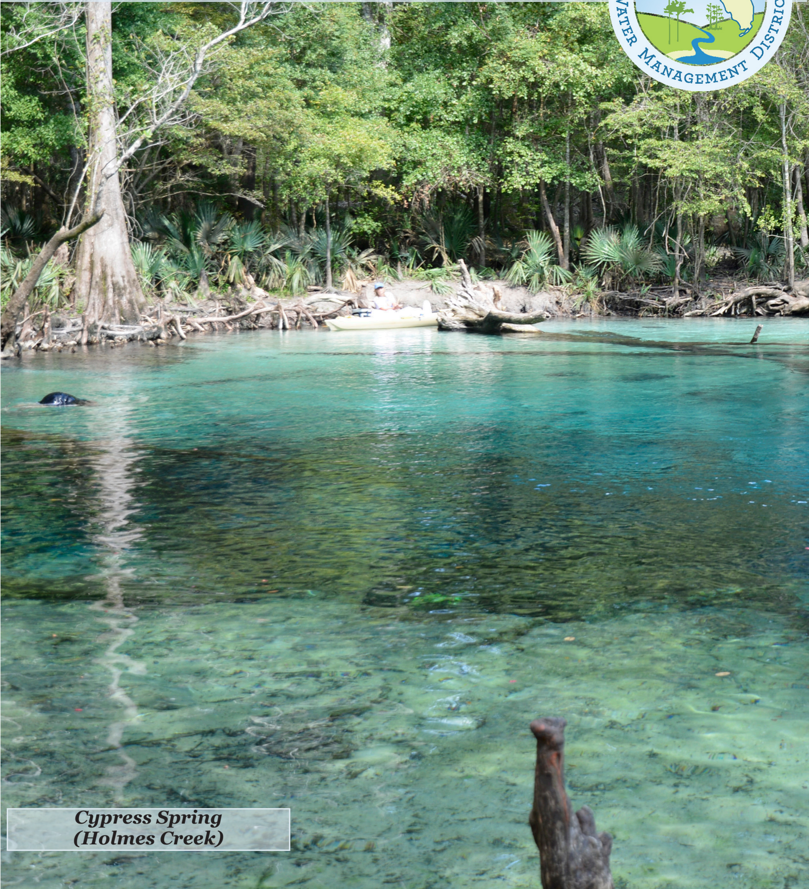
Cypress Spring (Holmes Creek)