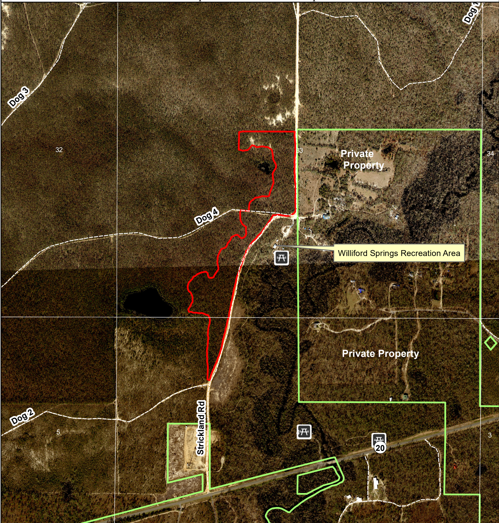
Exhibit Map - Stickland West Cleanup Area

Stickland West Cleanup Area Econfina Creek Water Management Area Sections 28 & 33, Township 1N, Range 13W & Section 4, Township 1S, Range 13W Bay & Washington Counties, Florida 33 Acres