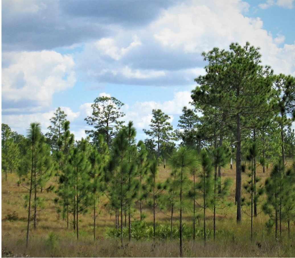
Figure 4. Sandhill restoration adjacent to Deep Edge Pond, facing north (12/29/20)