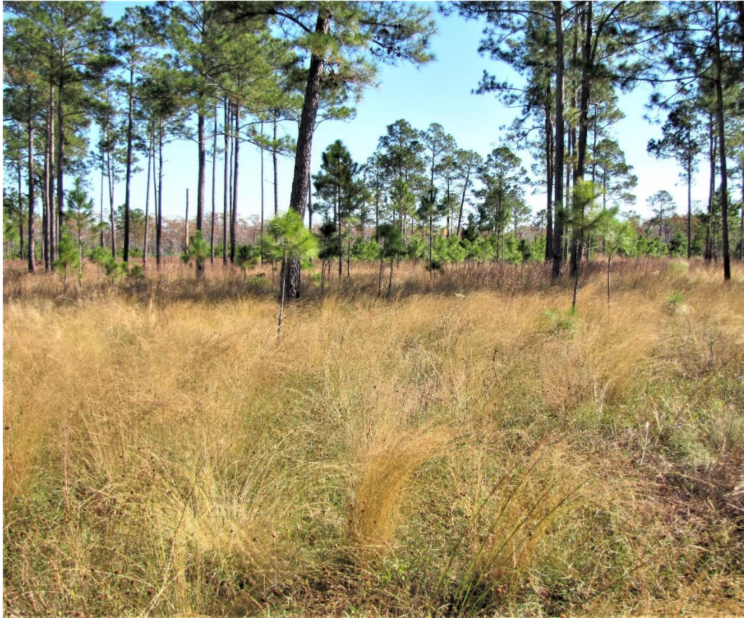
Figure 6. Hydric Pineflatwoods restoration, facing east (11/22/20)