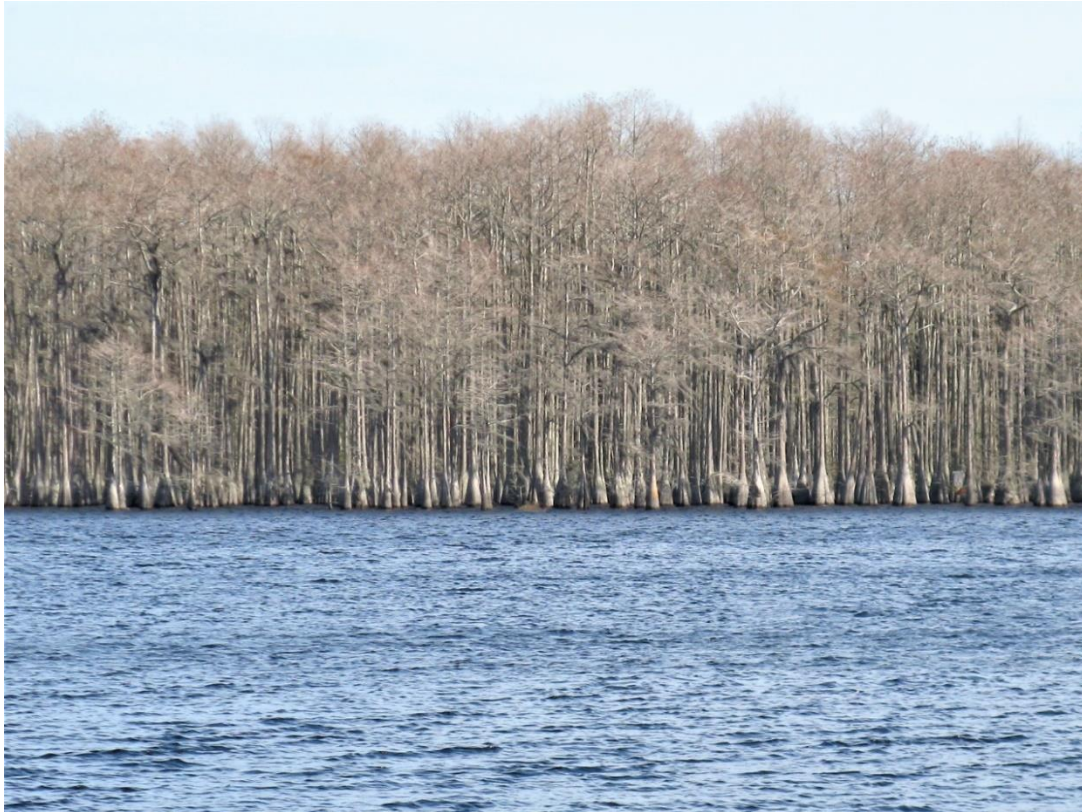
Figure 2. Dry Pond facing east (12/29/20)