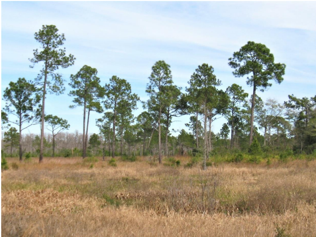
Figure 3. Hydric pine flatwoods restoration adjacent to Dry Pond, facing southwest (12/29/20)