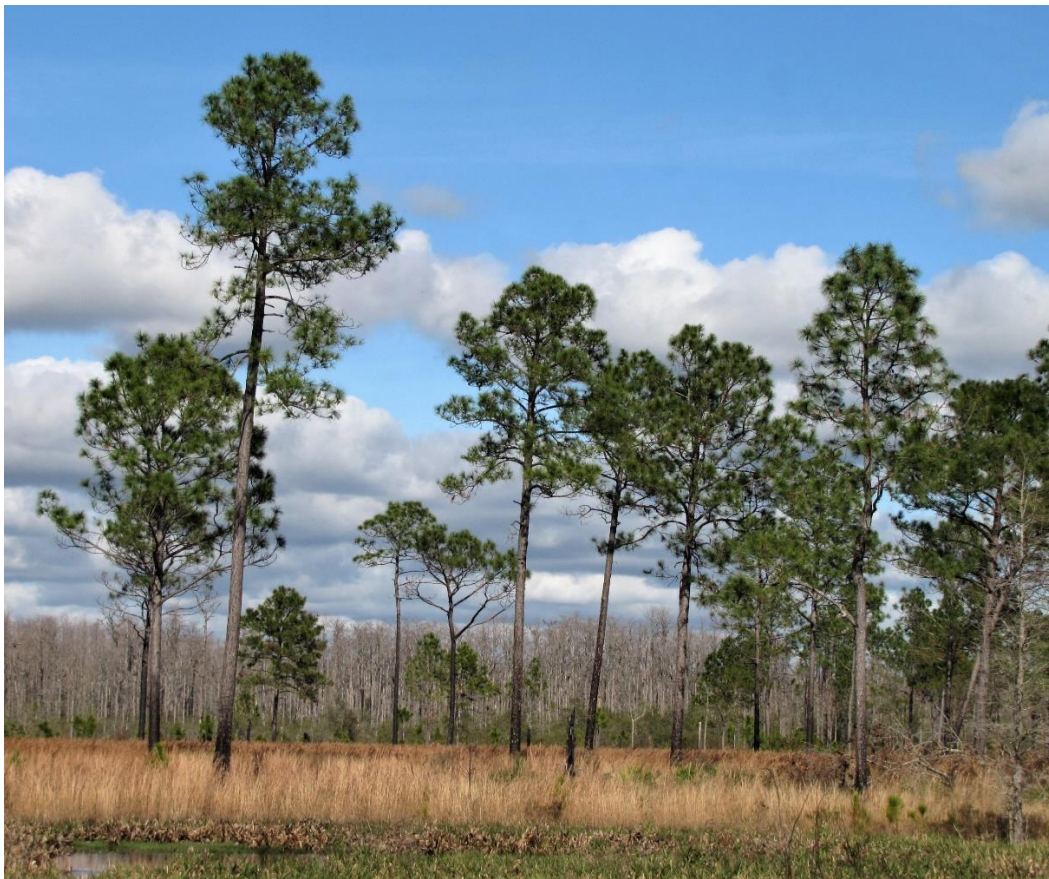
Figure 5. Hydric pine flatwoods restoration, facing northwest (11/22/20)