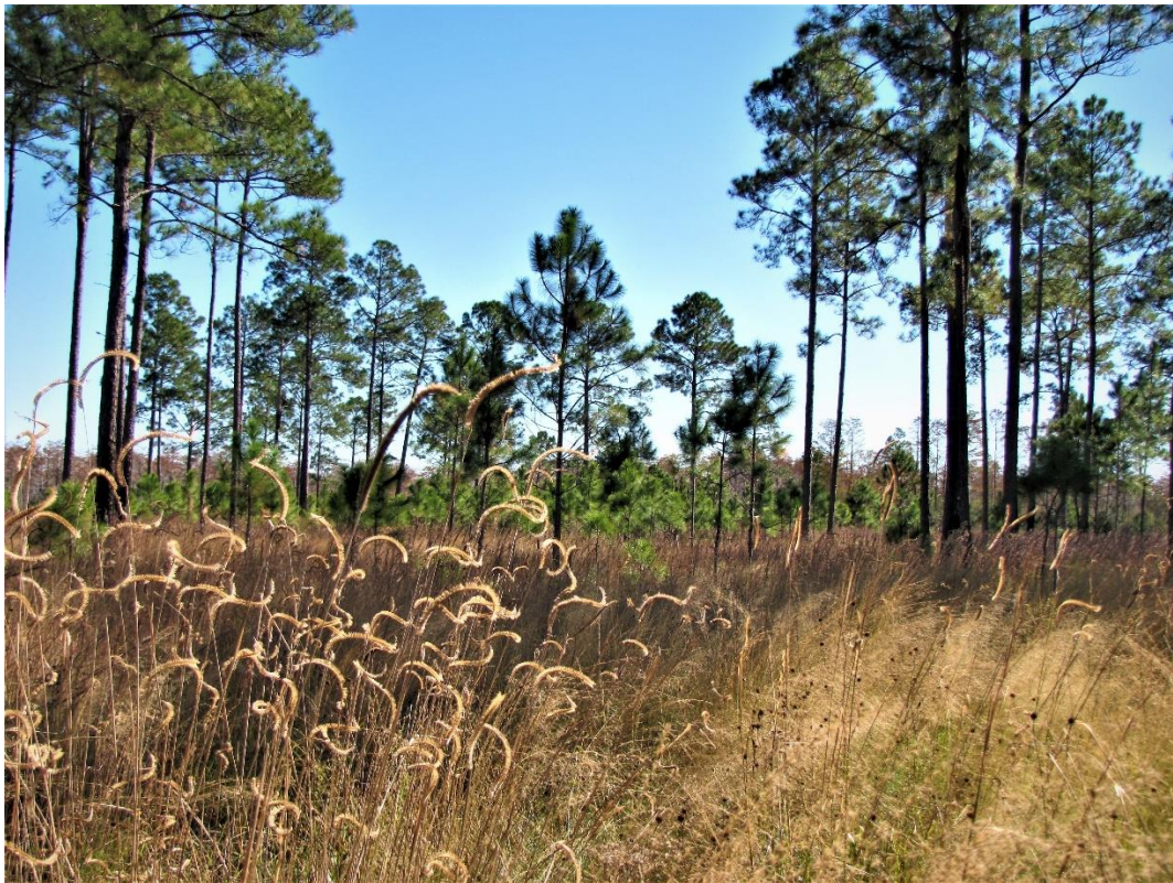
Figure 7. Hydric Pineflatwoods restoration, facing northeast (11/22/20)