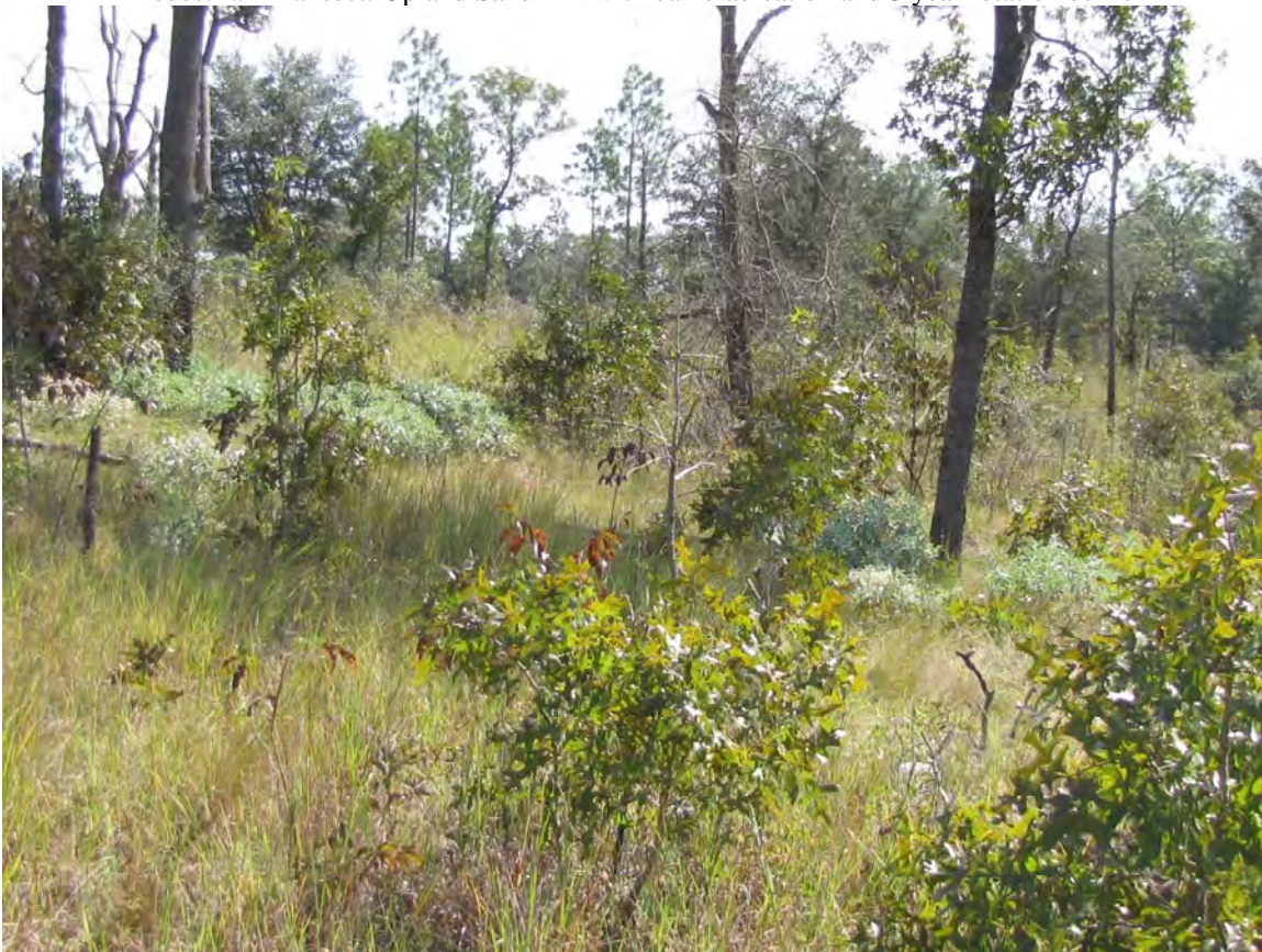
(09-24-2012) M1 Sandhill above pond facing west towards east towards edge of property (Enhancement)