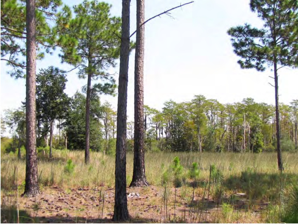
M10: Facing East, 09-24-2012. Hydrich Pine Flatwoods restored from Titi swamp. Gyro-Trac followed by intense shrub reduction. Planted wire and tooth ache grass and hydrich pine flatwood wildflowers. (Restoration)