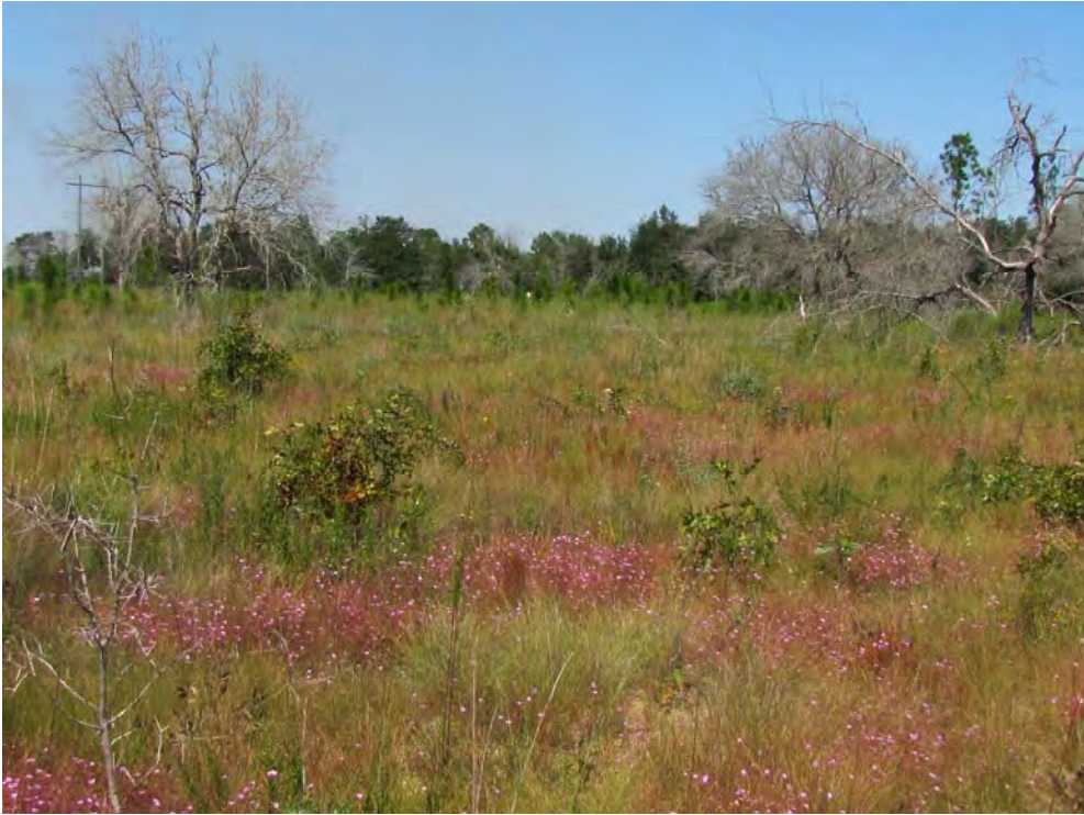
M5, 09-24-2012: Facing West. Sandhill restored from slash pine plantation. Note dense wiregrass regeneration and diverse understory. (Enhancement)