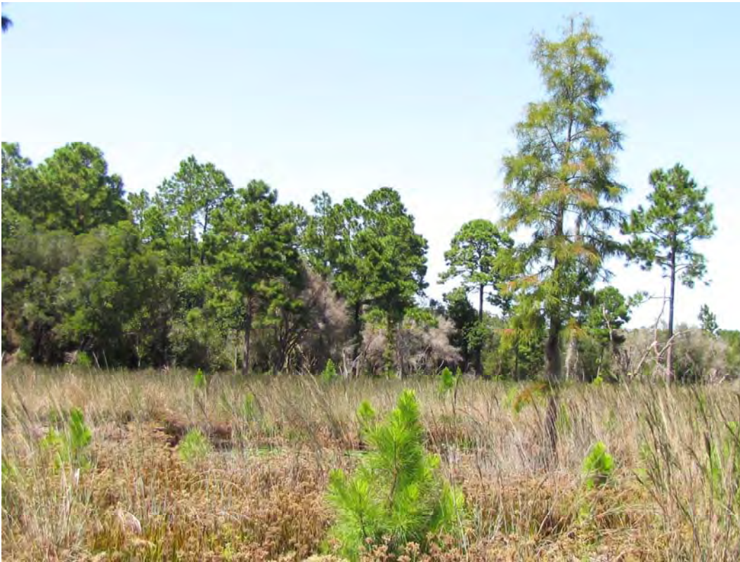
M10: Facing t, 09-24-2012. Hydrich Pine Flatwoods restored from Titi swamp. Gyro-Trac followed by intense shrub reduction. Planted wire and tooth ache grass and hydrich pine flatwood wildflowers. Restoration