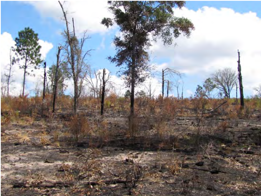
M12: 9-27-2012 Facing Northeast: Sandhill restoration from Oak Hummock, just burned 9/26/12 Restoration