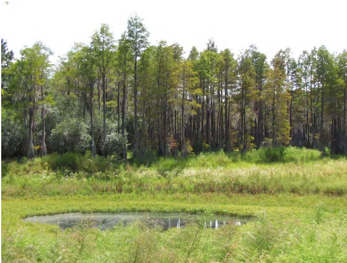
M9:09-27-2012 Facing West. Green Pond with some water. Extended drought has left most ponds near total dry down. Cypress are healthy and appropriate vegetation for drought conditions. (Preservatioj)

** New Observation, *not observed in 2009