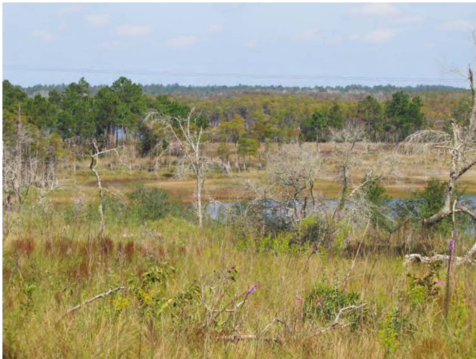
M13: 10-09-12. Facing Northeast. Sandhill overlooking Black Pond. Good wiregrass cover Enhancement