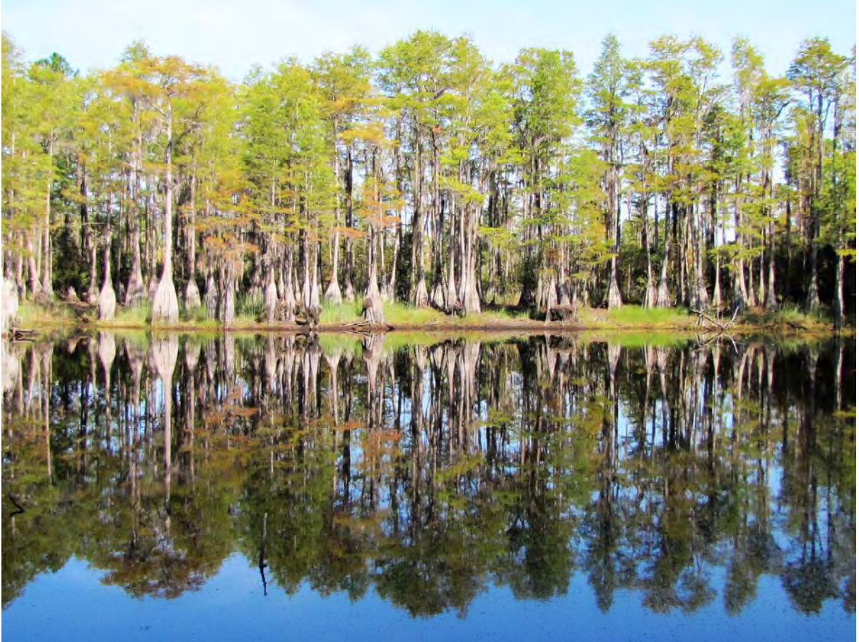
M8: 09-28-2012. Facing North, Water in pond, cypress appear healthy. Recruitment of cypress found in dry down areas surrounding pond. (Preservation).