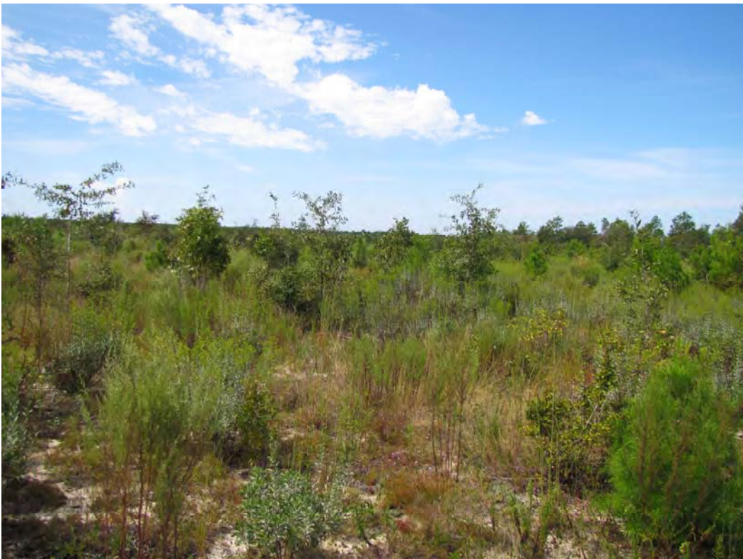
09-26-2012 M2: Sandhill restored from sand pine plantation, post burn and planting (Restoration)