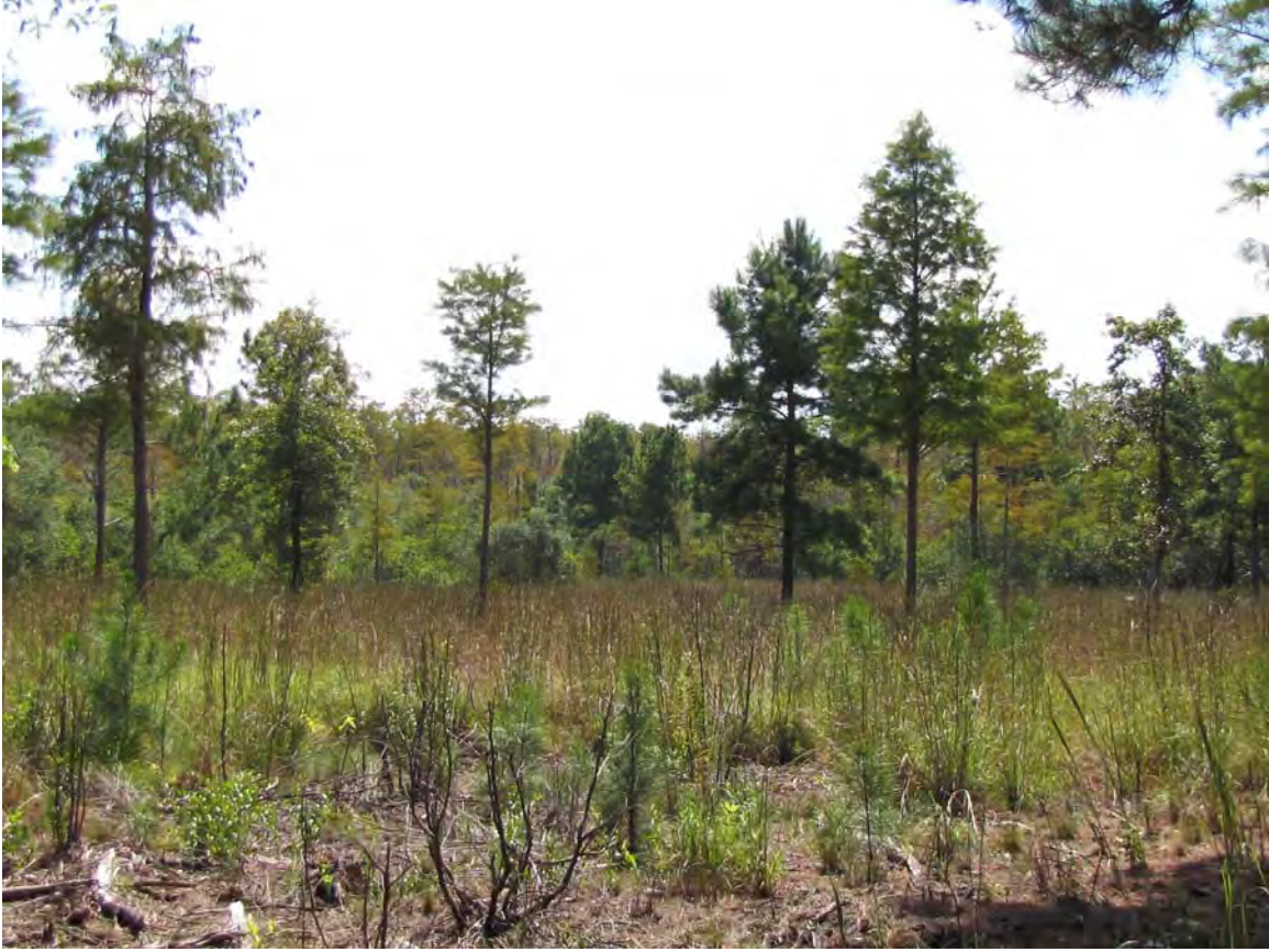
M11_09-27-2912 Facing Southwest: Hydrich Pine Flatwoods restoration, planted wire grass.