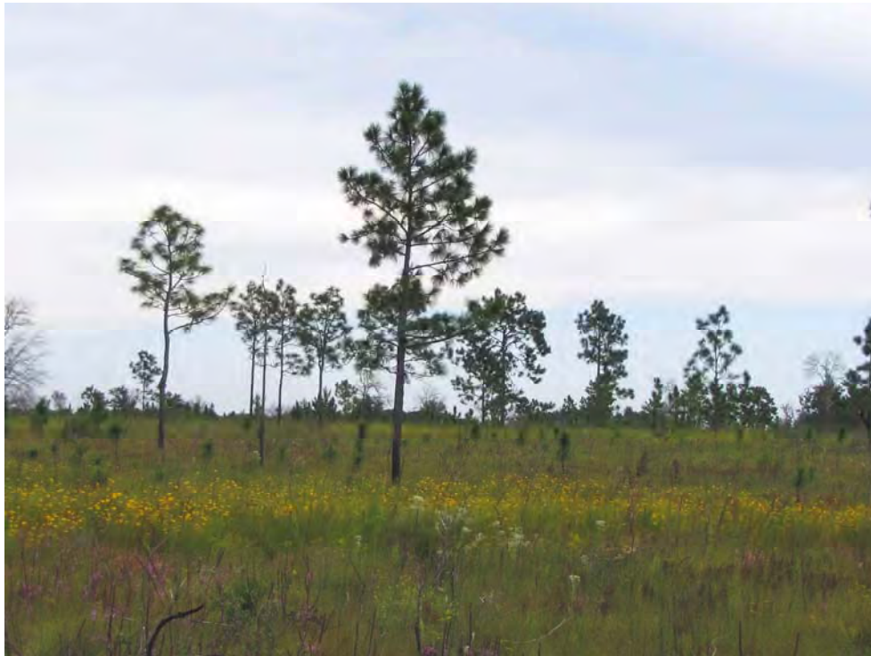
M3: 09-26-2012- Sandhill above Cat Pond facing North. Reduced LLP seedling density since fire in 2011 (Enhancement)