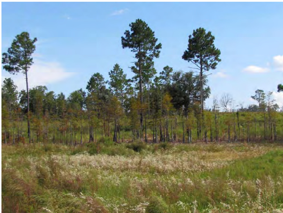
M6: 09-24-2012. Facing South. Cypress fringe with dog fennel and blue maidencane in dry pond (Preservation)