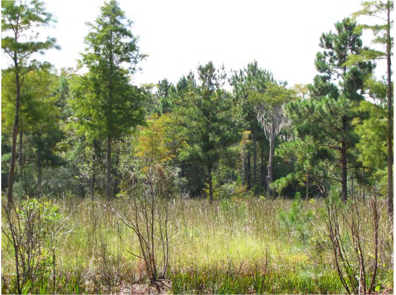
M11: 09-27-2012 Facing West. Hydric Pine Flatwoods Restoration Area, shrub reduction and planting of wire grass.