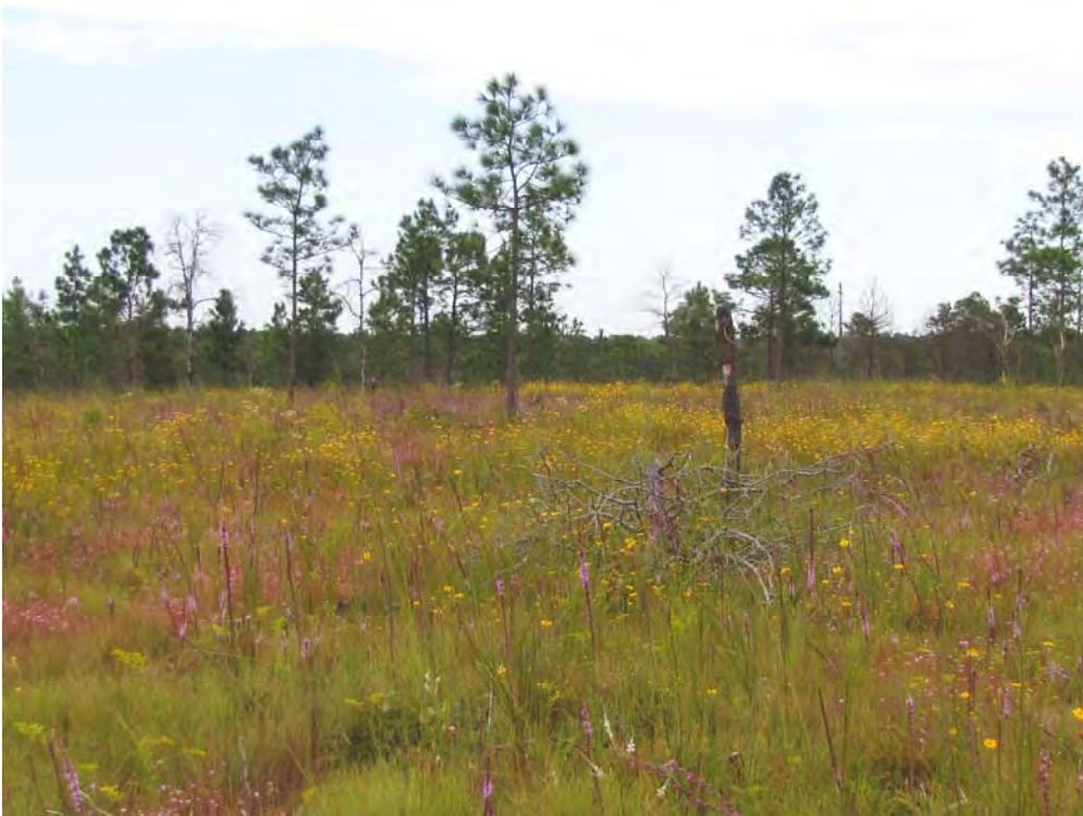
M4. 09-26-2012 Facing west. Sandhill Wiregrass and wildflowers, upland south of Little Deep Edge (Restoraion)