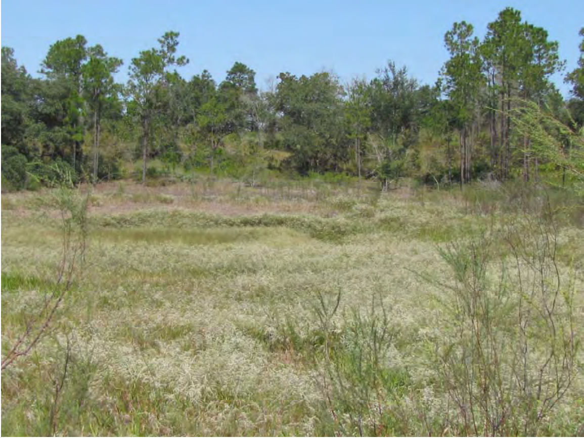
(09-24-2012) M1 facing West, pond mostly dry, note smooth barked St. John's wort at edge. (Preservation)