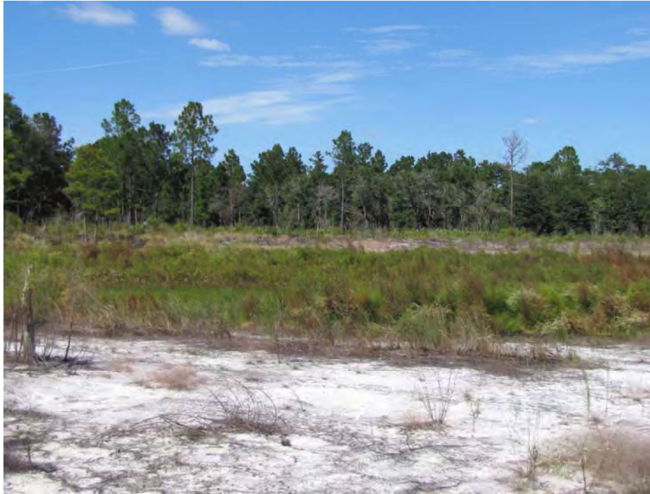
M6: 09-24-2012. Facing East. Garret Pond is dry due extended drought, white sand typical of karst ponds within region. Area burned 9/23/2012 in preparation for planting of additional wire grass and tooth ache grass. (Preservation/enhanced edge)