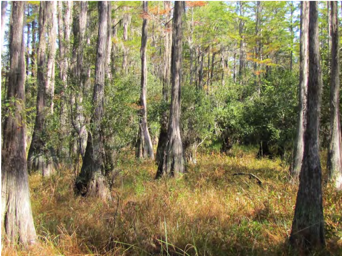
M8: 09-28-2012. Facing North, forested system flowing into Dry Pond from Pine Log Creek. Flow path with shallow water 1-3" deep. (Preservation)

*** Threatened or Endangered Species, ** New Observation, * Observed previously, but not seen in current survey