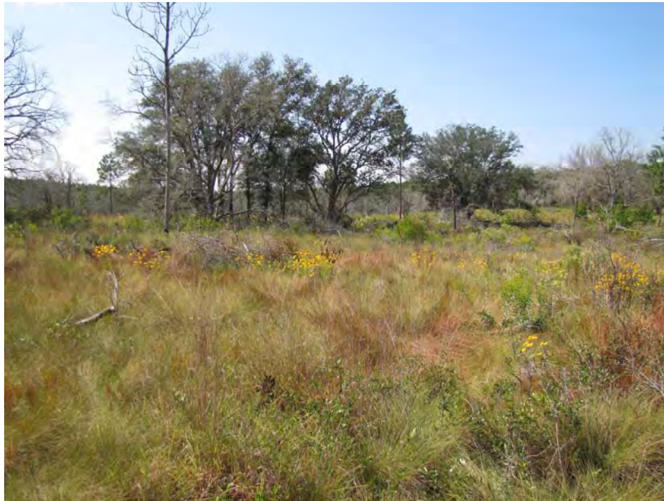
M13: 10-09-12 Facing Northwest. Sandhill with live oak clump, great wiregrass cover. Enhancement