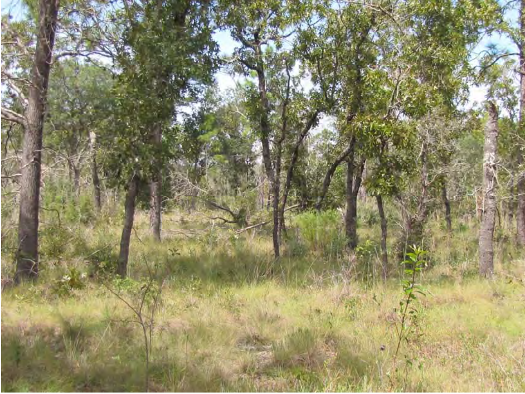
09-26-2012 M2: Turkey Oak dominated sandhill, management Unit 10, facing North (Enhancement)