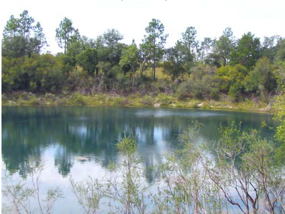
M3: 09-26-2012- Cat Pond facing West. Endangered Smooth-barked St. John's Wort in foreground (Preservation)