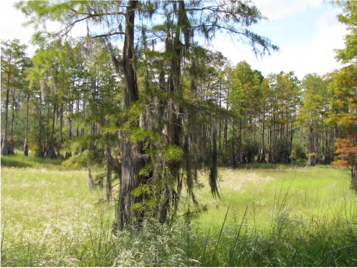
M9:09-27-2012 Facing Northwest. Green Pond with without water. Extended drought has left most ponds near total dry down. Cypress are healthy and appropriate vegetation for drought conditions (Preservation)