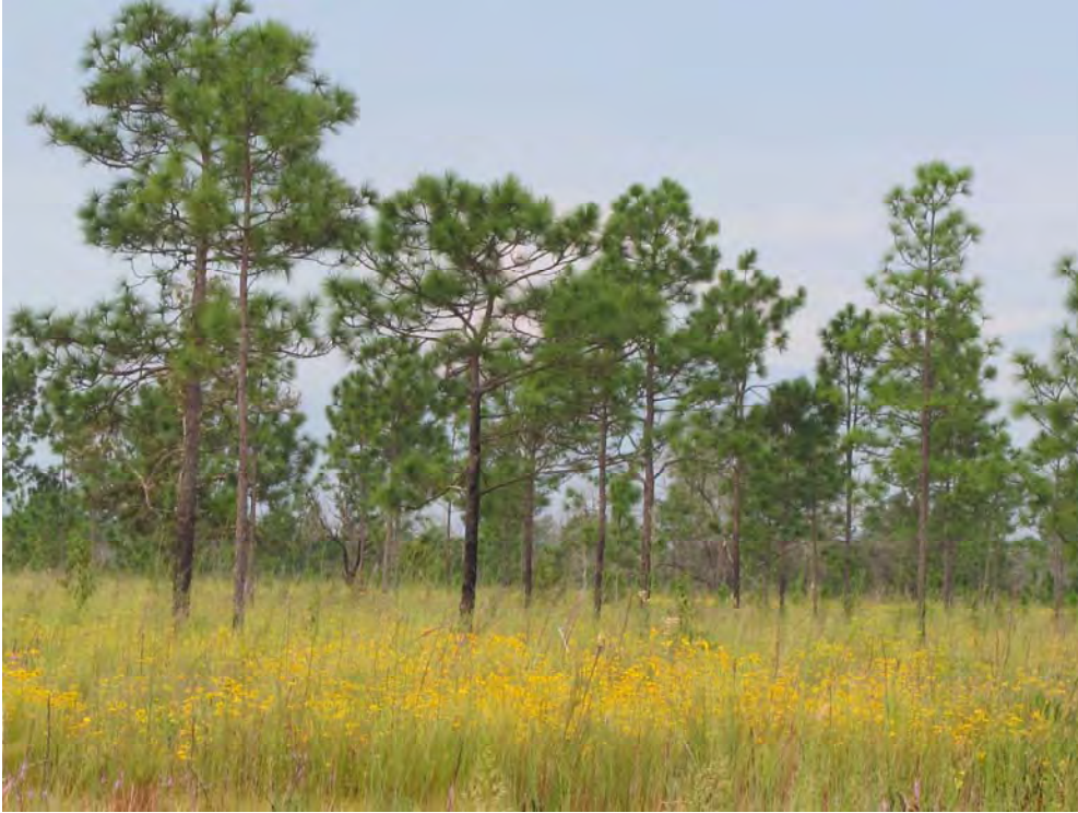
M4. 09-26-2012 Facing southwest. Sandhill Wiregrass and wildflowers, upland next to Little Deep Edge. (Restoration)