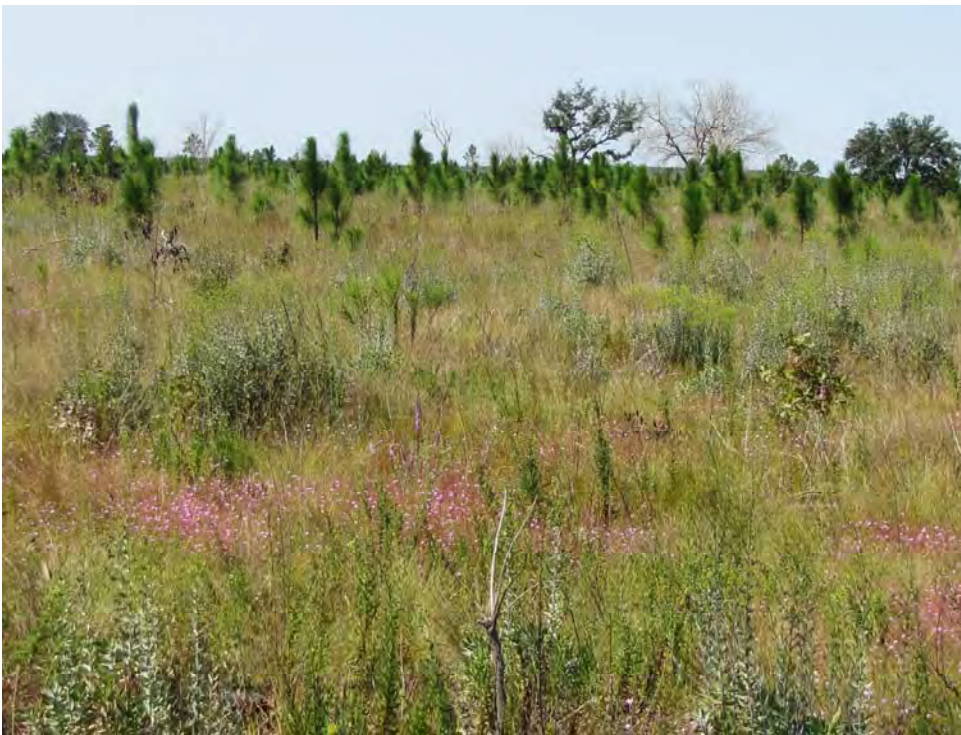
M5, 09-24-2012: Facing South. Sandhill restored from slash pine plantation. Note dense wiregrass regeneration along with planted long leaf pine. (Enhancement)