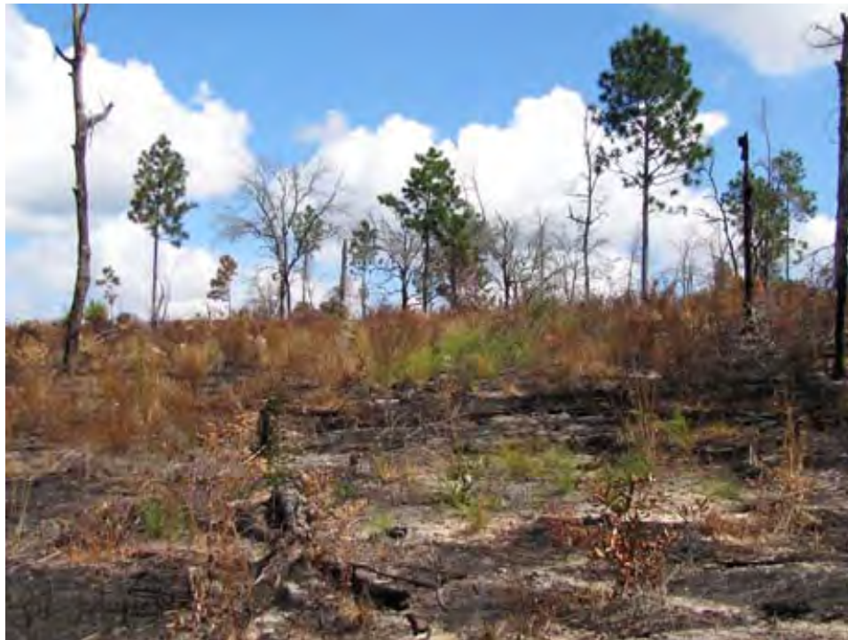
M12: 9-27-2012 Sandhill restoration from oak hummock, just burned 9/23/12 Restoration