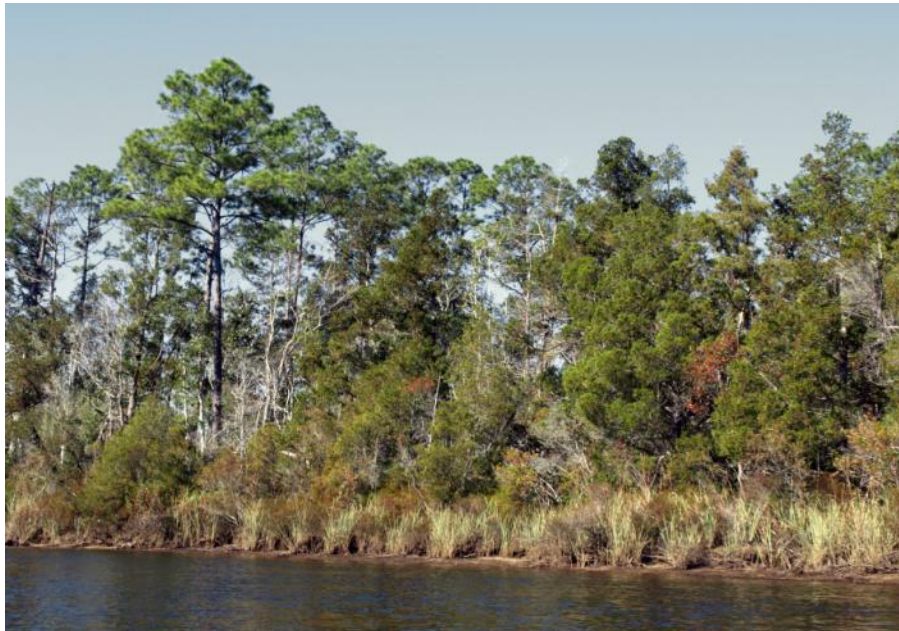
Brewer Tract (Backwater River); 12/3/08