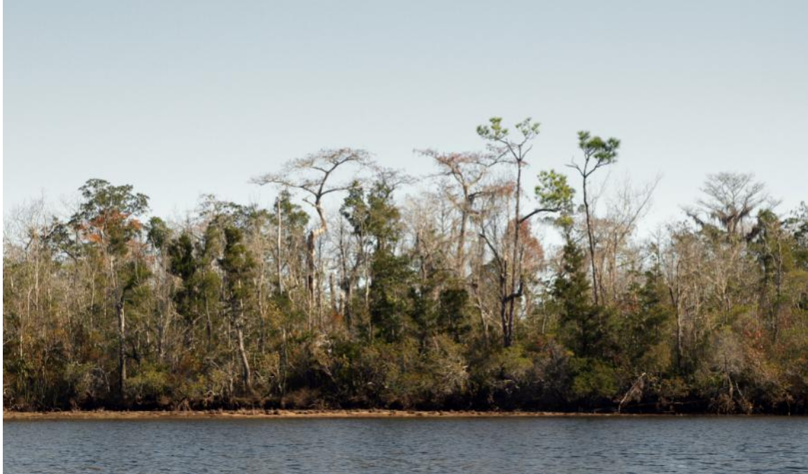
Brewer Tract (Backwater River); 12/3/08