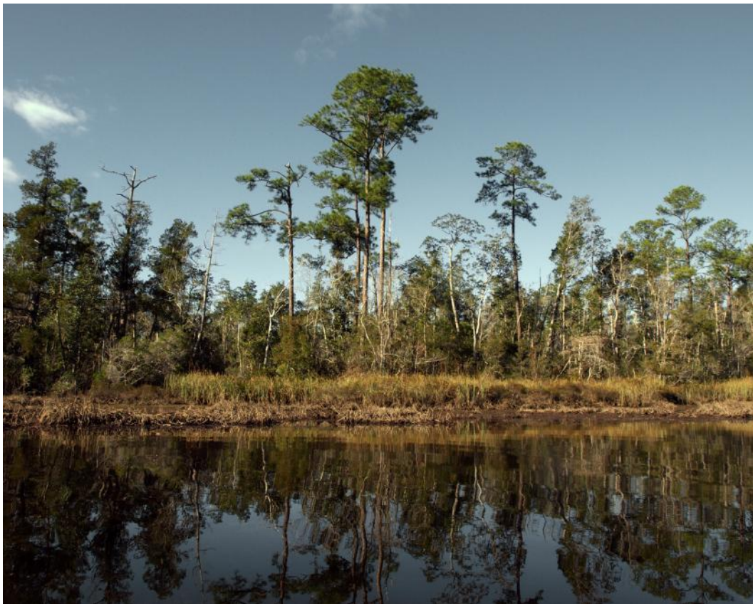
Brewer Tract (Backwater River); 12/3/08