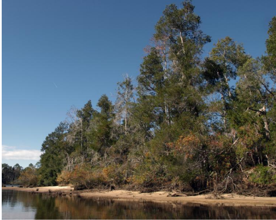
Brewer Tract (Backwater River); 12/3/08