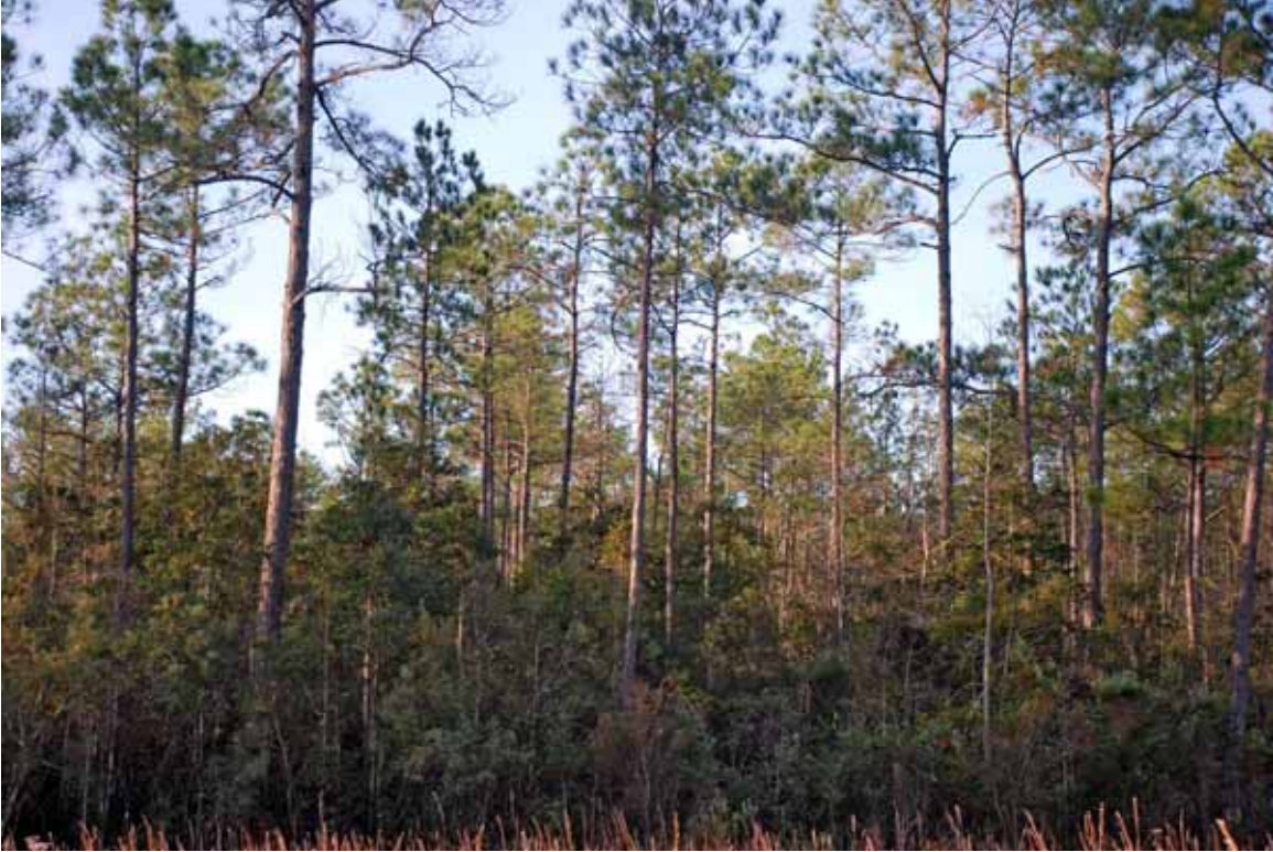
Perdido WMA (US 90 Escambia Weigh Station Mitigation Polygon); 12/4/07