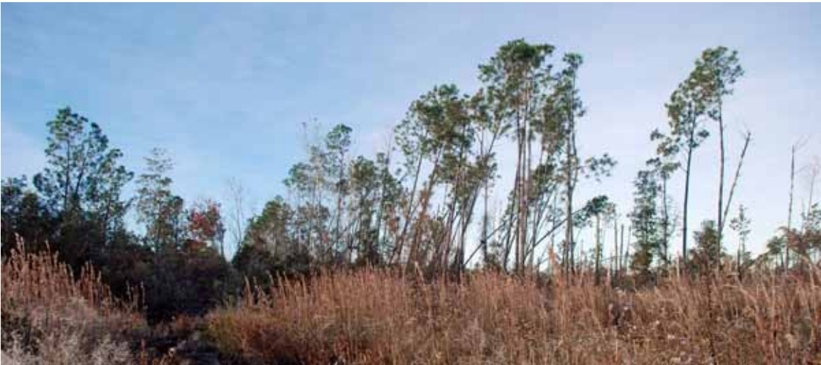
Perdido WMA (US 90 Escambia Weigh Station Mitigation Polygon); Tree Damage Caused by Hurricane Ivan (2004); 12/4/07