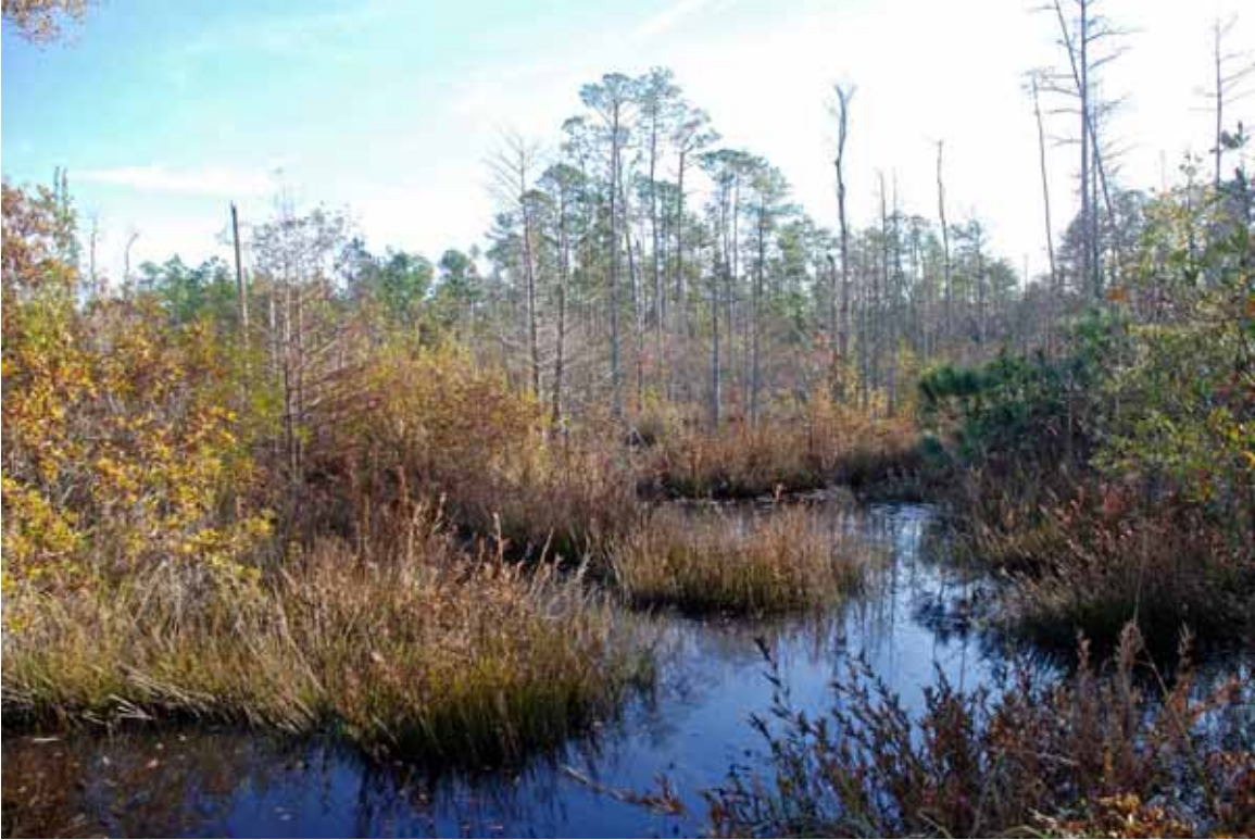
Perdido WMA (US 90 Escambia Weigh Station Mitigation Polygon); 12/4/07