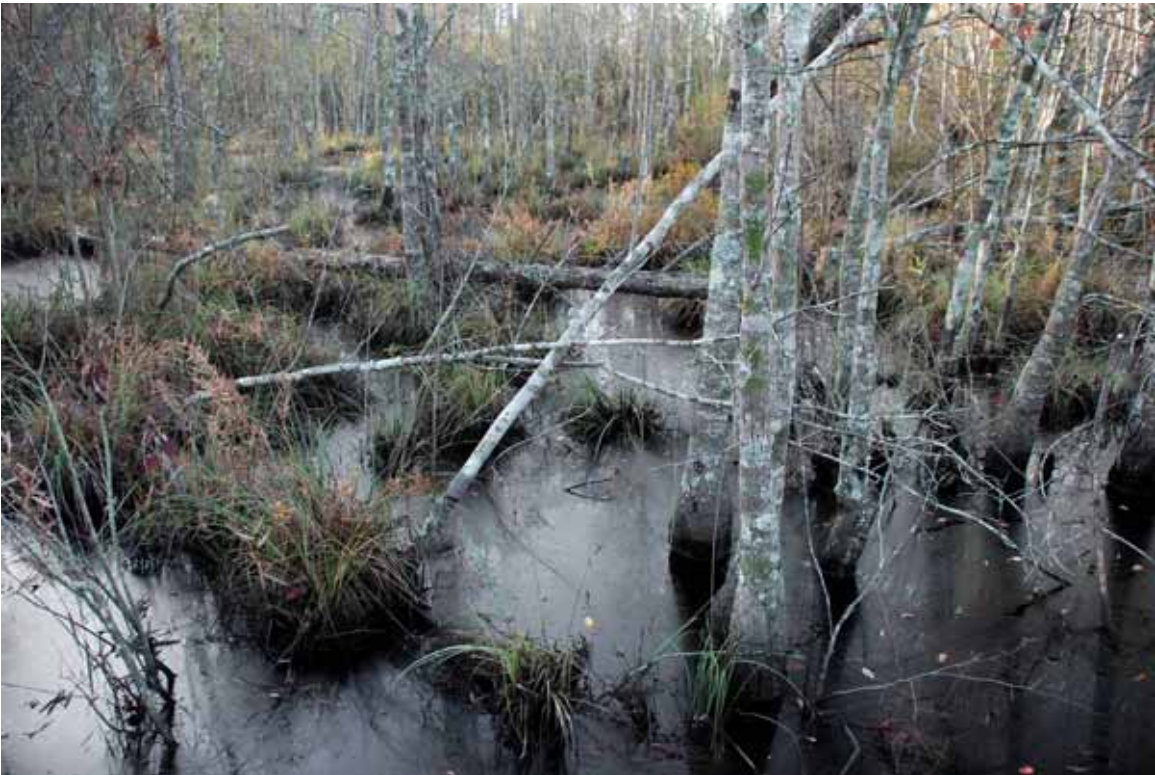
Perdido WMA (US 90 Escambia Weigh Station Mitigation Polygon); 12/4/07