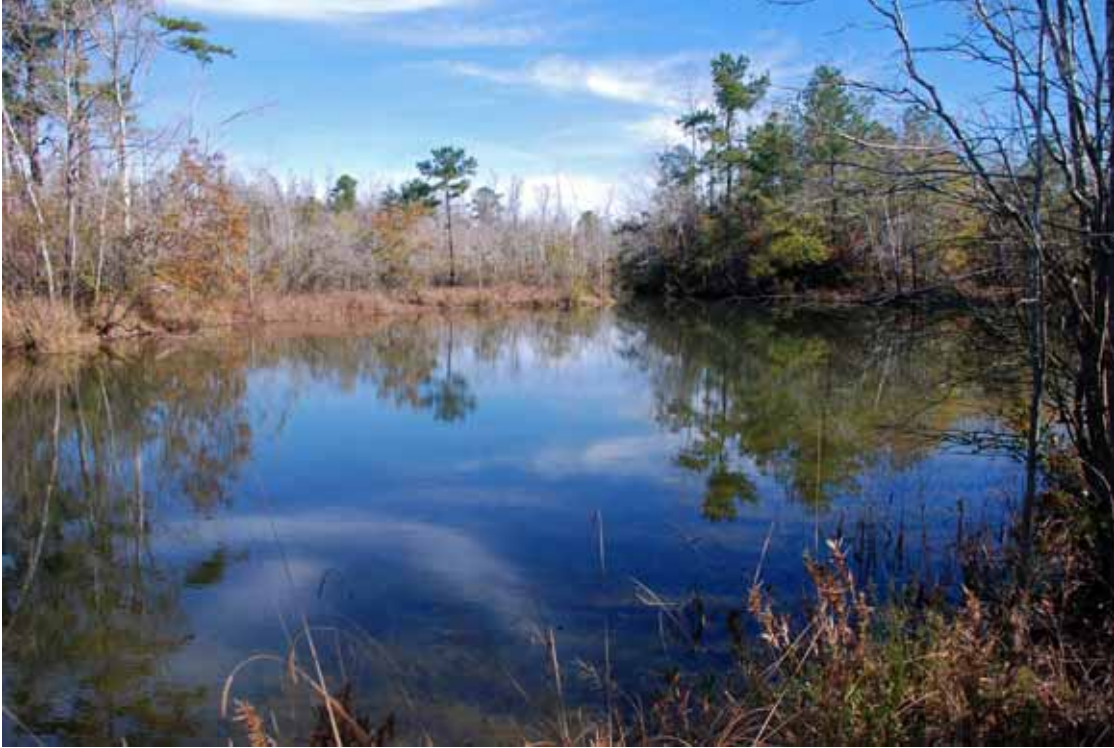
Bluff Springs; 12/4/07; Pond Created from 1940s Sand Mining