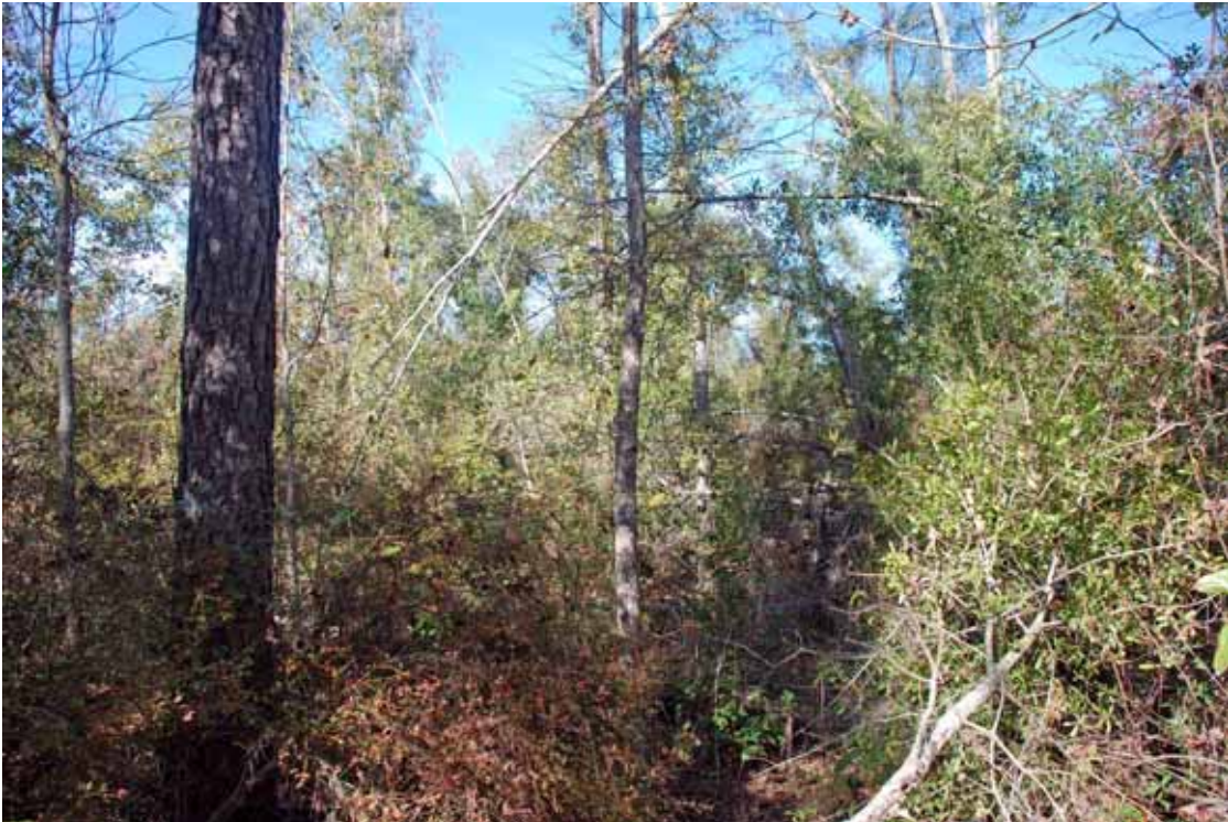
Bluff Springs; 12/4/07; Uplands