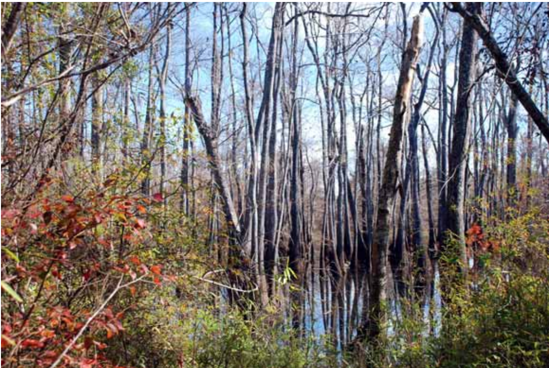
Bluff Springs; 12/4/07; High Quality Tupelo and Cypress Swamp