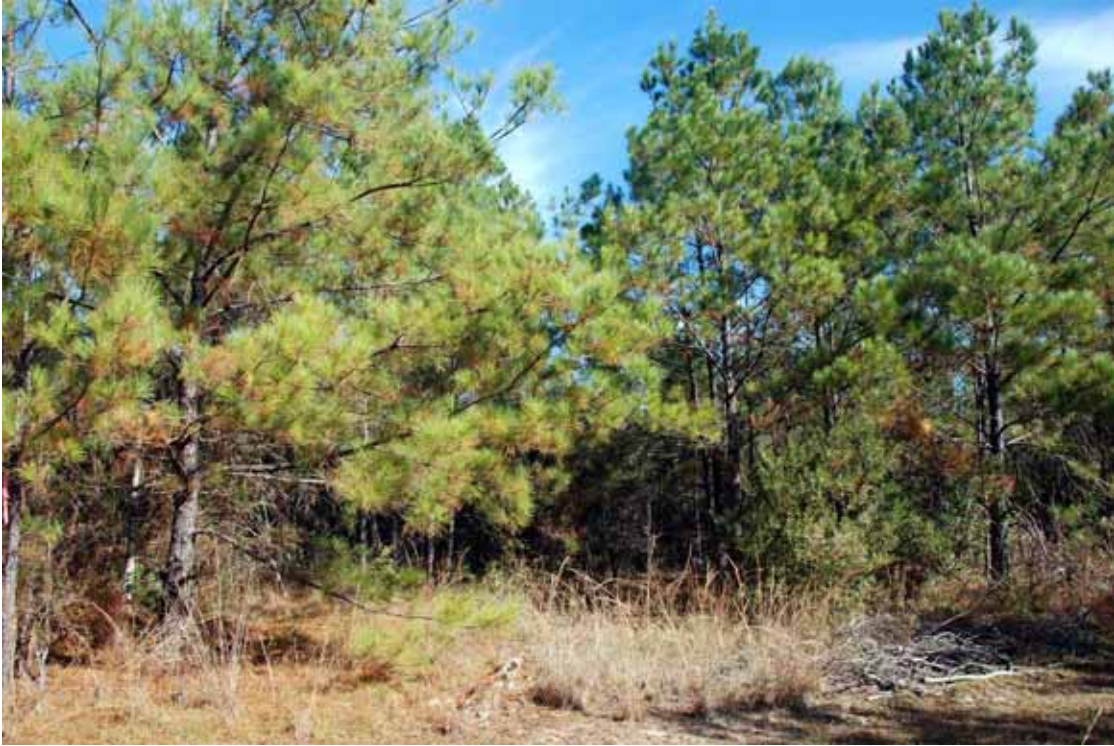
Bluff Springs; 12/4/07; Uplands