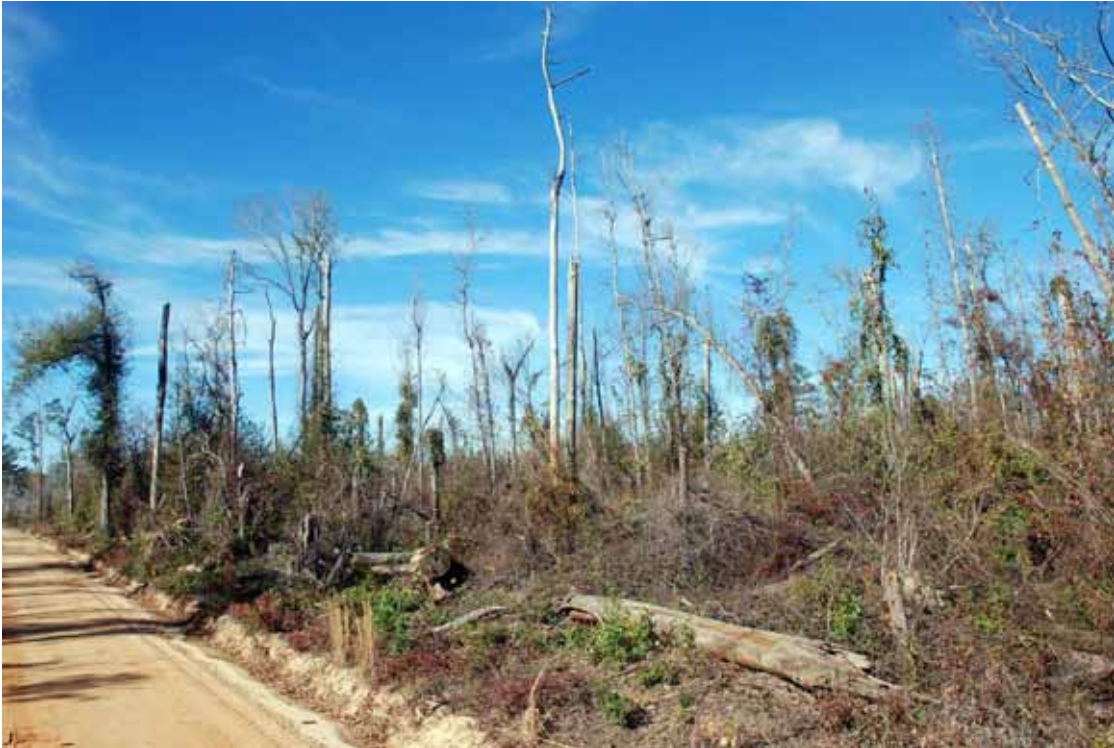
Bluff Springs; 12/4/07; Hurricane Ivan (2004) Damage