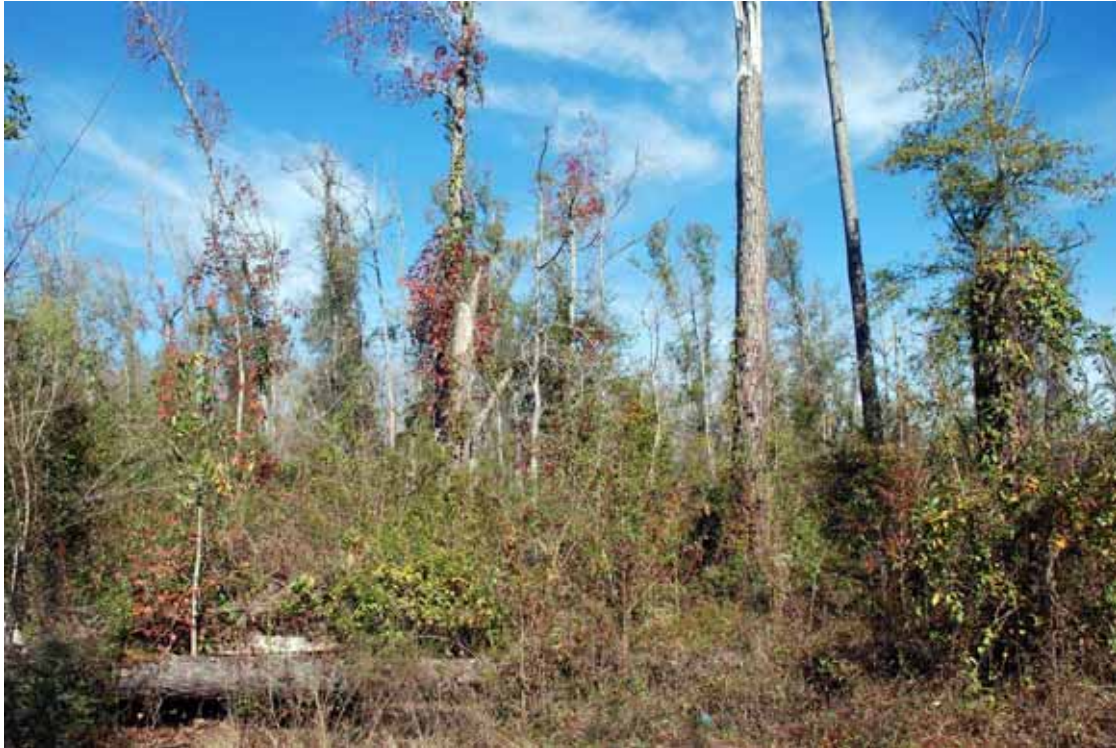
Bluff Springs; 12/4/07; Bottomland Forest (Impacted by Hurricane Ivan—2004)