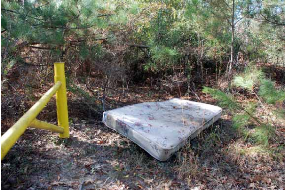
Bluff Springs; 12/4/07; Minor Trash Dumping