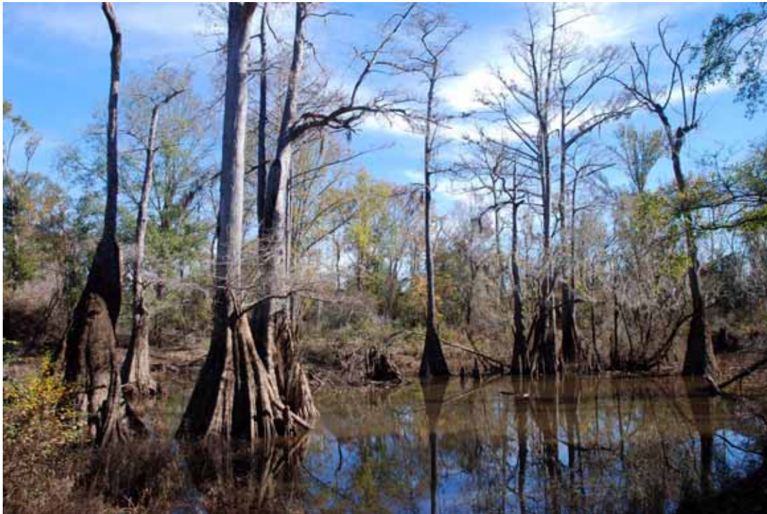
Bluff Springs; 12/4/07; Cypress Slough