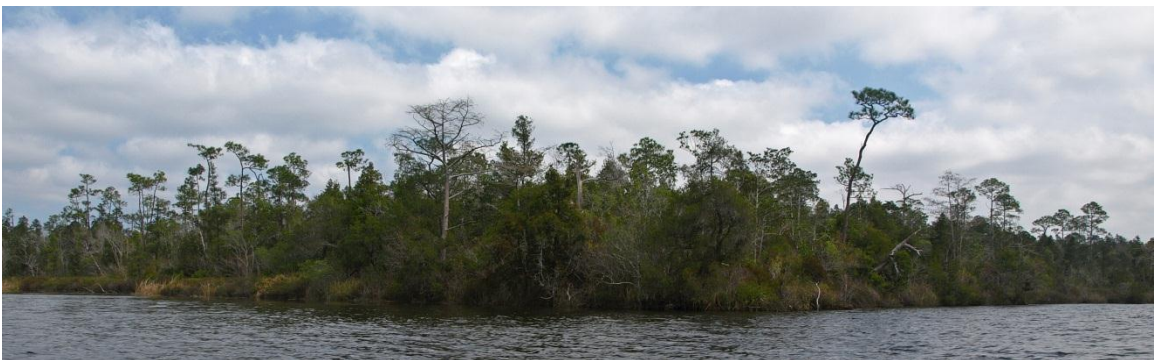
Representative Photos of Brewer Tract (Blackwater River); 3/8/2011