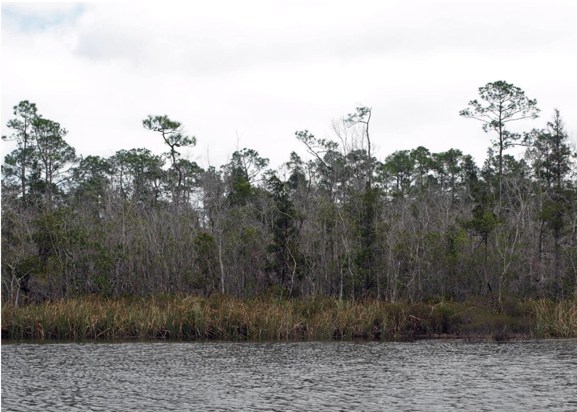
Representative Photos of Brewer Tract (Blackwater River); 3/8/2011