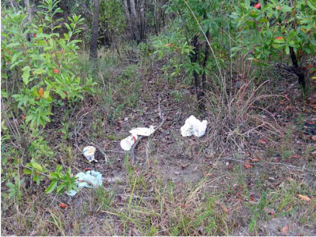
Bluff Springs; 10/22/08; Minor Trash