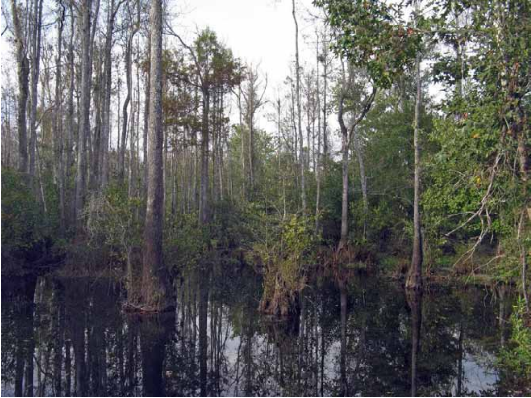
Bluff Springs; 10/22/08; Cypress / Tupelo Slough