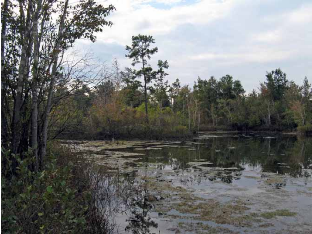
Bluff Springs: 10/22/08; Pond Created from 1940s Sand Mining