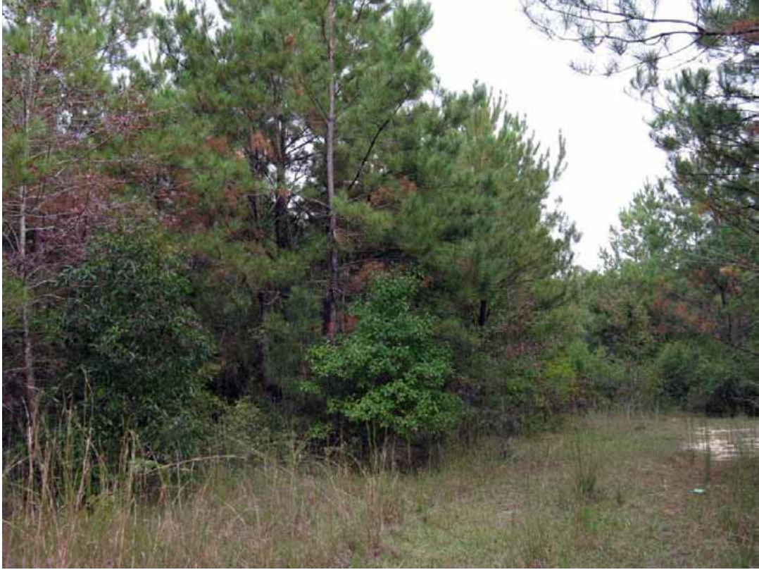
Bluff Springs; 10/22/08; Uplands