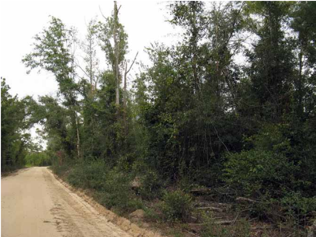
Bluff Springs; 10/22/08; Hurricane Ivan (2004) Damage to Uplands