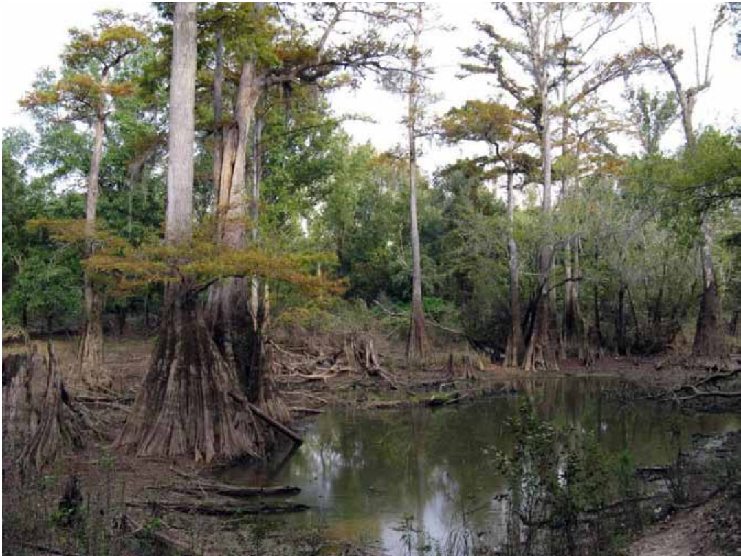
Bluff Springs; 10/22/08; Cypress Slough