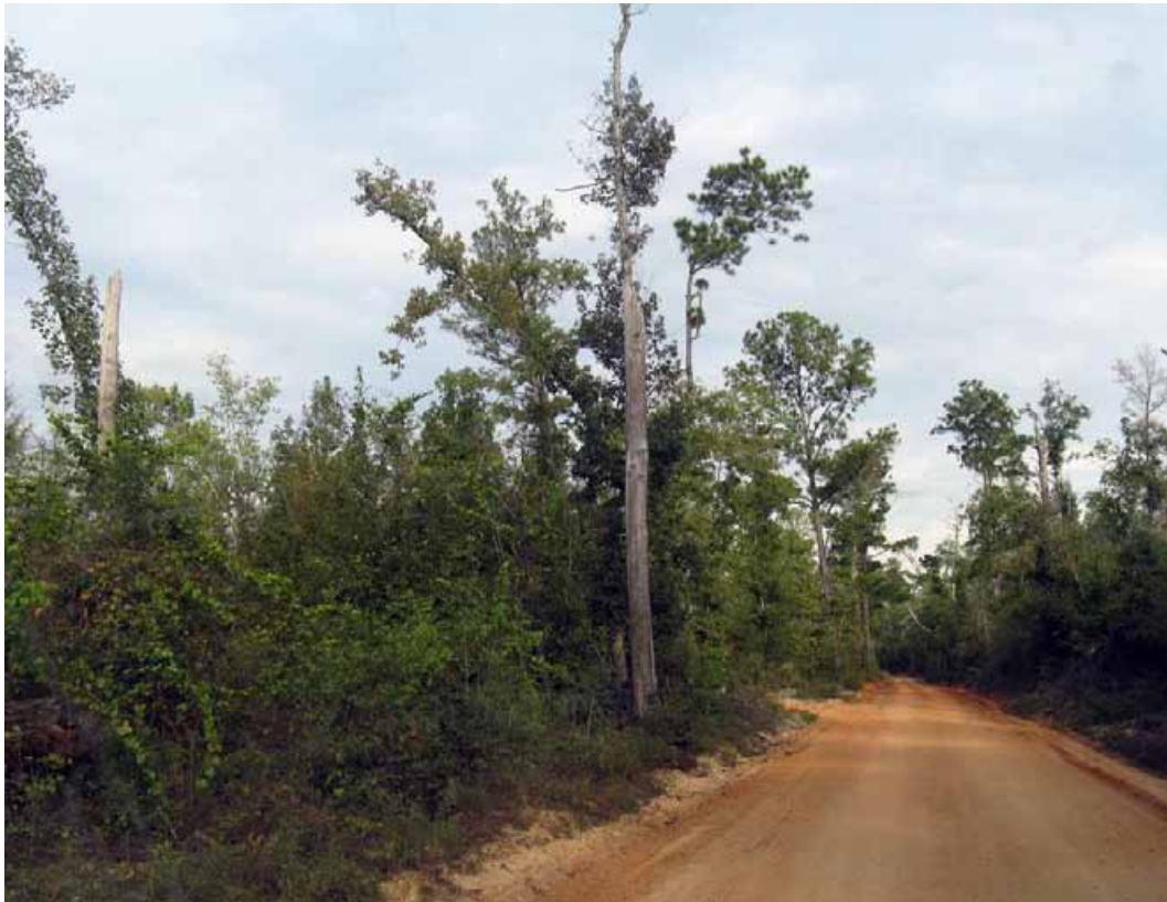
Bluff Springs; 10/22/08; Hurricane Ivan (2004) Damage to Uplands