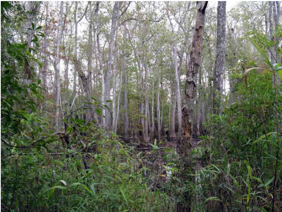
Bluff Springs; 10/22/08; High Quality Tupelo and Cypress Swamp