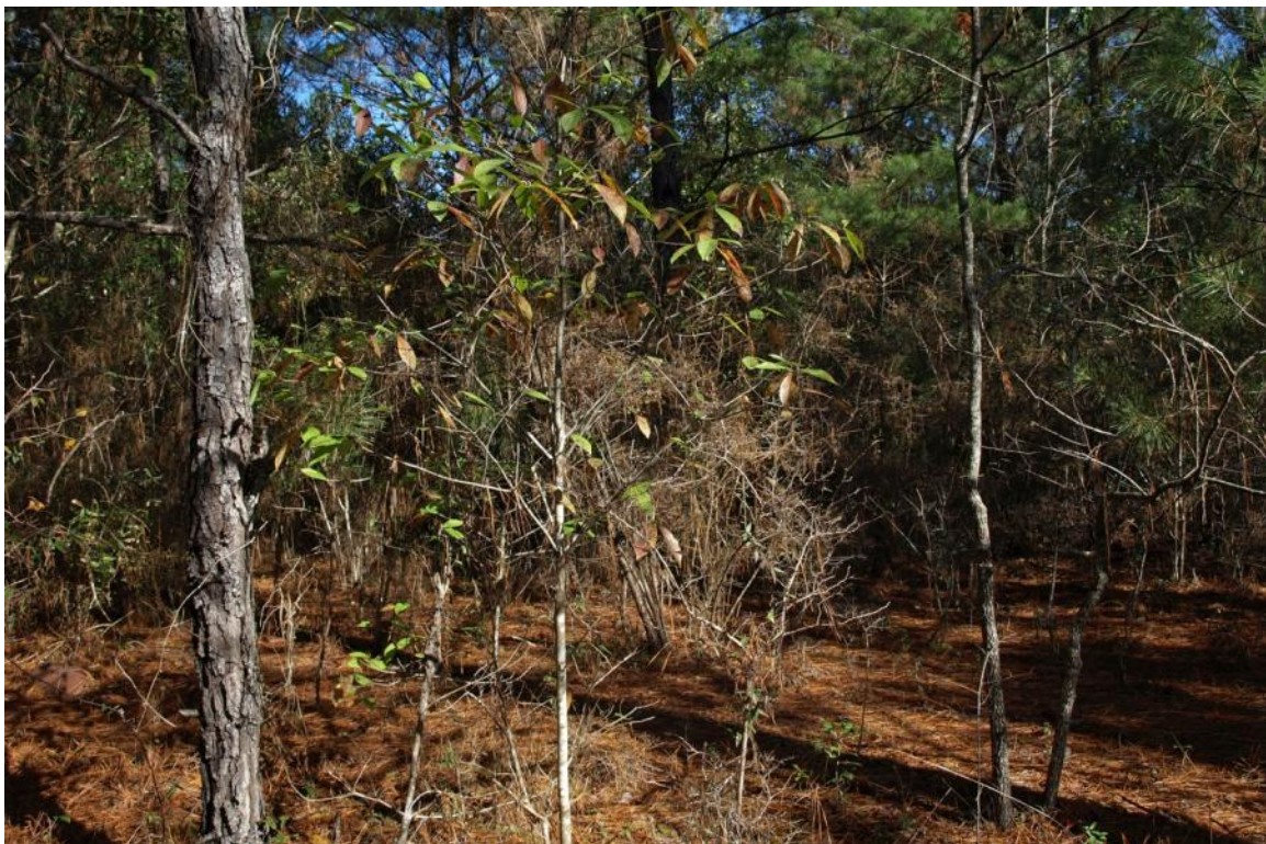
Bluff Springs: 12/16/09 – Upland Buffers in Need of Prescribed Fire