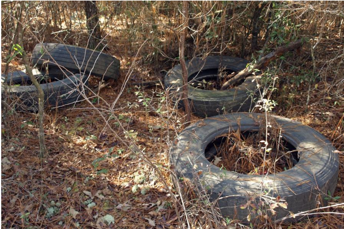
Bluff Springs: 12/16/09 – Minor Trash Dumping