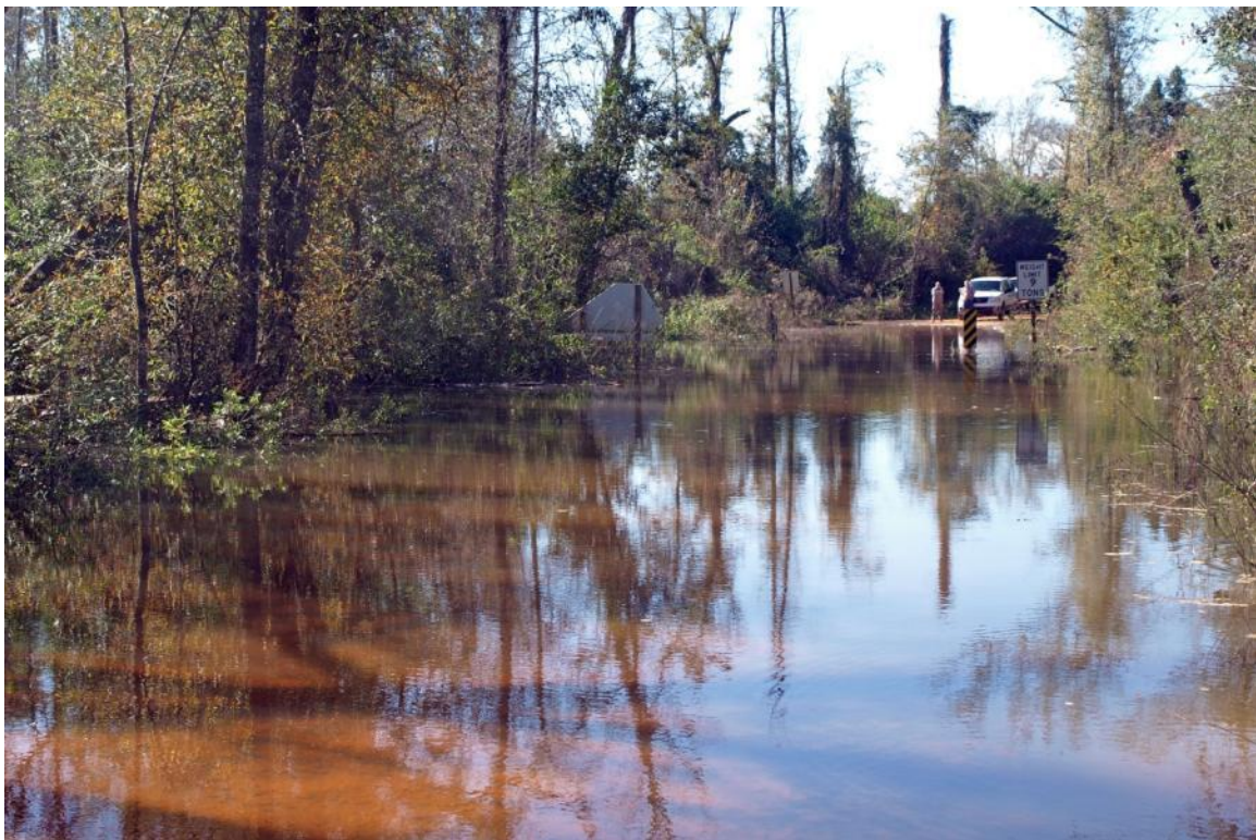
Bluff Springs: 12/16/09 –Flooding of Access Road