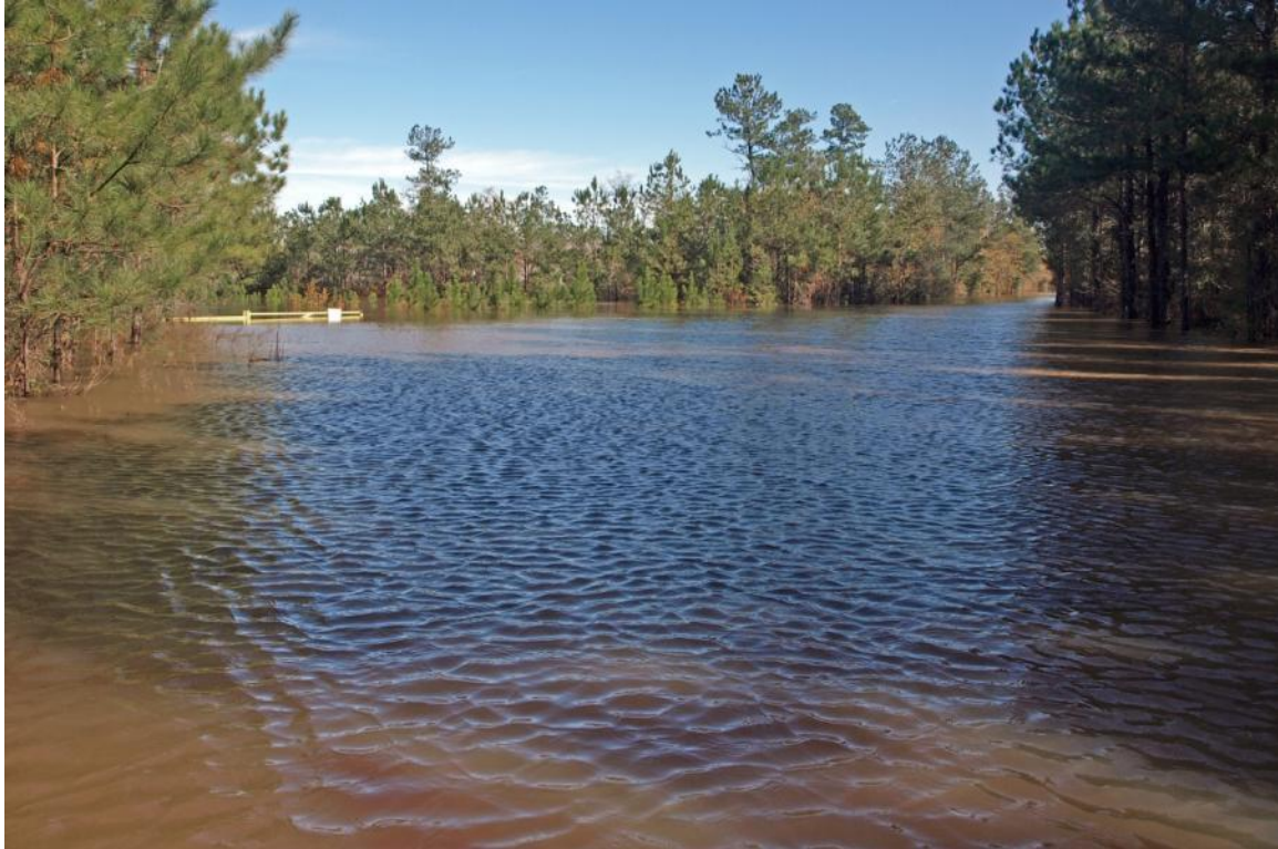
Bluff Springs: 12/16/09 –Flooding of Access Road