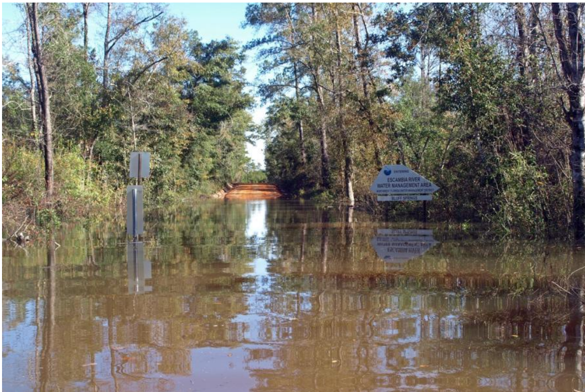
Bluff Springs: 12/16/09 – Flooded Access Road