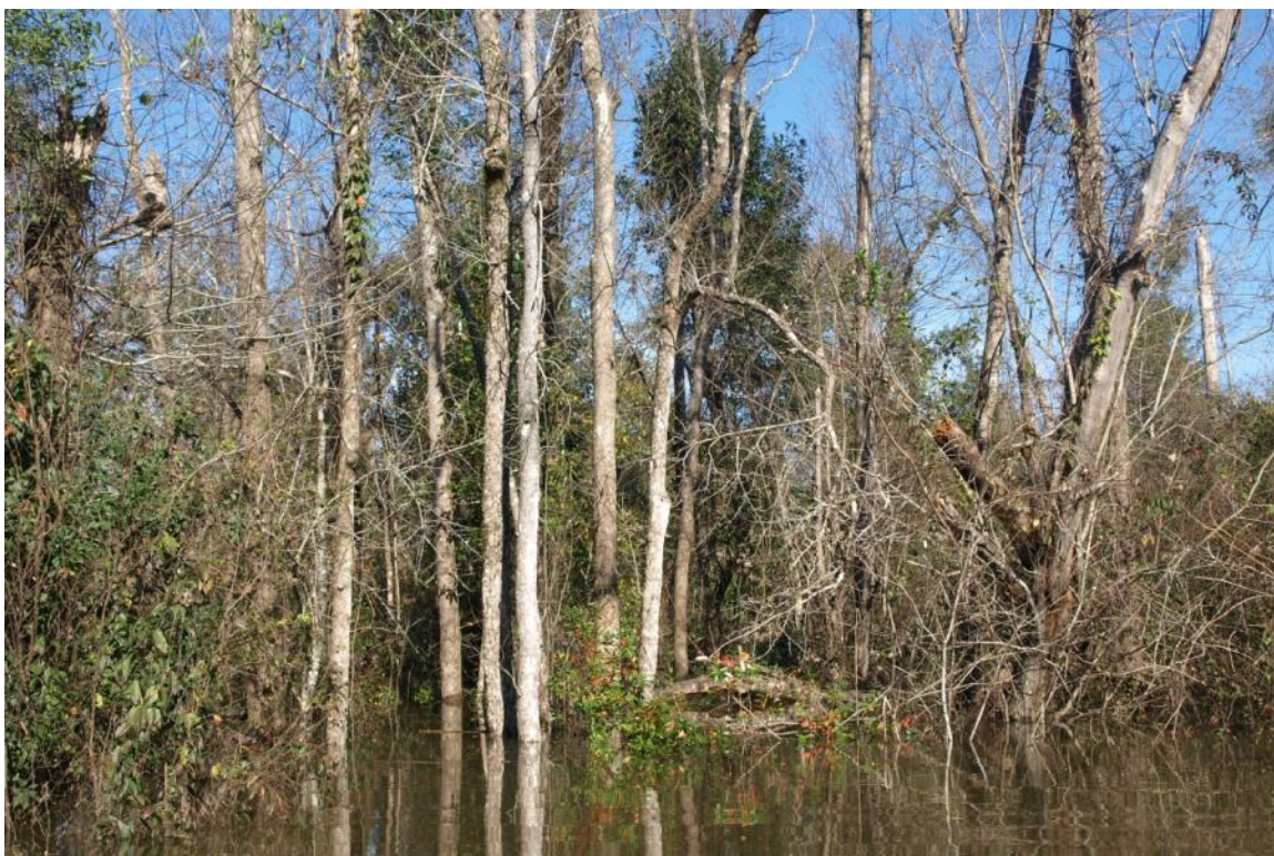
Bluff Springs: 12/16/09 – Flooded Slough