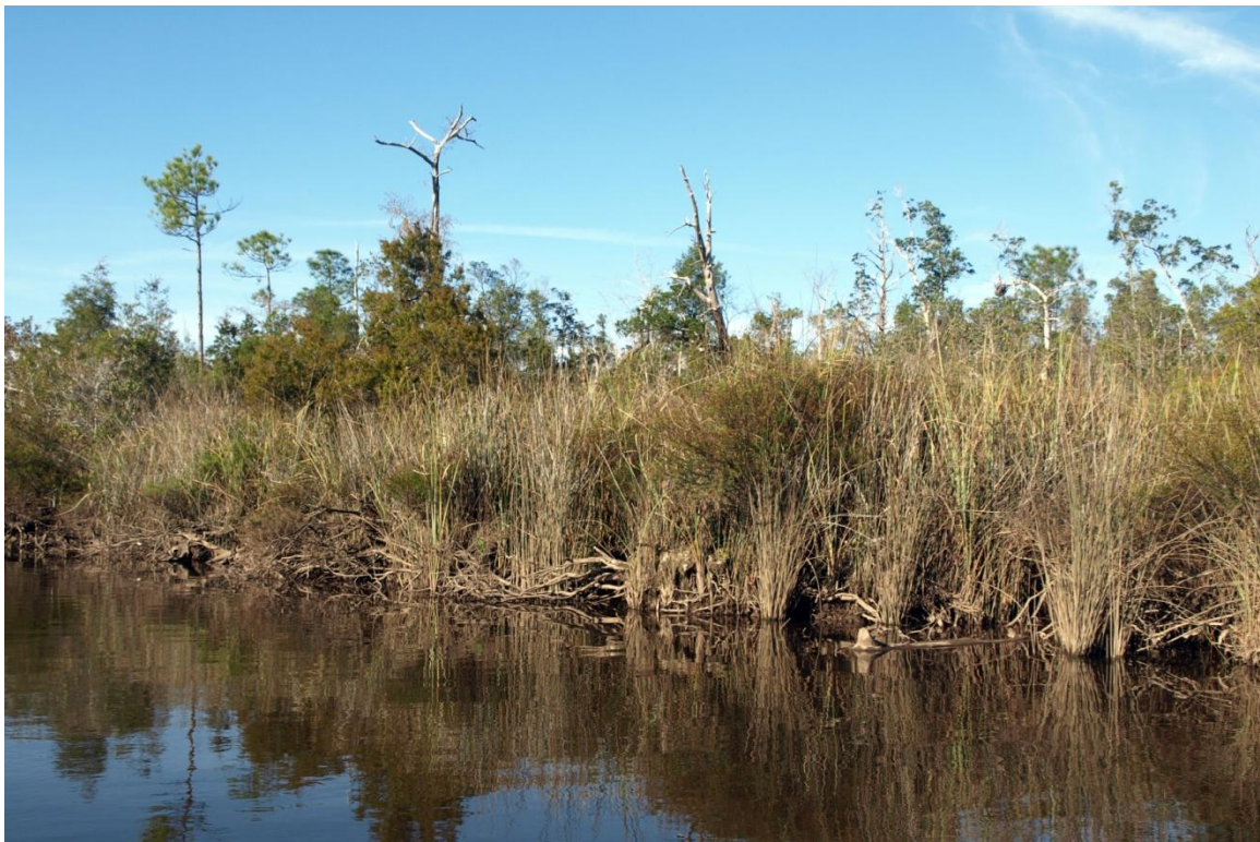
Brewer Tract (Backwater River); 12/16/09