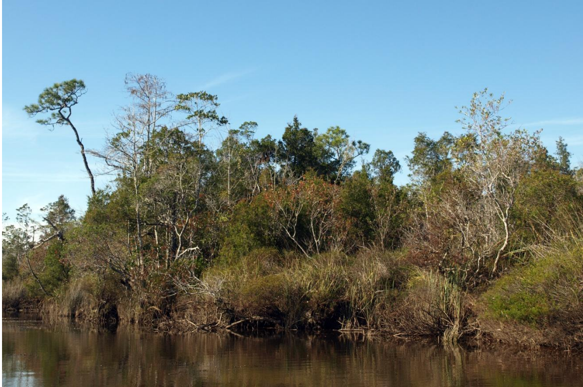
Brewer Tract (Backwater River); 12/16/09