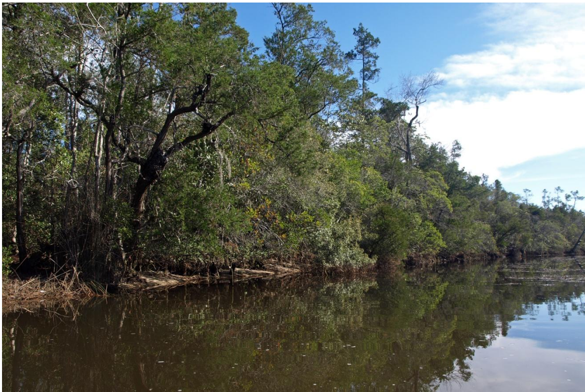
Brewer Tract (Backwater River); 12/16/09