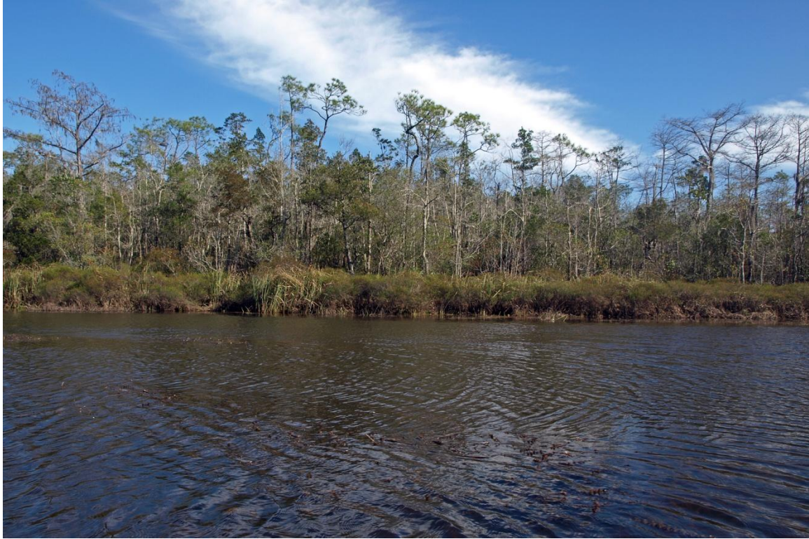
Brewer Tract (Backwater River); 12/16/09