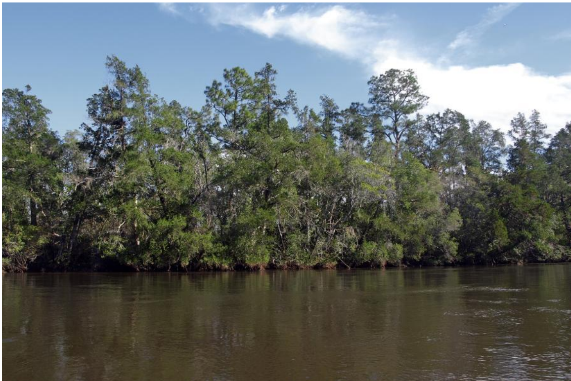
Rogers Tract (Backwater River); 12/16/09