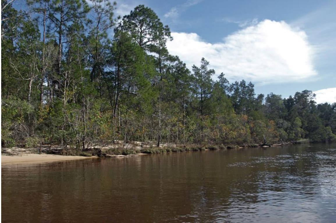
Rogers Tract (Backwater River); 12/16/09