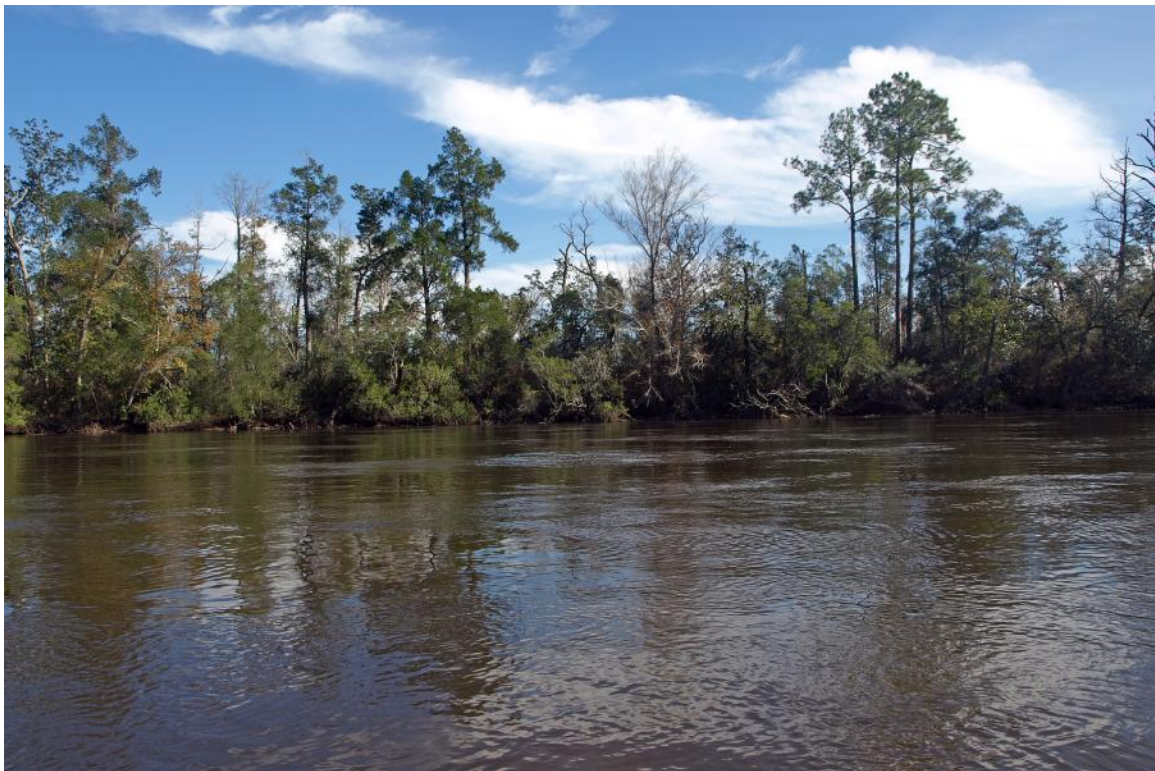
Rogers Tract (Backwater River); 12/16/09