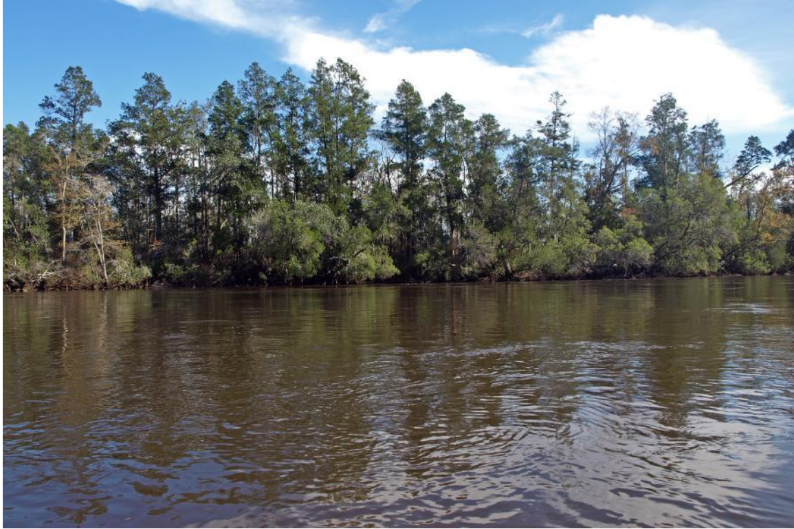
Rogers Tract (Backwater River); 12/16/09