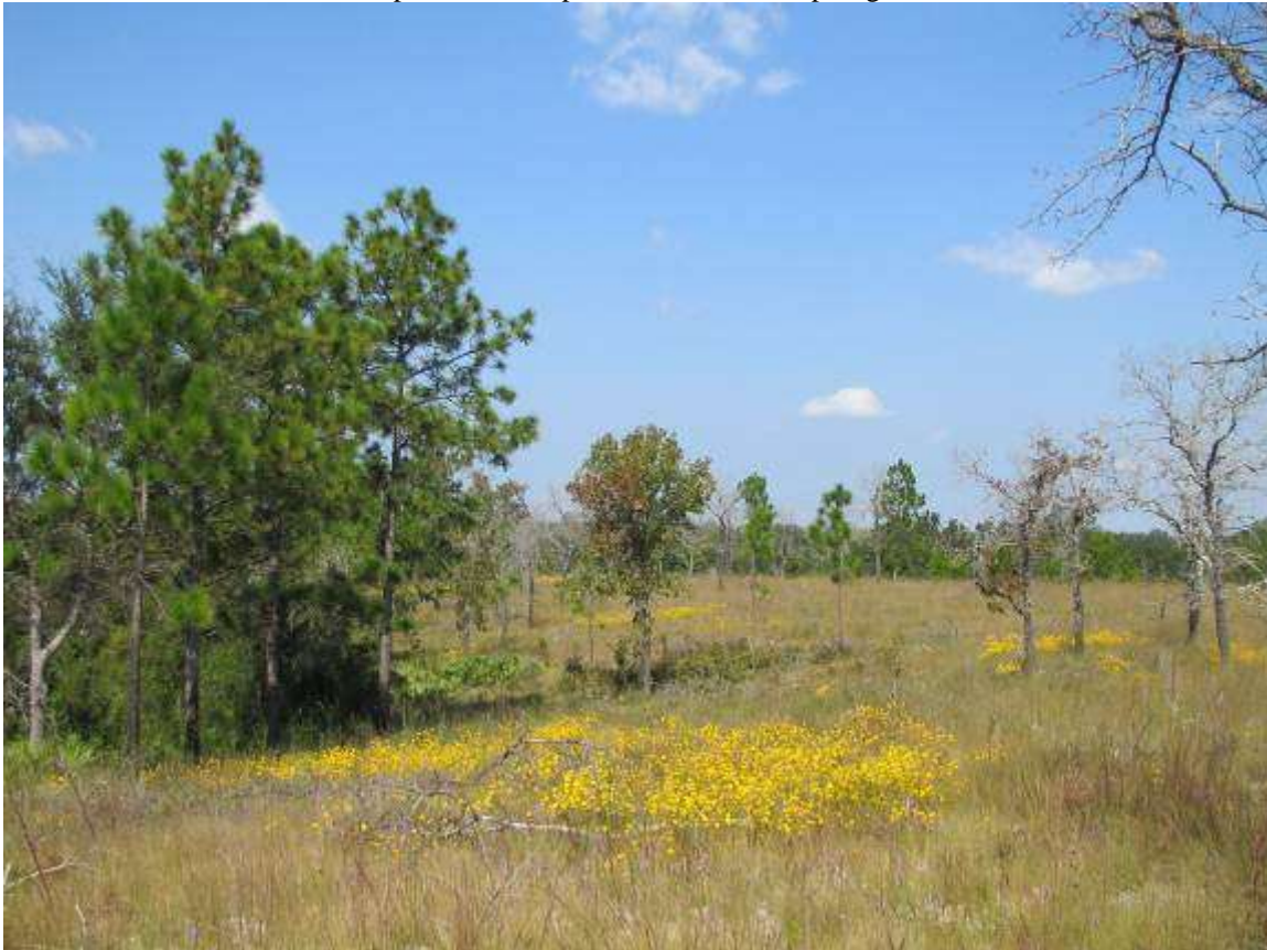
M4. Wiregrass and saw palmettos , upland next to Little Deep Edge.

Upland near loop road and Little Deep Edge.