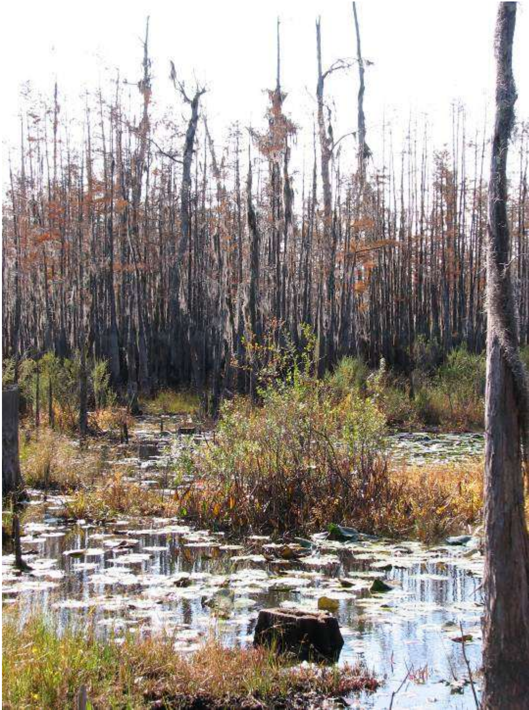
Pedestrian Transect M7: Note: floating mats