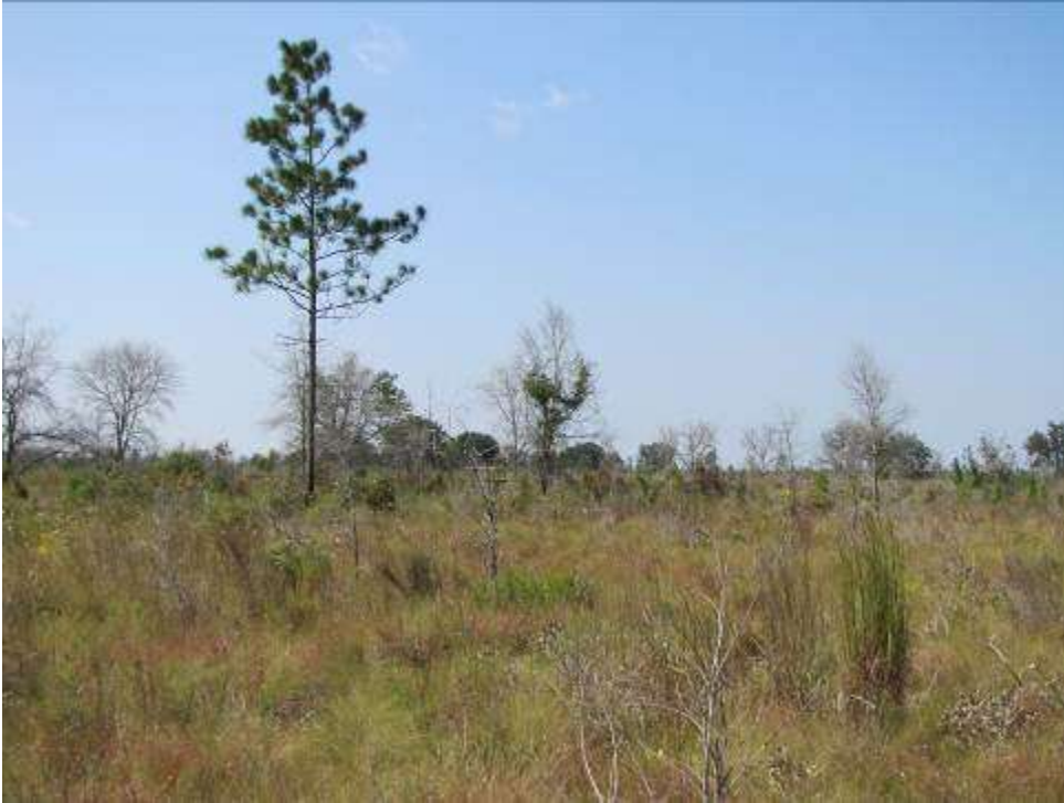
M5: shows natural wire grass regeneration following slash pine harvest