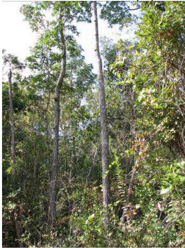
Gyrotracked Shrub area