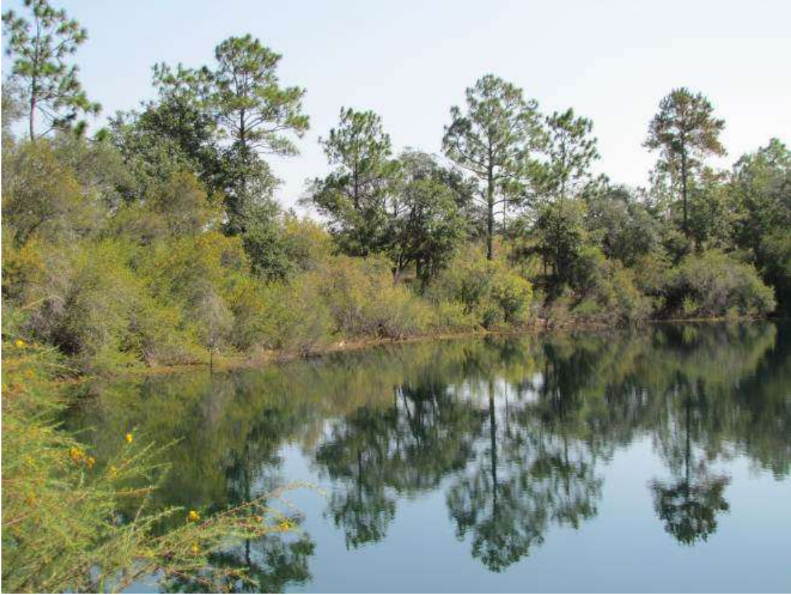
M3: Cat Pond