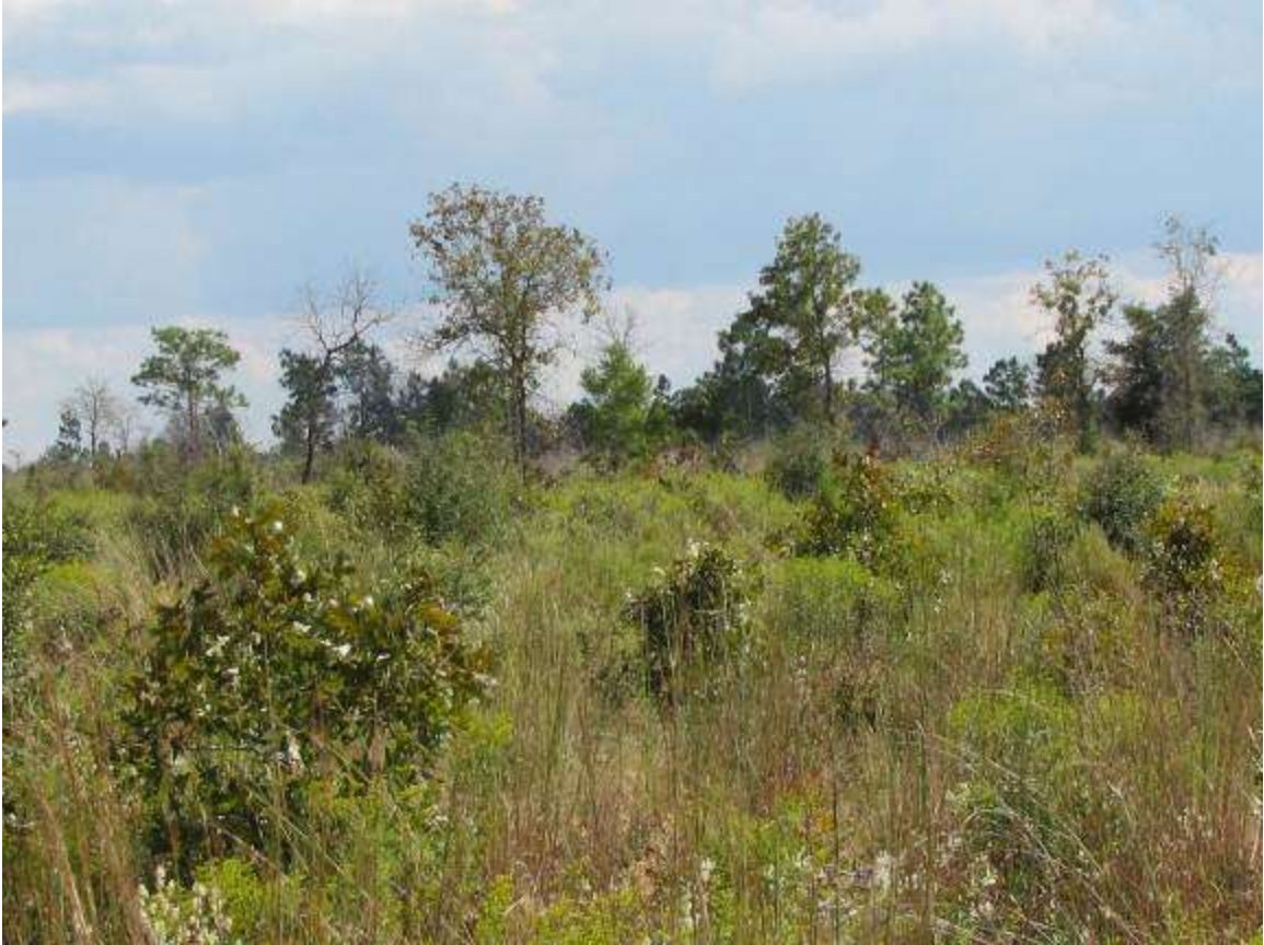
M2. Sand Pine Plantation, post burn and planting