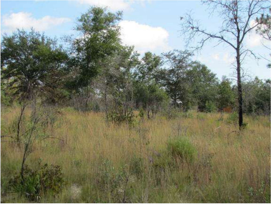
Pedestrian Transect: Upland Sand Hill with oak eradication and subsequent burns