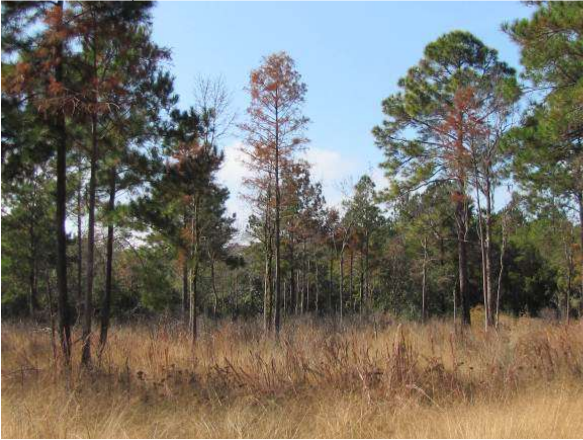
M11. Wet Flatwoods, Gyro-Trac area