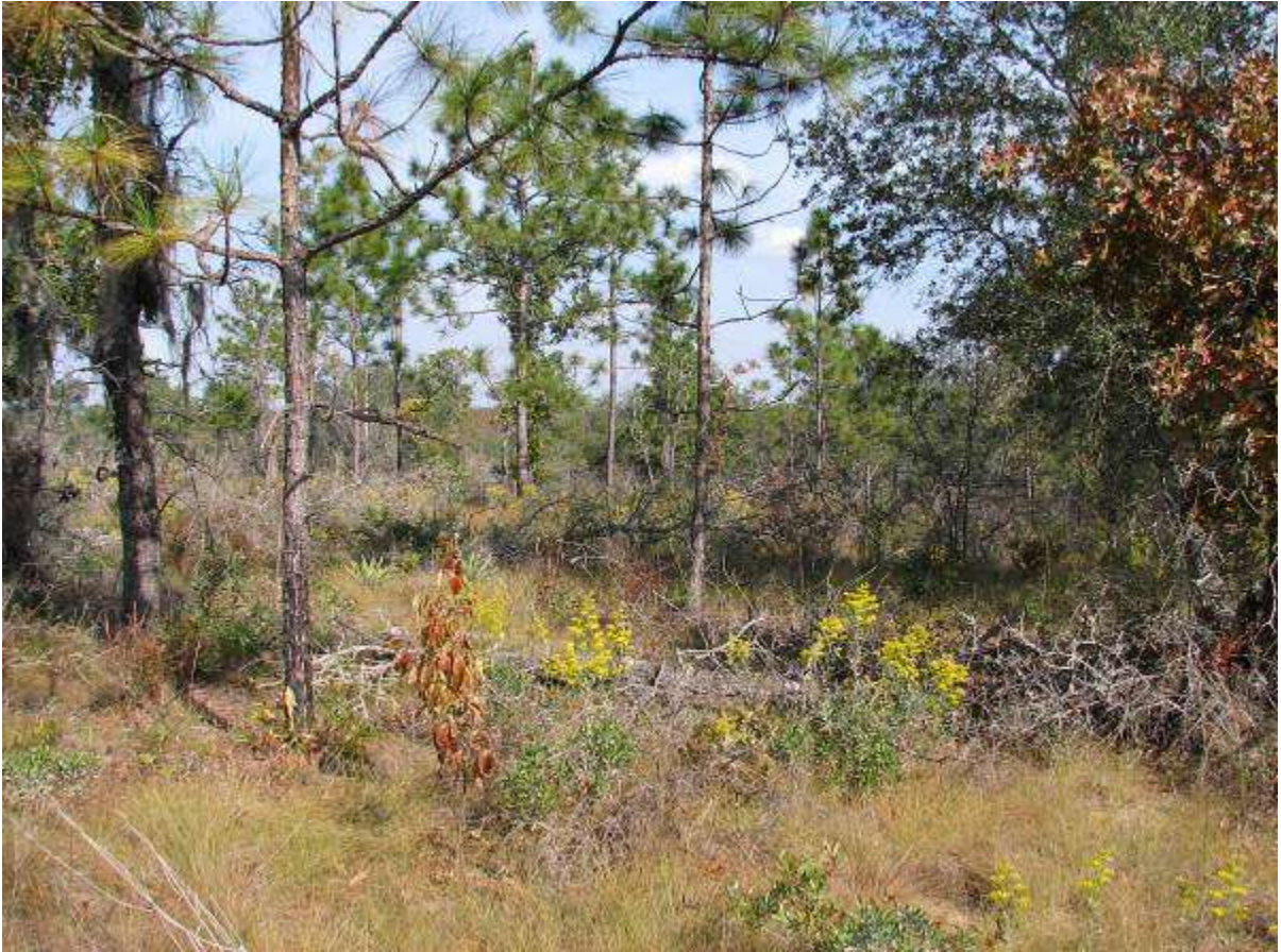
Pedestrian Transect: Upland Sand Hill with oak eradication: Note: Wiregrass and felled oaks