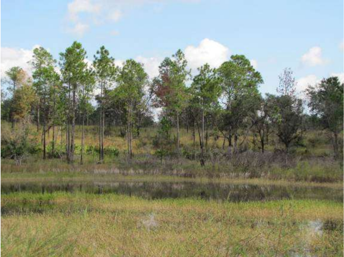
Marsh showing in background and wire grass community