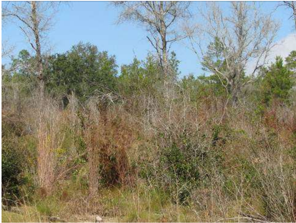
M12.Pedestrian Transect: Upland Sand Hill after burn, not wire grass