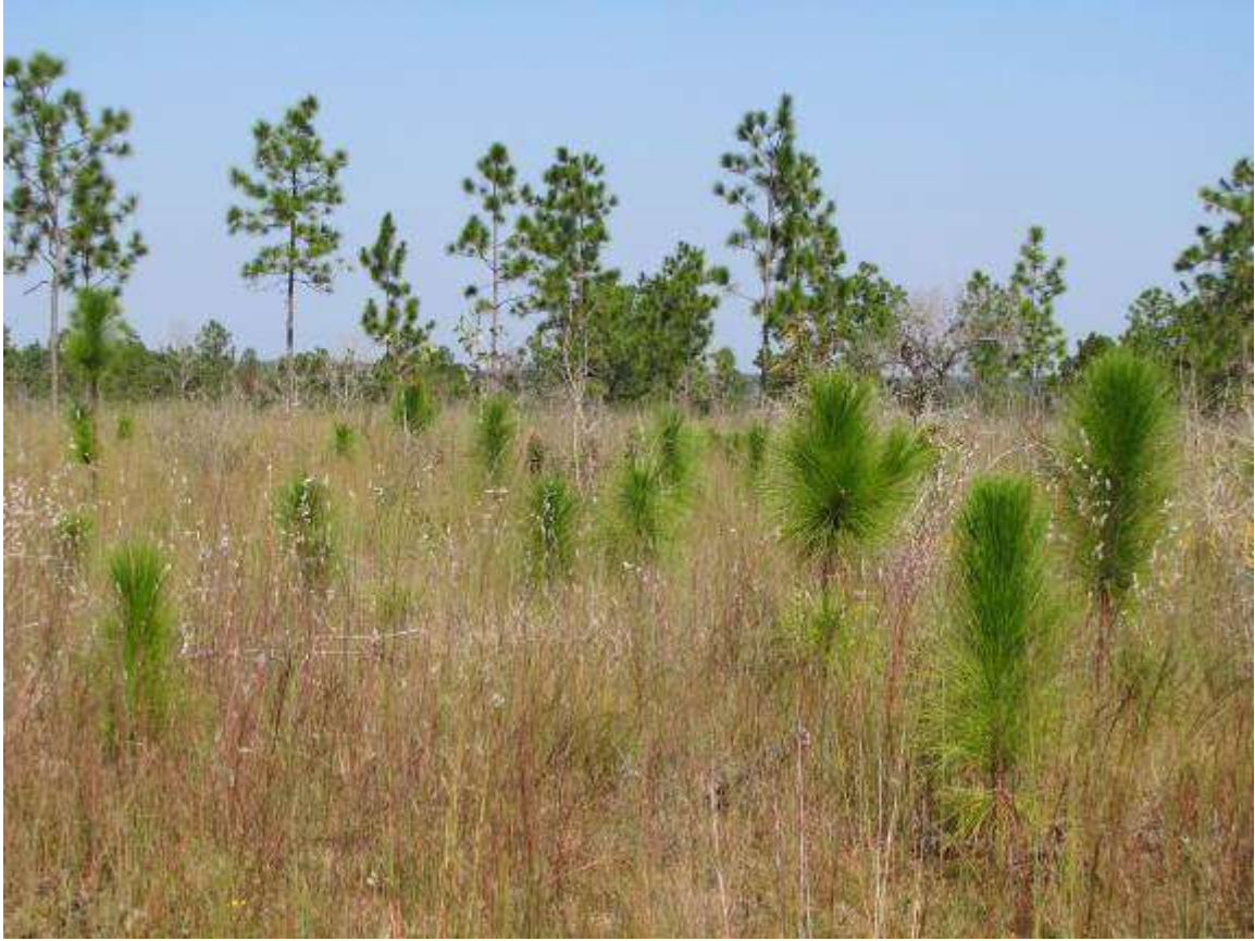
Pedestrian Transect M3: Sand hill adjacent to Cat Pond