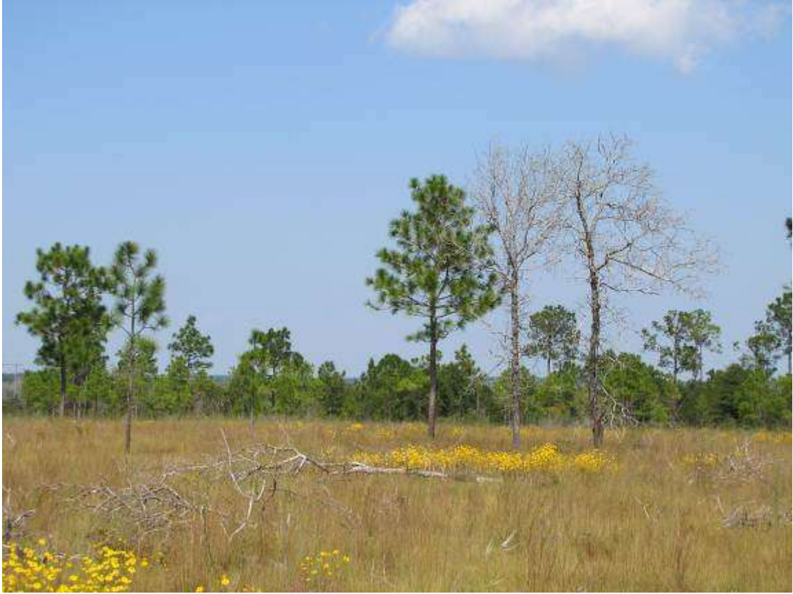
M4. Adjacent to Little Deep Edge