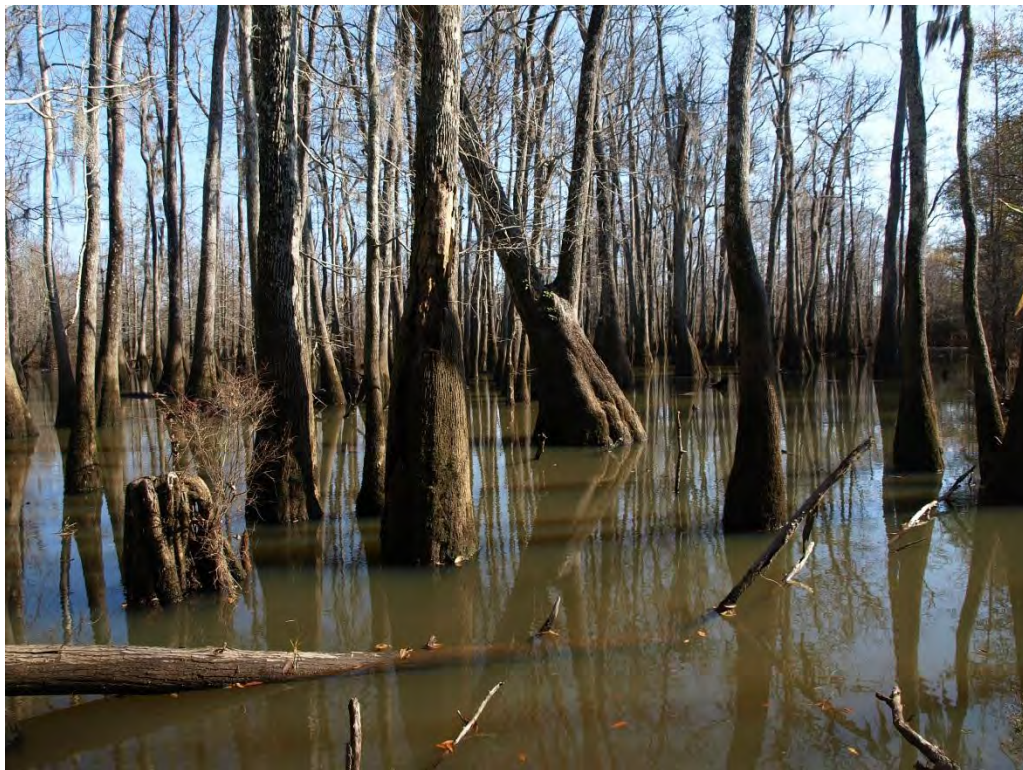
Bluff Springs: 1/6/11 – Cypress/Tupelo Slough (High-Quality Wetland)