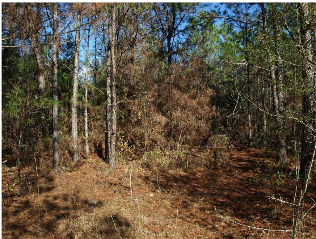
Bluff Springs: 1/6/11 – Upland Buffers in Need of Prescribed Fire