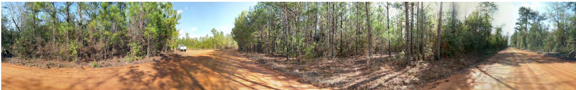
Bluff Springs: 1/6/11 – 360° View of Upland Buffers and Access Road