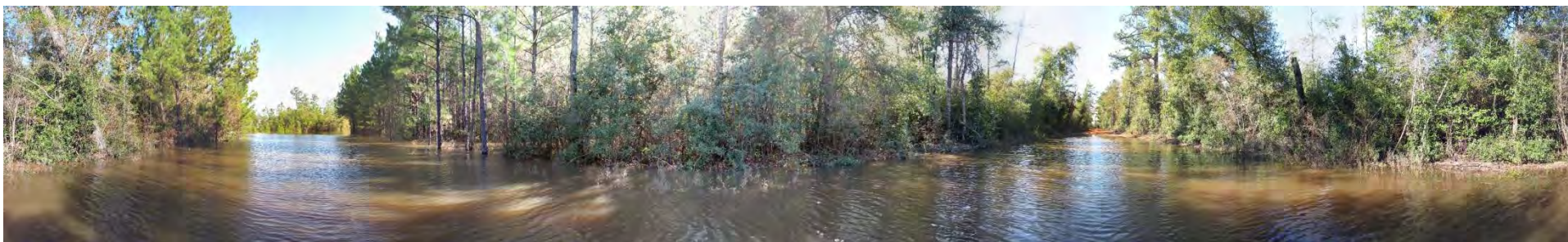
Bluff Springs: 12/16/09 – 360° View of Upland Buffers and Access Road during Flooding of Escambia River