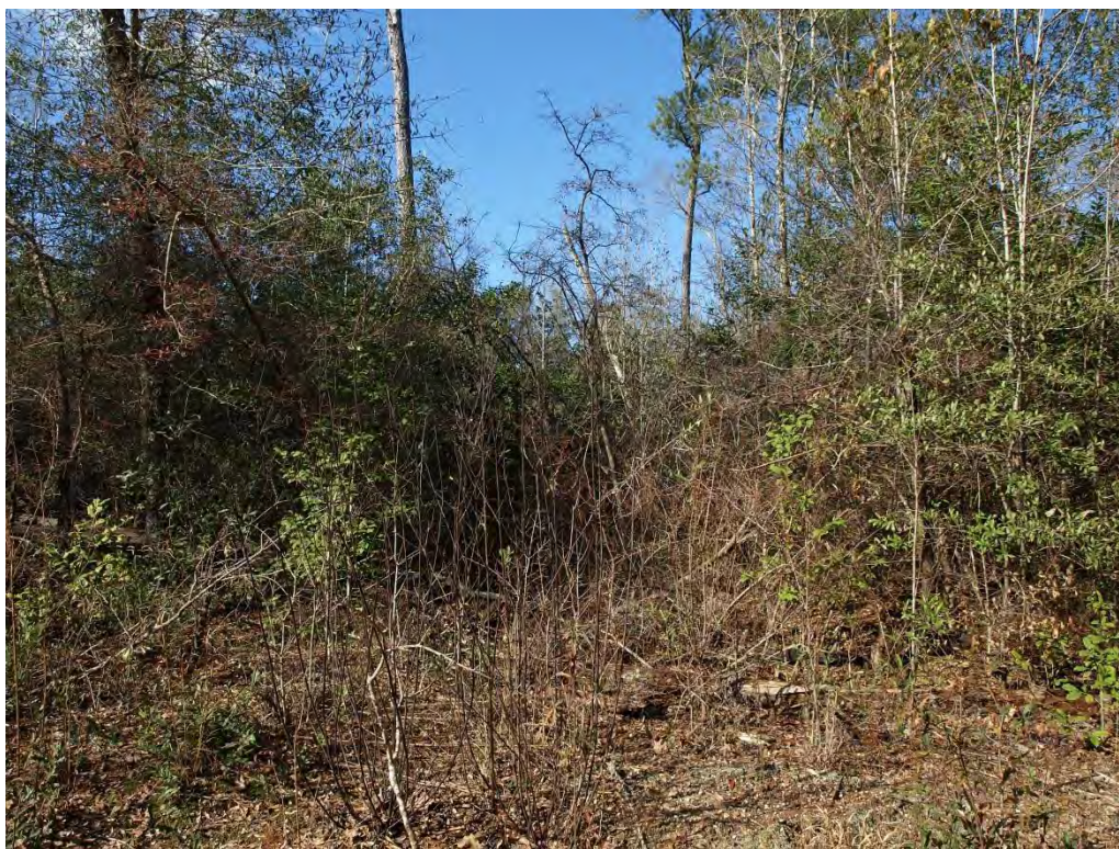
Bluff Springs: 1/1/11 – Relict Upland Forest Hurricane Damage (Ivan 9/04)