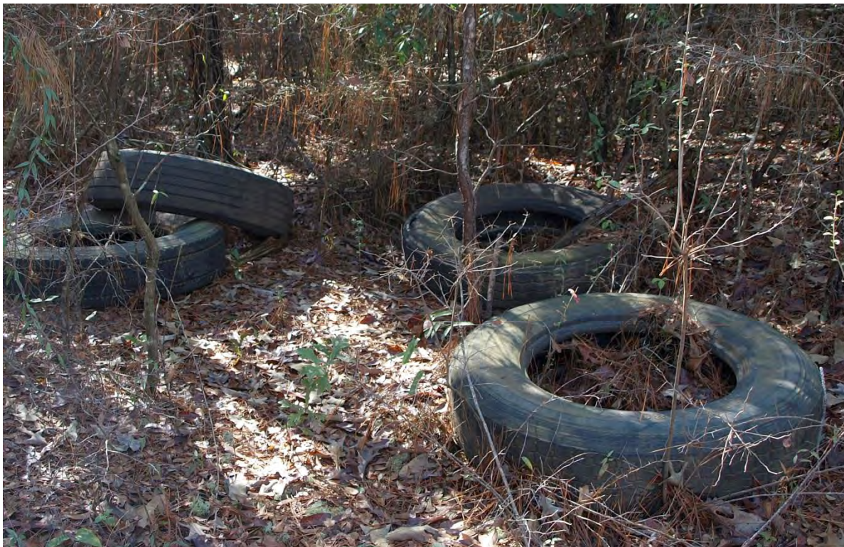
Bluff Springs: 1/6/11 – Minor Tire Dumping in Upland Buffers (No Change from 2009)