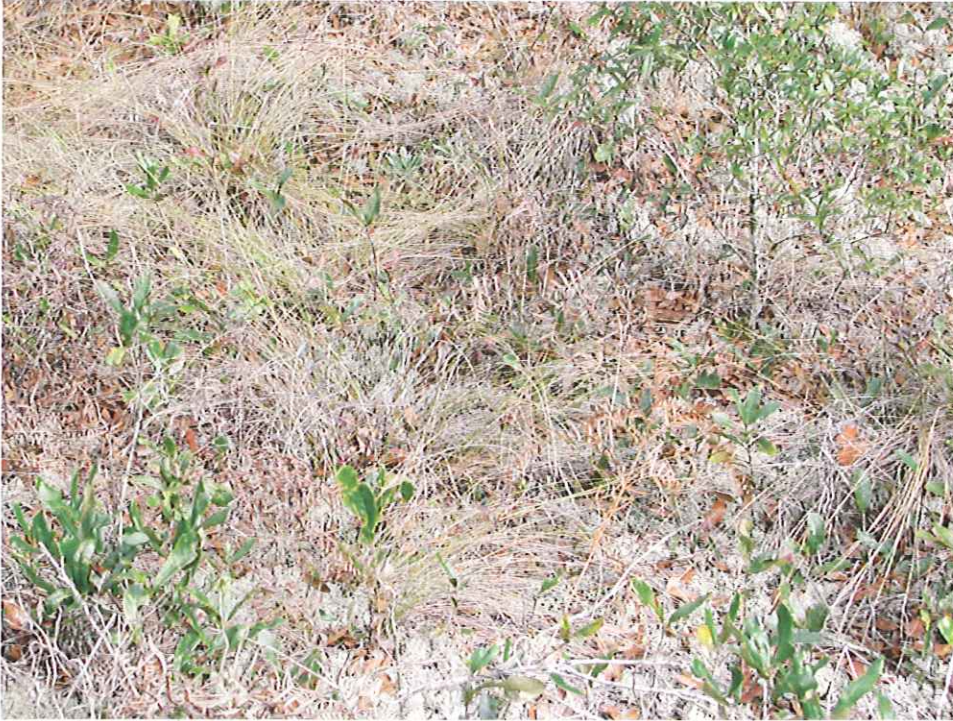
Figure 5. Wiregrass in flatwoods