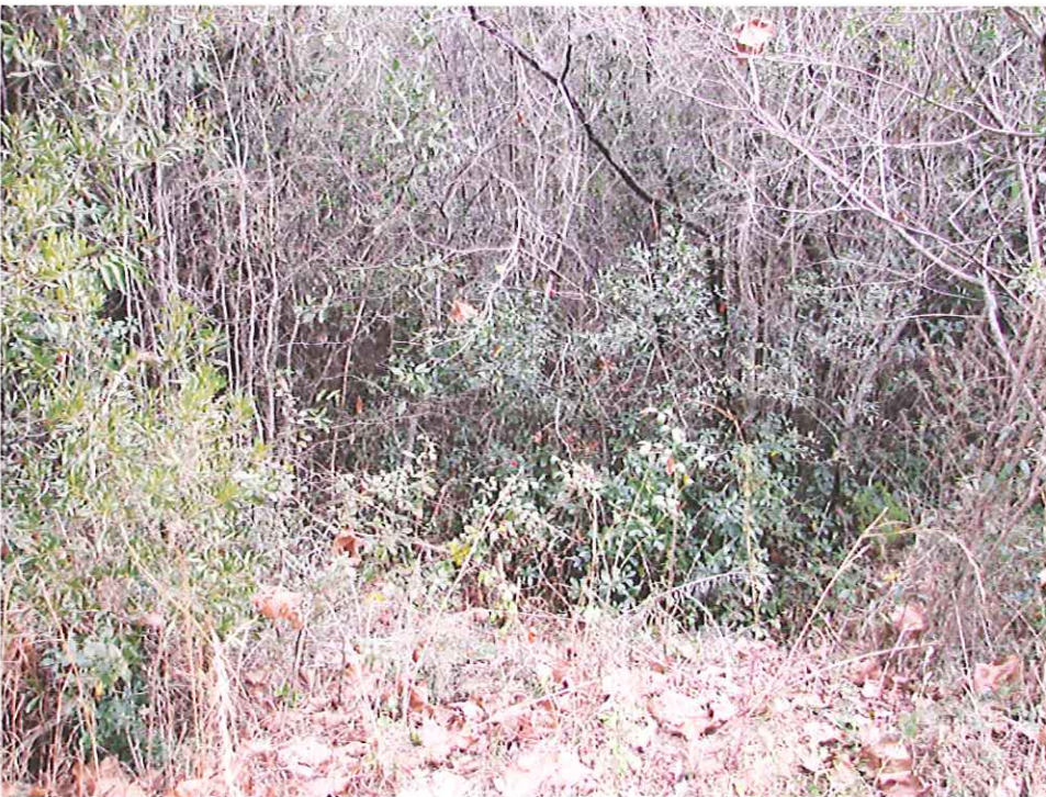
Figure 6. Juniper Creek forested wetland