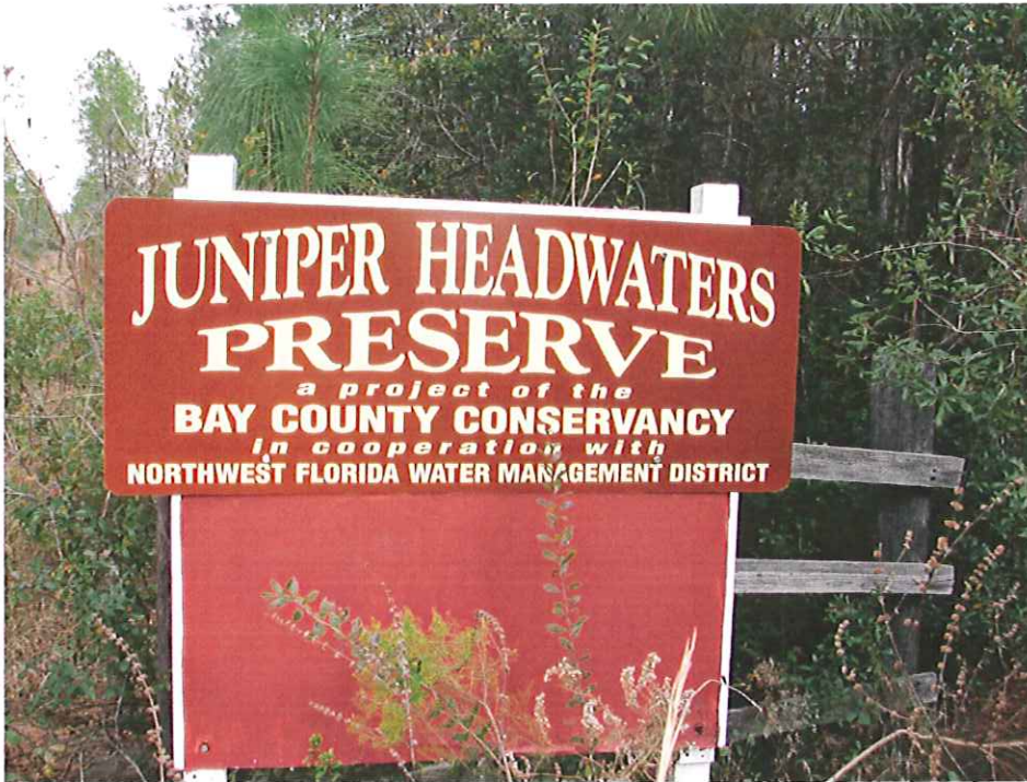
Figure 3. Juniper Creek Headwater Preserve Sign