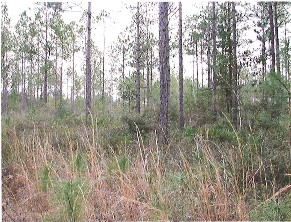
Figure 4. Wet pine flatwoods