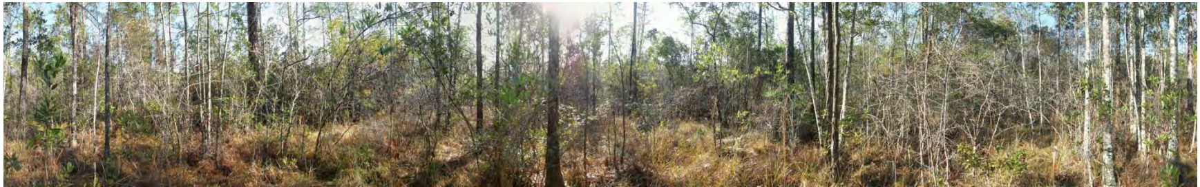
Perdido River WMA (I): 1/6/2011 (360° View)