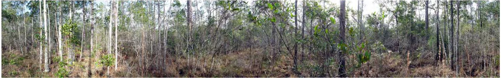
Perdido River WMA (I): 12/28/2011 (360° View)