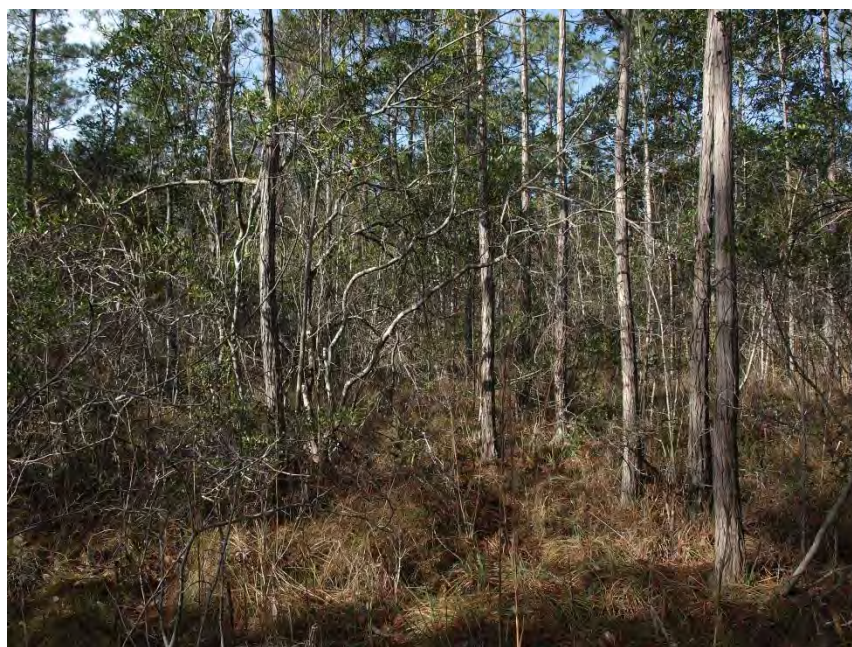
Perdido River WMA (I): 10/28/2011