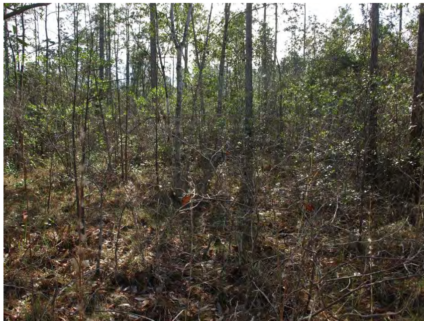
Perdido River WMA (I): 12/28/2011