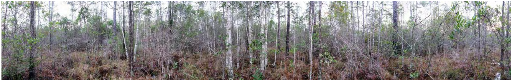
Perdido River WMA (I): 12/16/2009 (360° View)