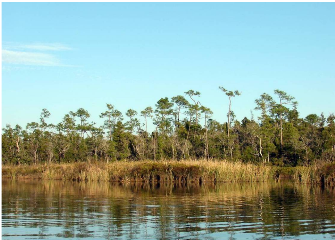
Brewer Tract (Backwater River); 11/17/06; Photo H