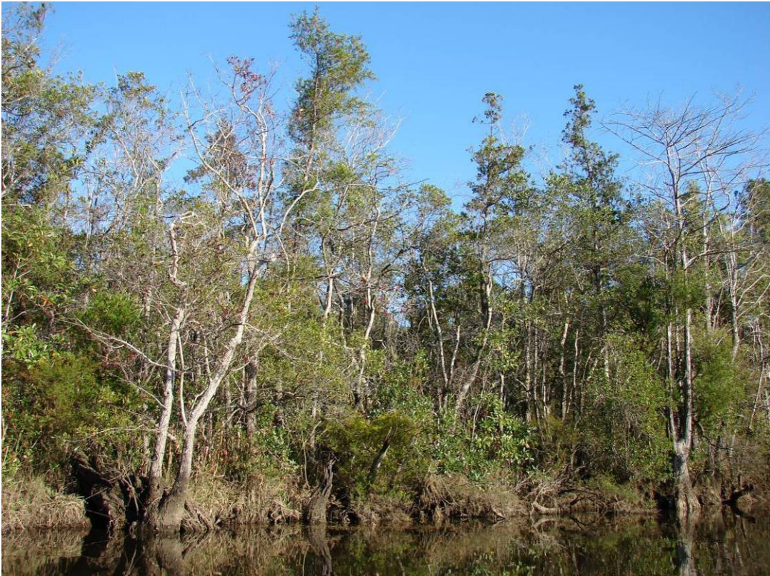
Brewer Tract (Backwater River); 11/17/06; Photo B