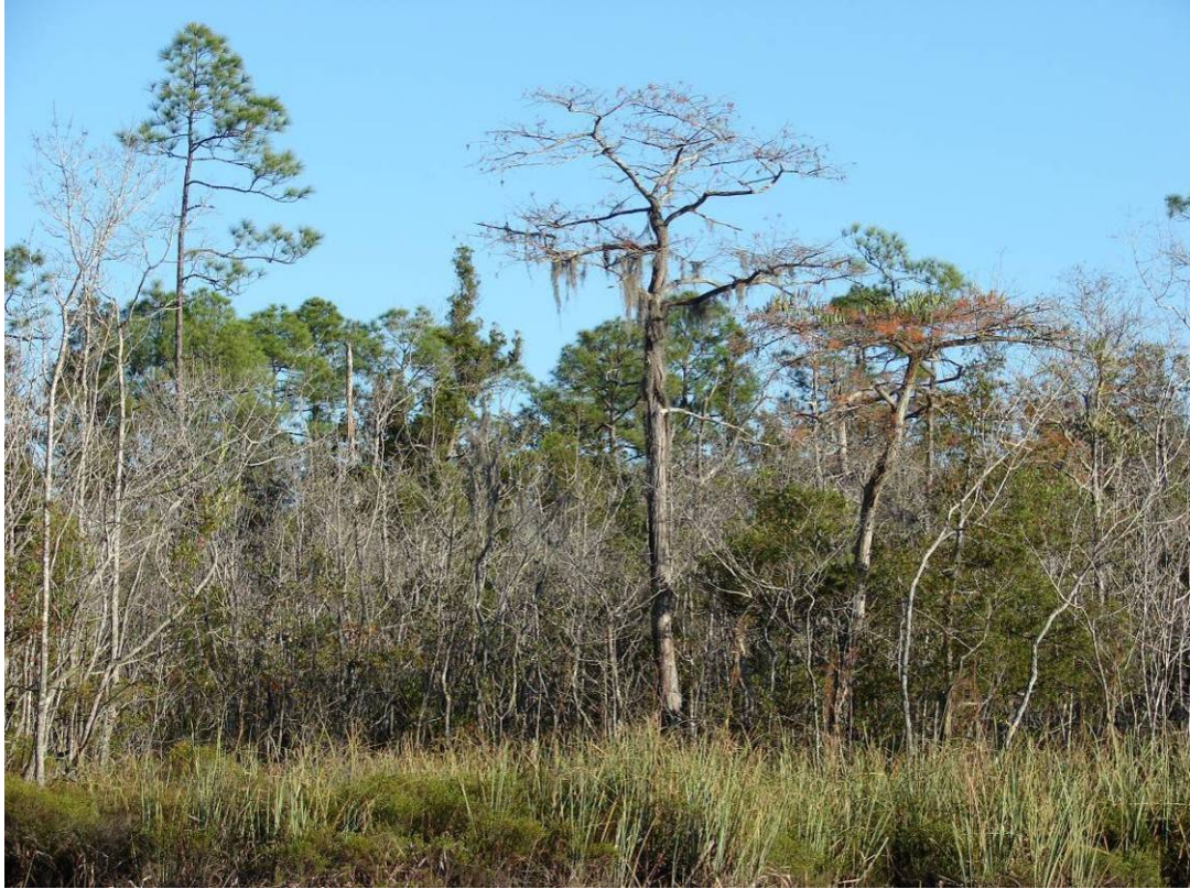
Brewer Tract (Backwater River); 11/17/06; Photo C