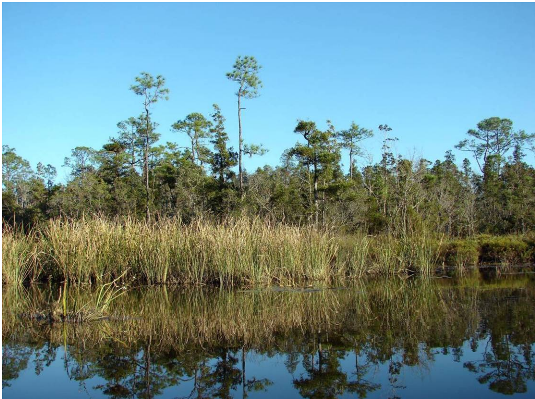
Brewer Tract (Backwater River); 11/17/06; Photo F