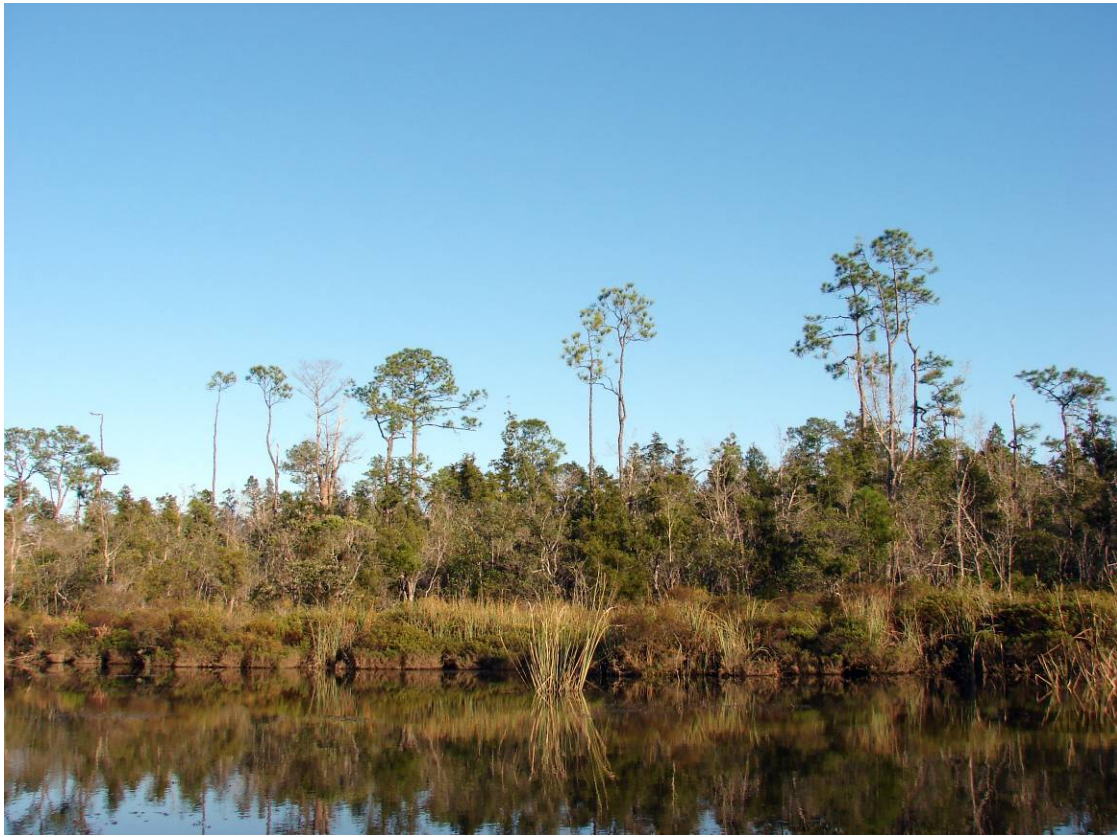
Brewer Tract (Backwater River); 11/17/06; Photo G