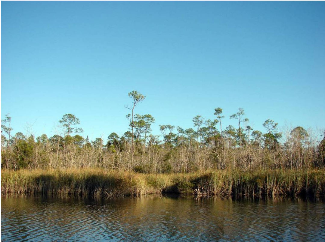
Brewer Tract (Backwater River); 11/17/06; Photo D