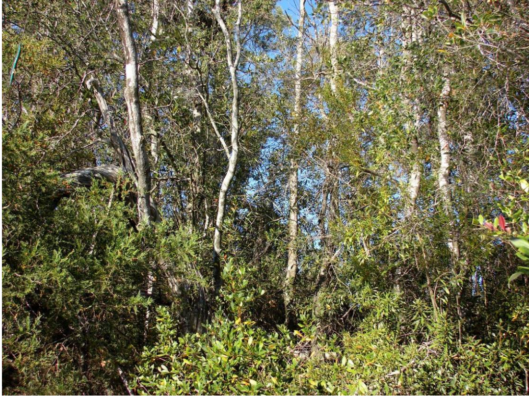
Brewer Tract (Backwater River); 11/17/06; Photo A