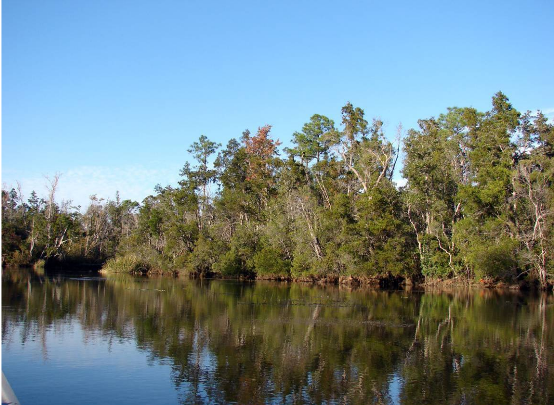
Brewer Tract (Backwater River); 11/17/06; Photo E