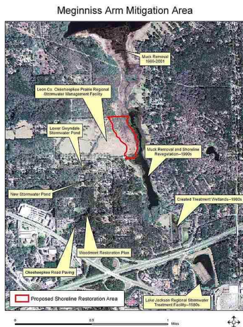
Figure 2. Meginniss Arm Restoration Site Mash