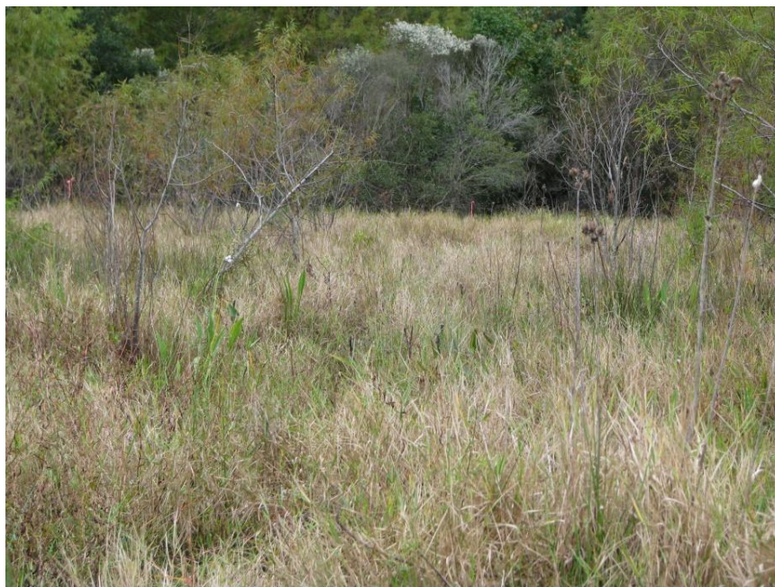
Figure 3. Planted arrowhead, pickerel weed, mallow, aster, cypress and soft rush