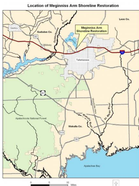
Figure 1. Meginniss Arm Restoration Location Map

To compensate for the loss of wetland function associated with the I-10 widening, the NFWFMD proposes to restore 17 acres of native shoreline through the eradication of exotic vegetation and planting of native species on the western side of Meginniss Arm at Lake Jackson (Figure 1). The proposed mitigation site is approximately 17 acres, and is primarily on state sovereign lands. Restoration would consist of eradication and management of Chinese tallow ( Sapium sebiferum ), wild taro ( Colocasia esculenta ), purple sesban ( Sesbania puncea ) and other exotic and/or invasive species using approved herbicides and application methods, followed by the planting of appropriate wetland species (generally marsh species with inclusions of cypress where appropriate).