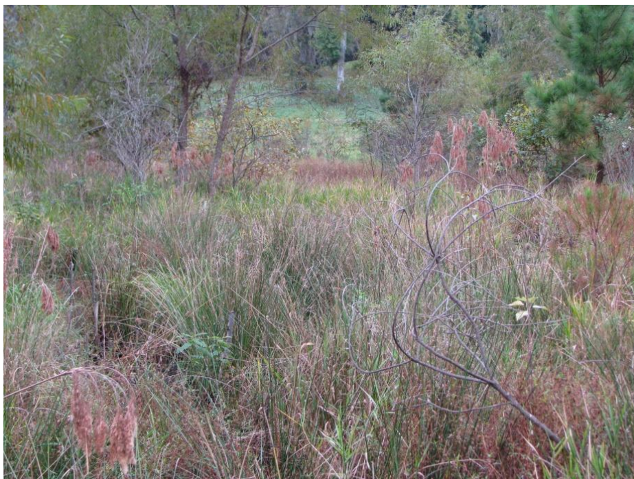
Figure 1. Megginnis Arm with planted vegetation