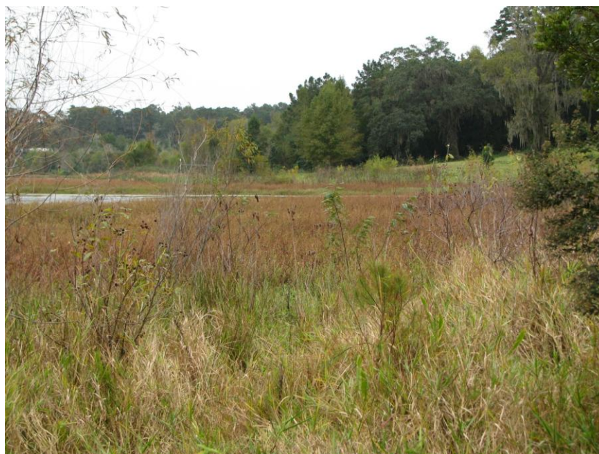
Figure 4. Planted marsh site