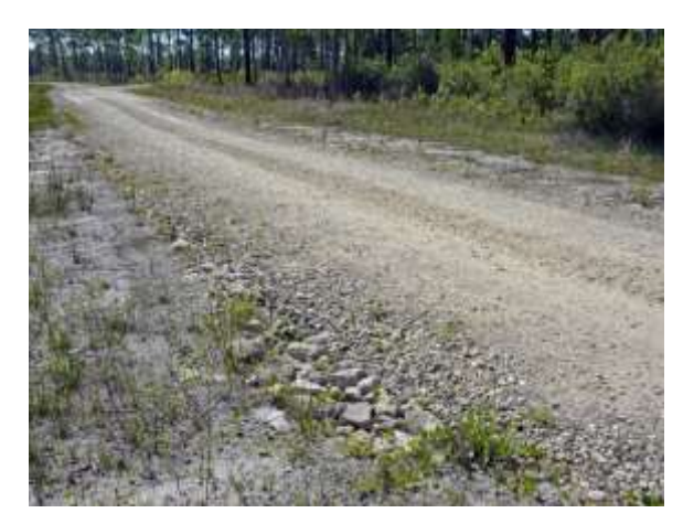
LWC - #4 (4/8/2015)