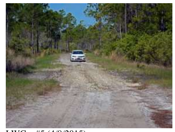
LWC - #5 (4/8/2015)