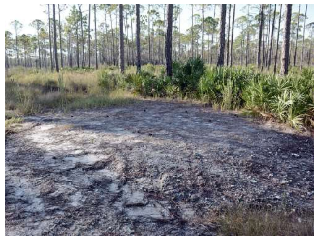
Typical Ditch Plug with Adjacent Hydric Pine Flatwoods in Background (10/15/2015)