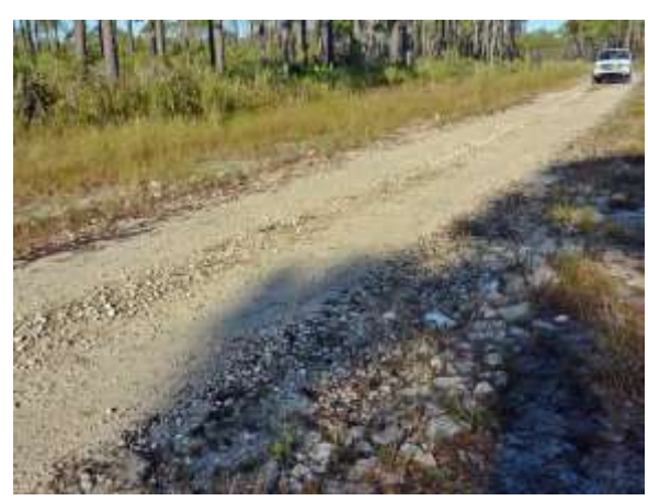
LWC - #4 (10/15/2015)