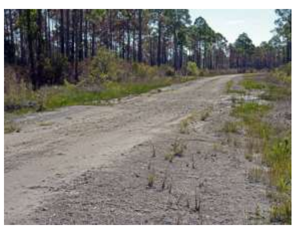
LWC - #3 (4/8/2015)