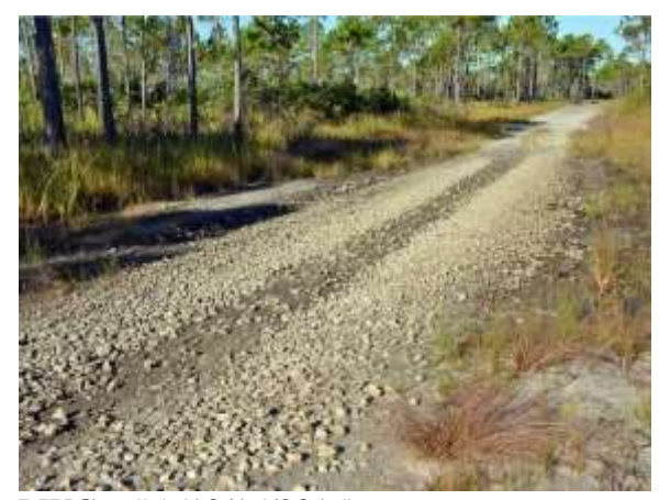
LWC - #5 (10/15/2015)