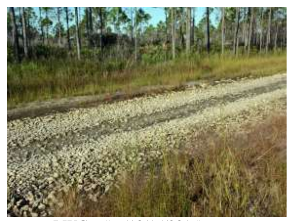
LWC - #6 (10/15/2015)