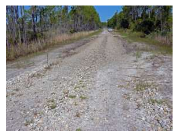
LWC - #6 (4/8/2015)