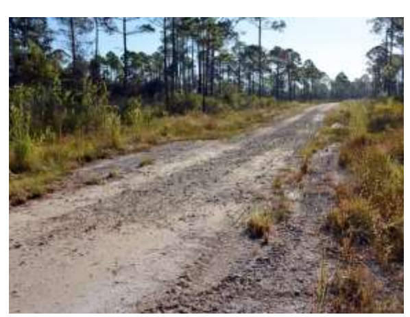
LWC - #3 (10/15/2015)