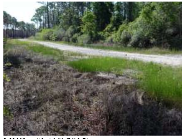
LWC - #1 (4/8/2015)