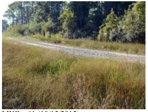
LWC - #1 (10/15/2015)