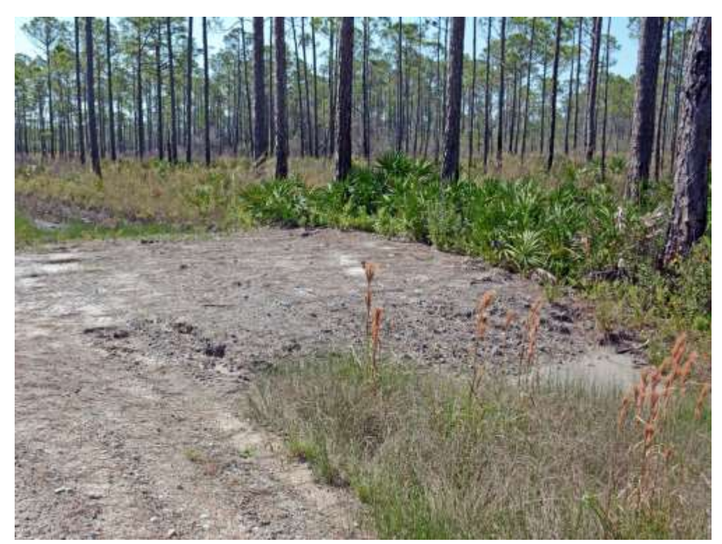
Typical Ditch Plug with Adjacent Hydric Pine Flatwoods in Background (4/8/2015)