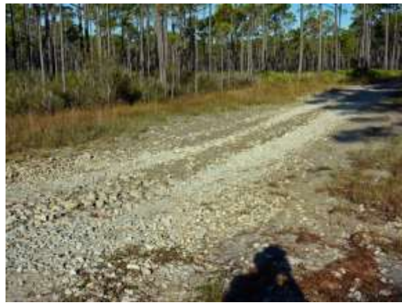
LWC - #2 (10/15/2015)