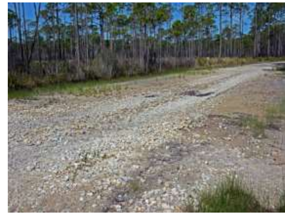
LWC - #2 (4/8/2015)