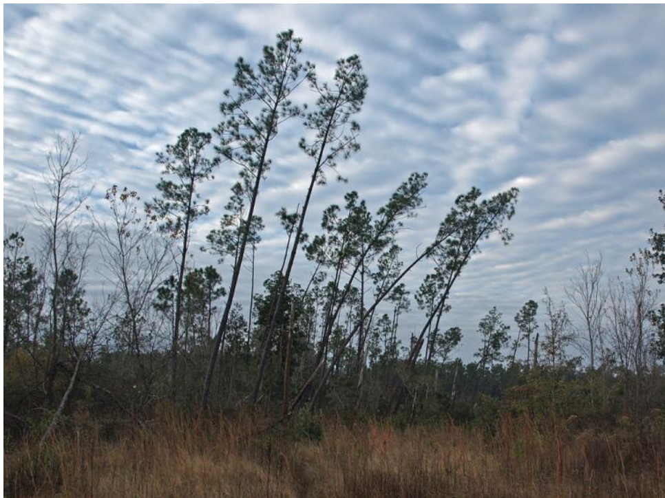
Perdido River WMA (I): 12/16/09 (Tree Damage Caused by Hurricane Ivan – 2004)