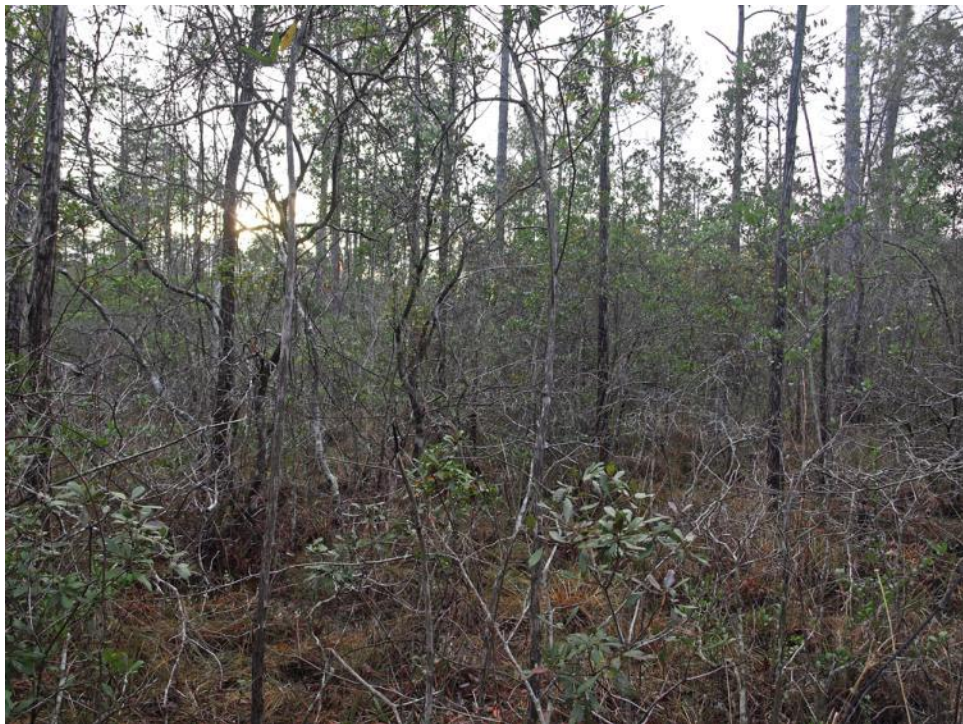
Perdido River WMA (I): 12/16/09