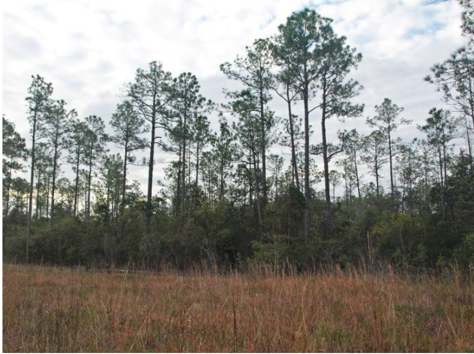
Perdido River WMA (I): 12/16/09