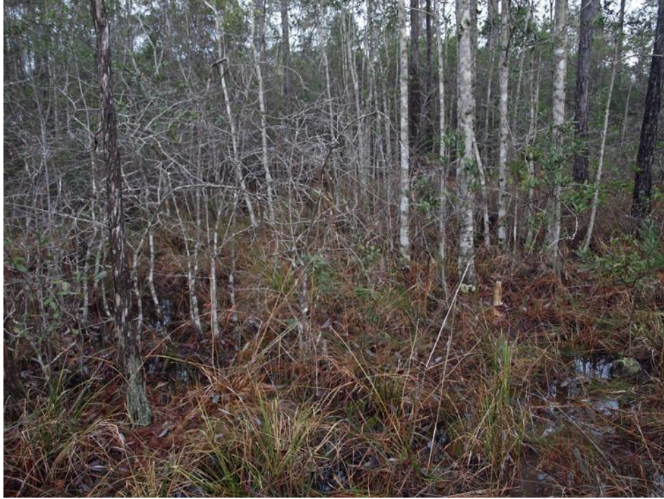
Perdido River WMA (I): 12/16/09