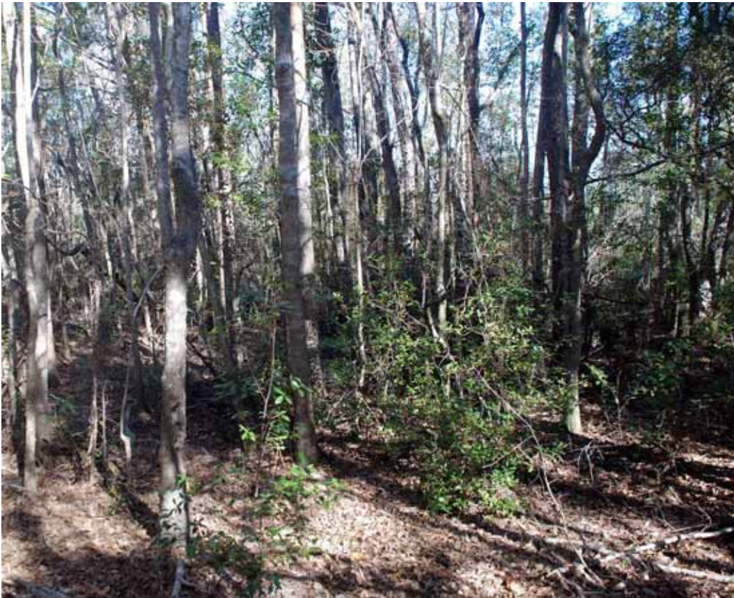
Brewer Tract (Backwater River); 12/4/07