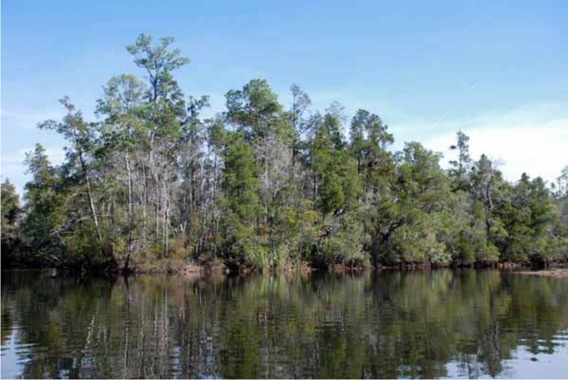
Brewer Tract (Backwater River); 12/4/07