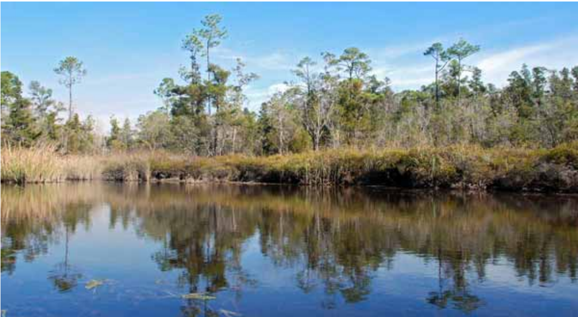
Brewer Tract (Backwater River); 12/4/07