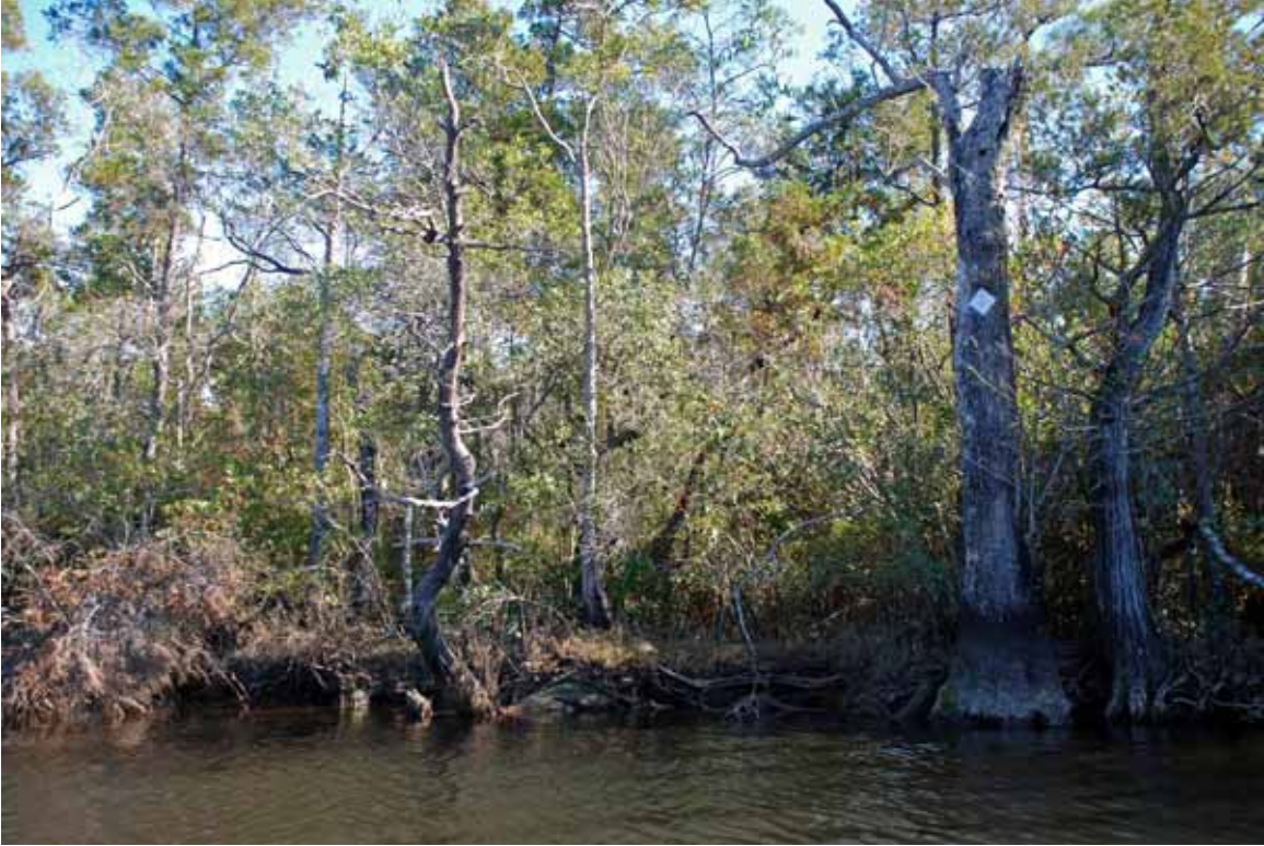
Brewer Tract (Backwater River); 12/4/07