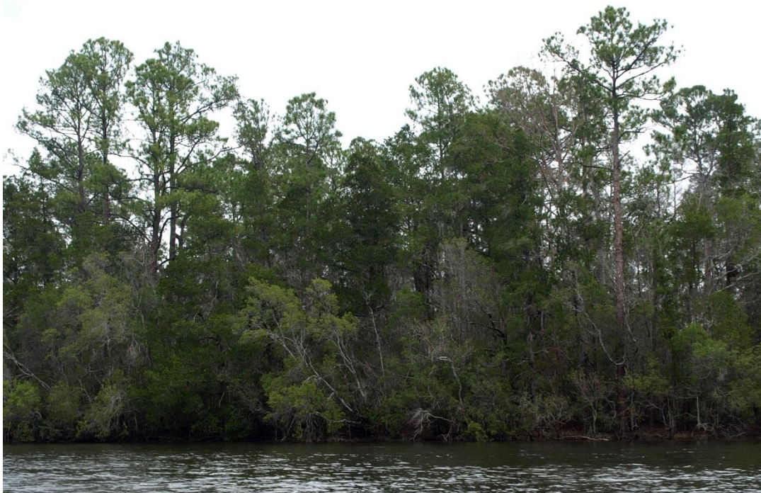
Rogers Tract (Blackwater River); 3/8/2011