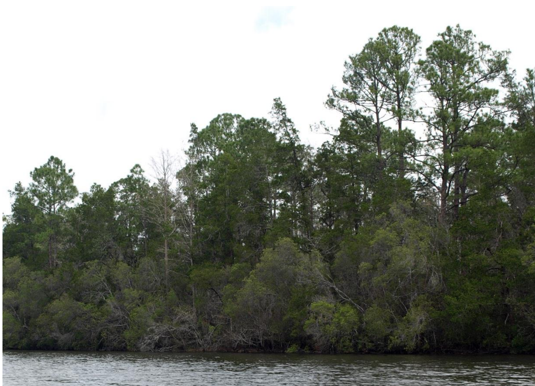
Rogers Tract (Blackwater River); 3/8/2011