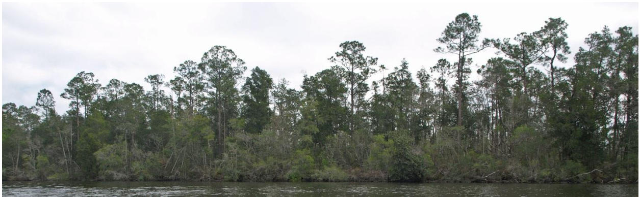
Representative Photos of Rogers Tract (Blackwater River); 3/8/2011