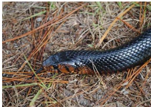
Eastern Indigo Snake Head Coloration

The contractor and all construction personnel must be familiar with and use this plan to be in compliance with USFWS and FWC requirements for the protection of the eastern Indigo snake.