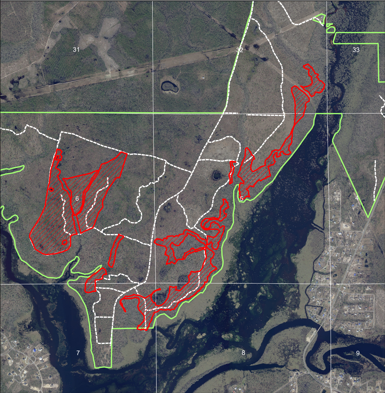
Exhibit Map 16

2023 Reforestation Project - Stand 22 Econfina Creek Water Management Area Sections 5/6/7/8, T2S, R13W Bay County, Florida Longleaf Reforestation Project @ 726 Trees Per Acre 6' X 10' Spacing 186 Acres