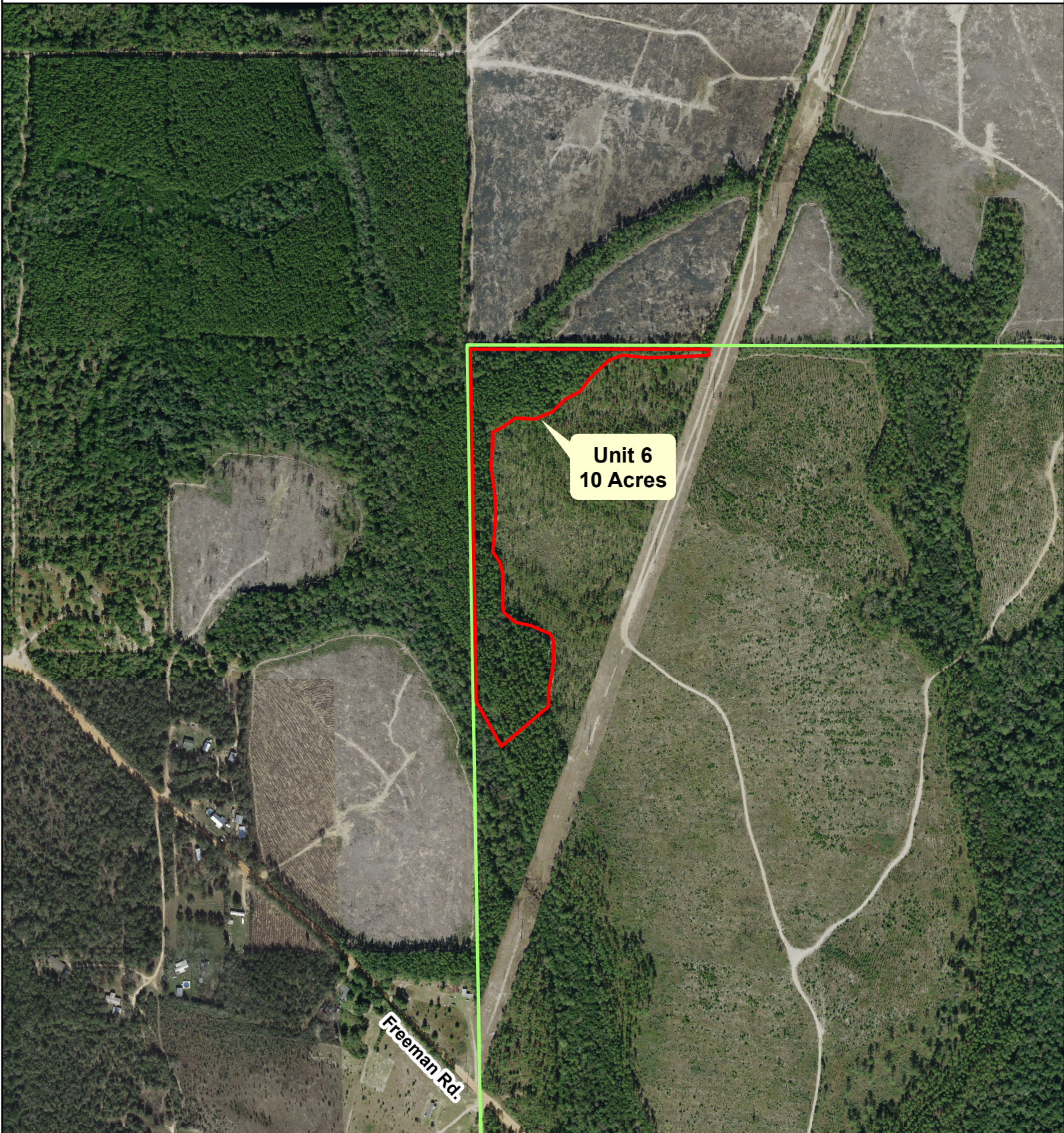
Exhibit Map 3

St. Andrews Tract - Unit 6 Econfina Creek Water Management Area Section 17, Township 2N, Range 11W Jackson County, Florida 10 Acres