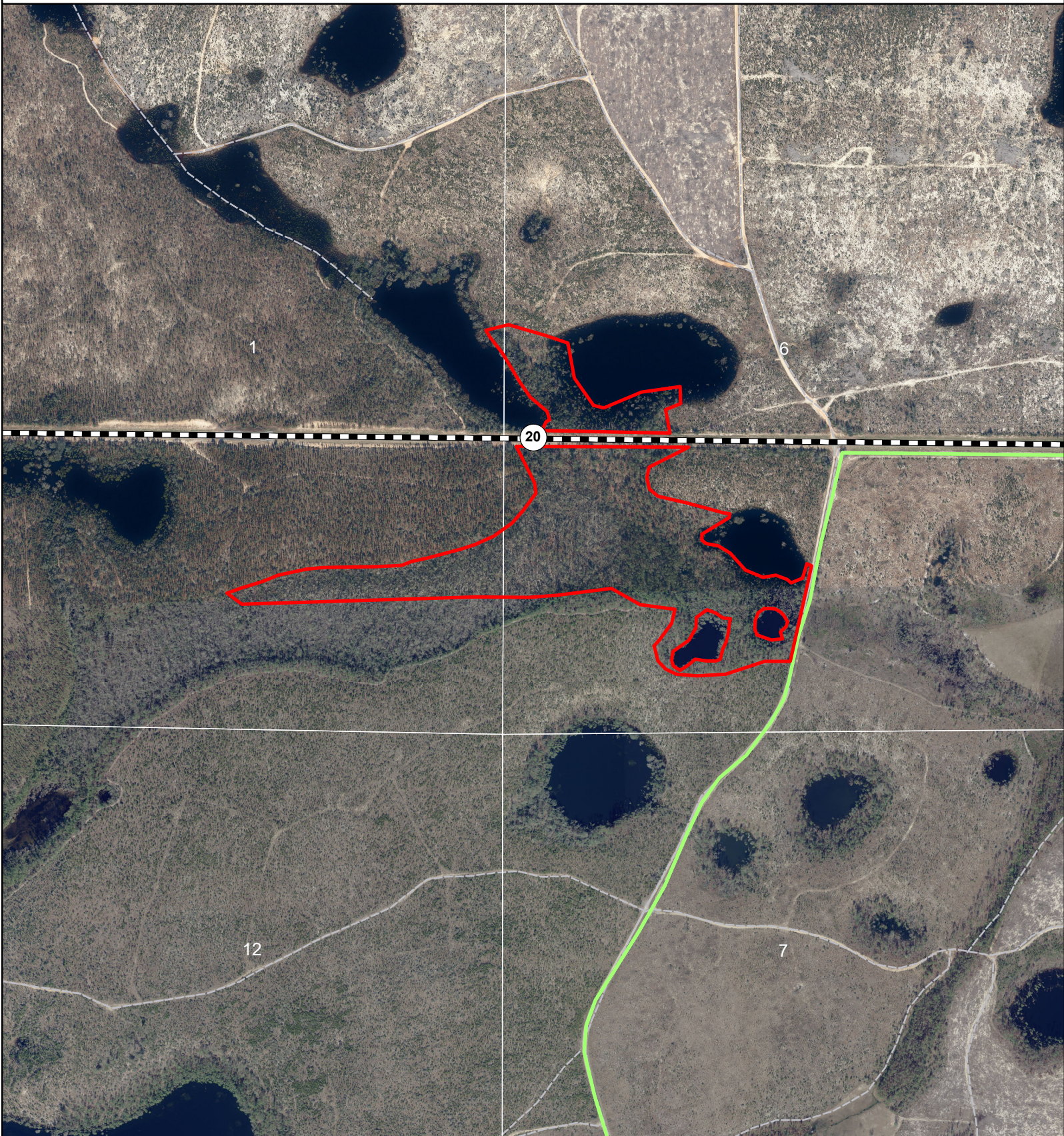
Exhibit Map 5

Bay Gall - Unit 7 Econfina Creek Water Management Area Section 6, Township 1S, Range 13W & Section 1, Township 1S, Range 14W 45 Acres