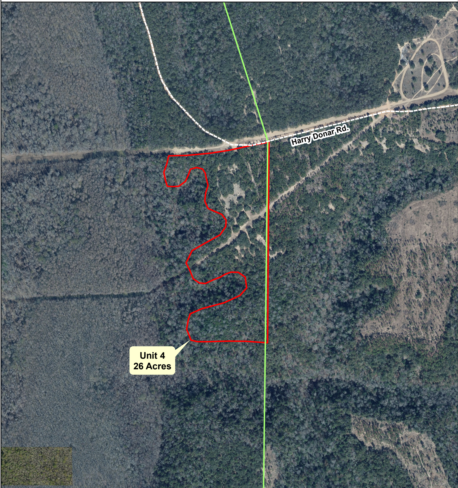
Exhibit Map 2