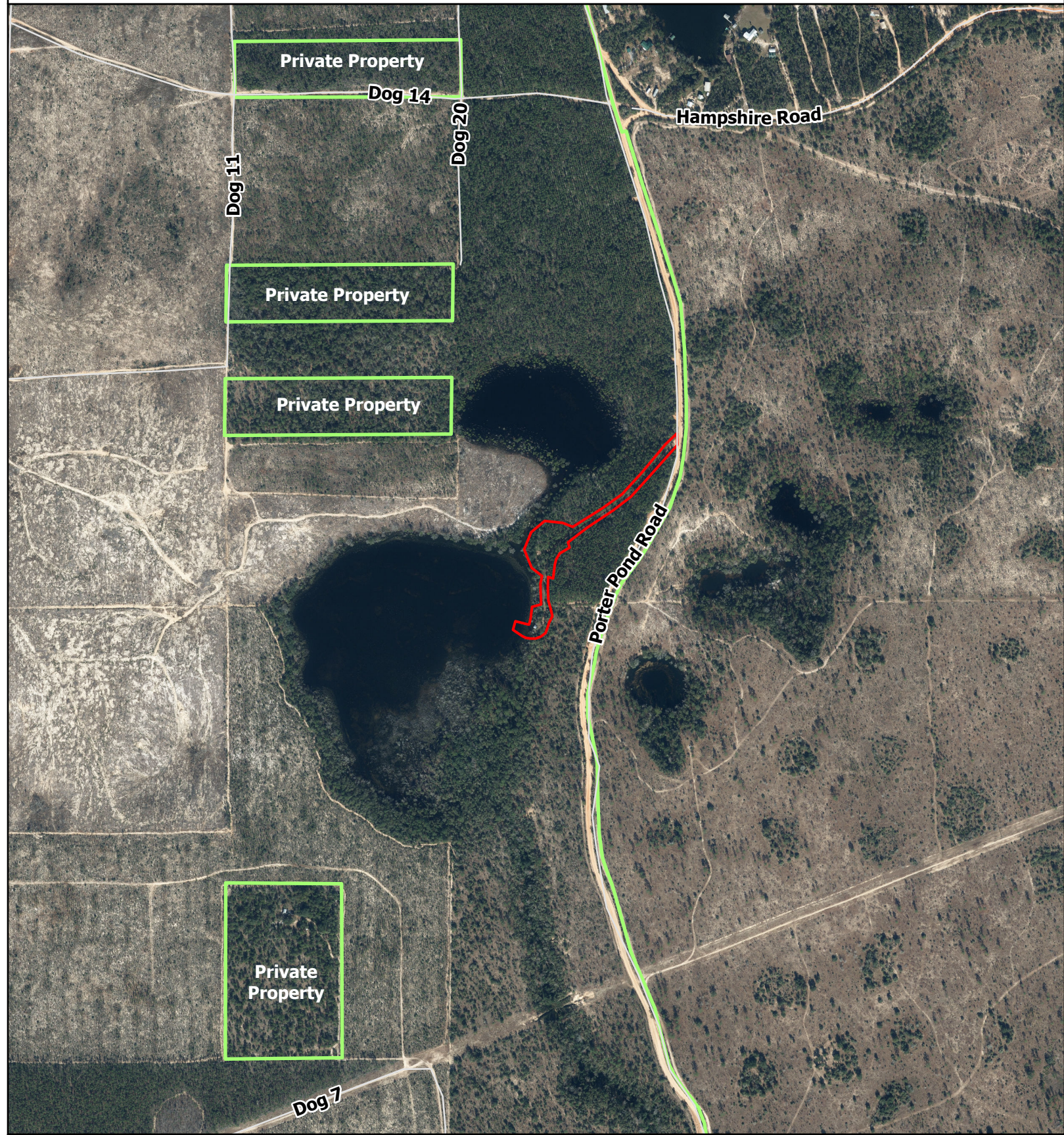
Exhibit Map 8

Whitewater Lake - Unit 10 Econfina Creek Water Management Area Sections 16 & 21, Township 1 North, Range 13 West Washington County, Florida 3 Acres