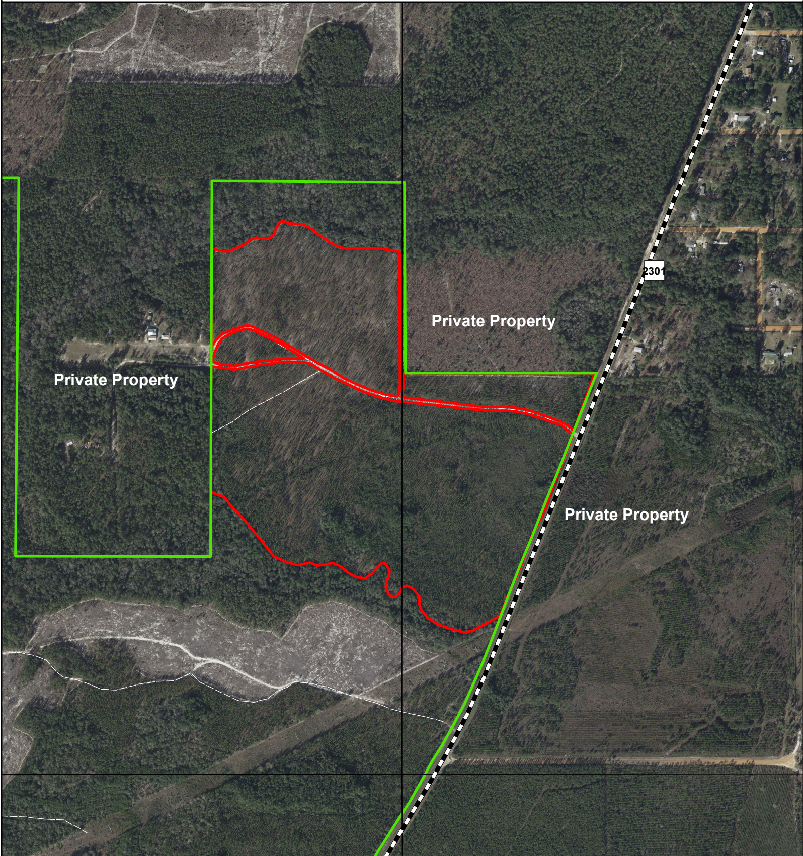
2024 Prescribed Burn Project - Dove Lane Unit 9 Econfina Creek Water Management Area Sections 27/28, Township 1S, Range 13W Bay County, Florida 100 Acres