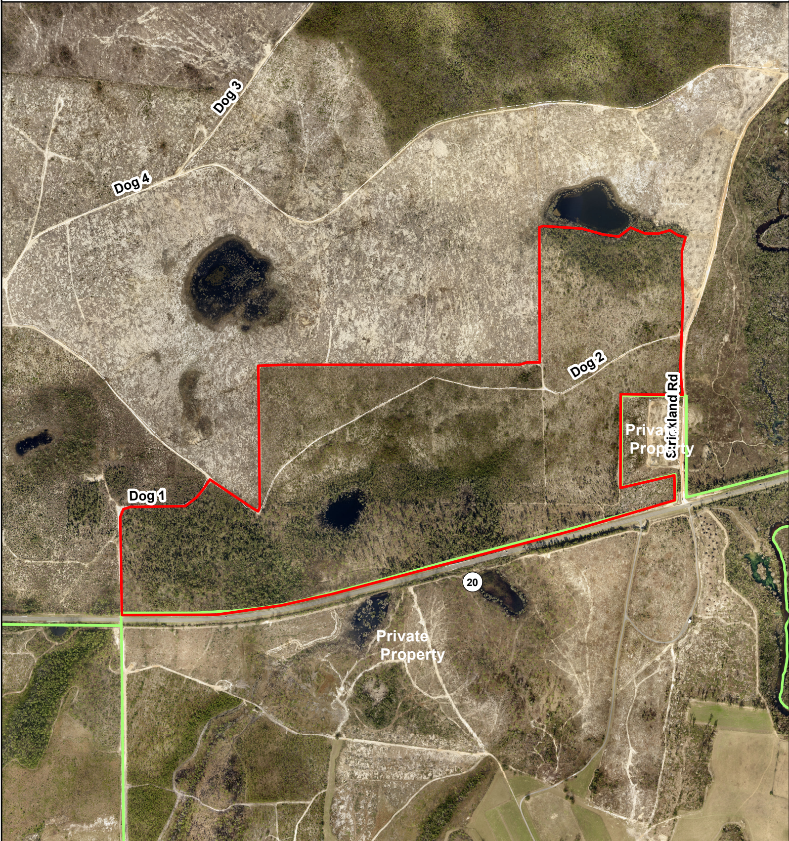
2024 Prescribed Burn Project - Gainer Homestead Unit 15 Econfinia Creek Water Management Area Sections 4/5, Township 1S, Range 13W Bay County, Florida 225 Acres