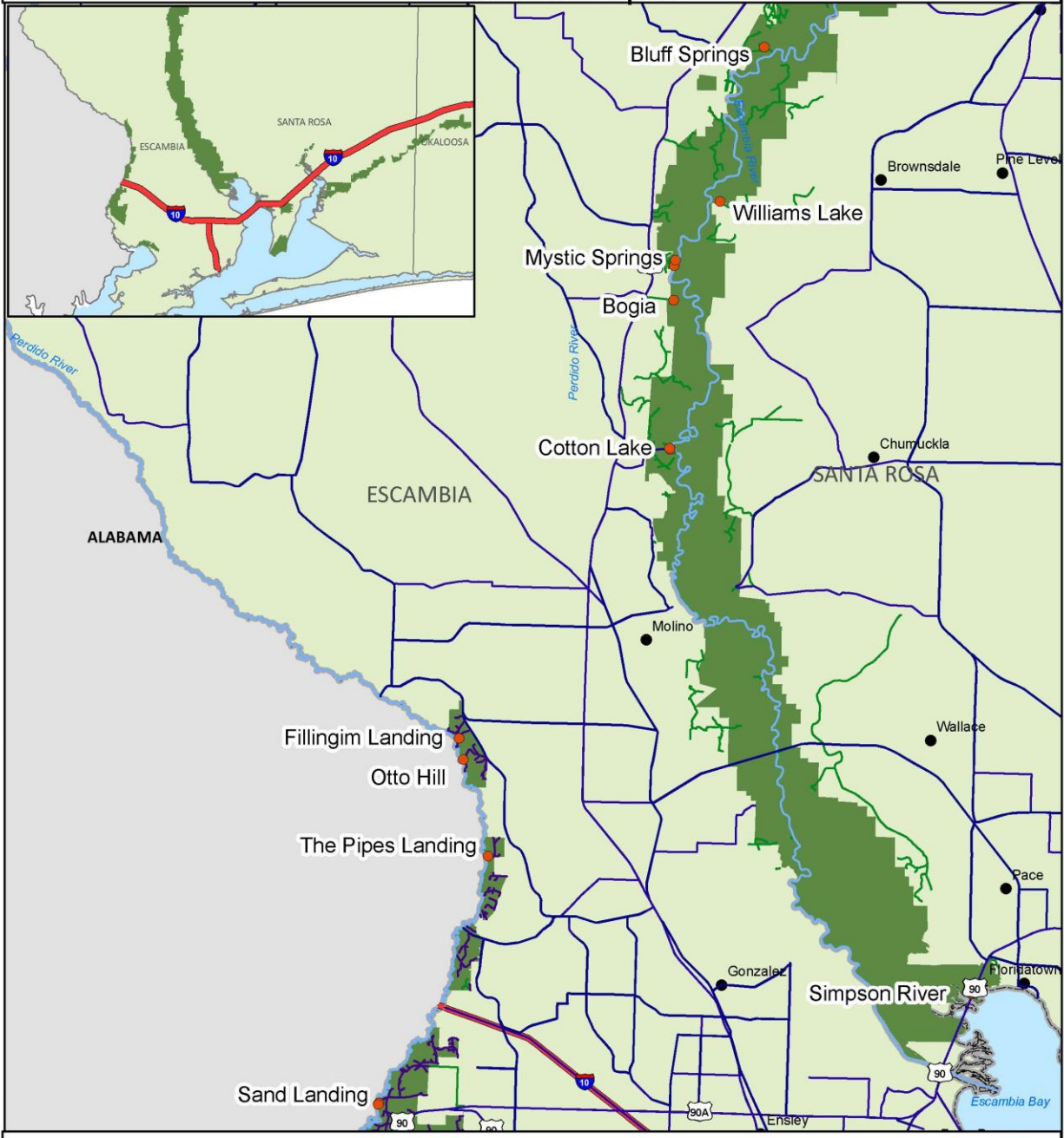
Exhibit Map B