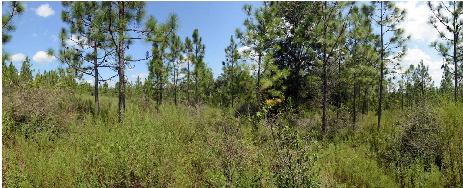
Plum Creek Photo Point No. 2 – 9/11/2023