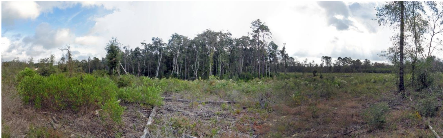
Plum Creek Photo Point No. 2 – 10/26/2010