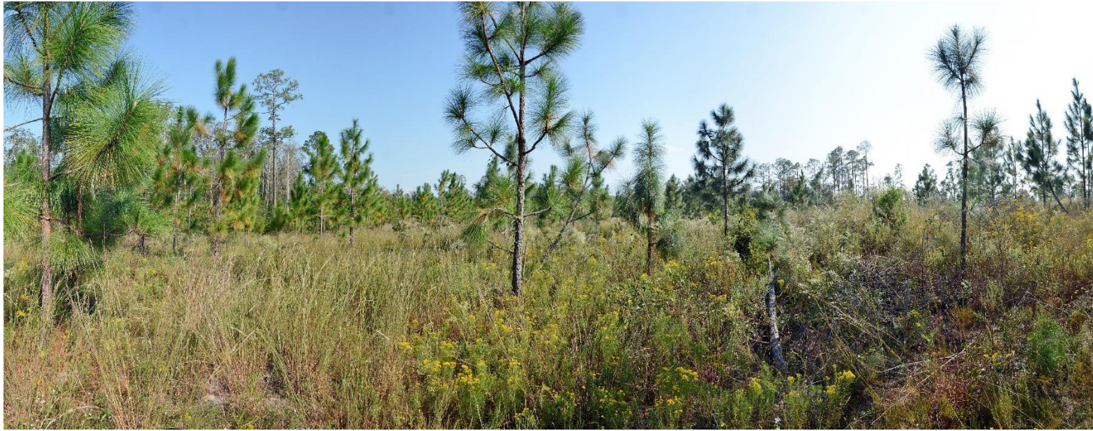
Plum Creek Photo Point No. 2 – 9/16/2020