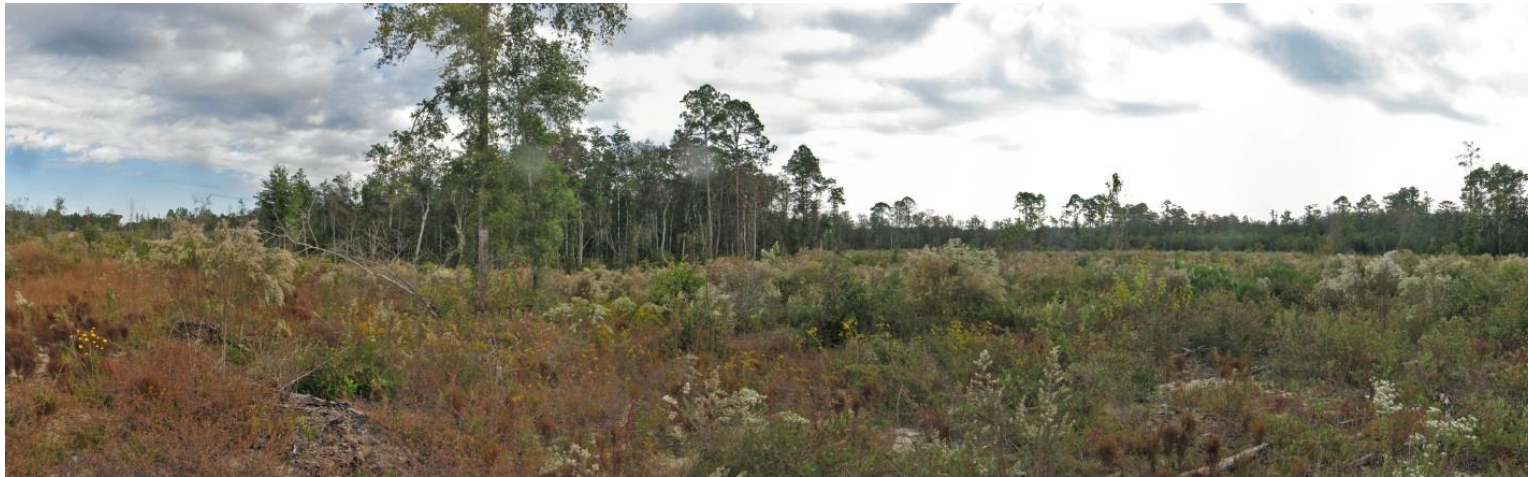
Plum Creek Photo Point No. 2 – 10/28/2011