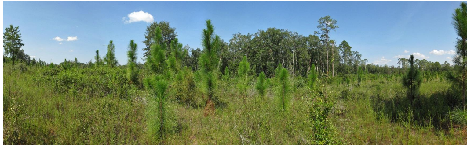
Plum Creek Photo Point No. 2 – 9/8/2016