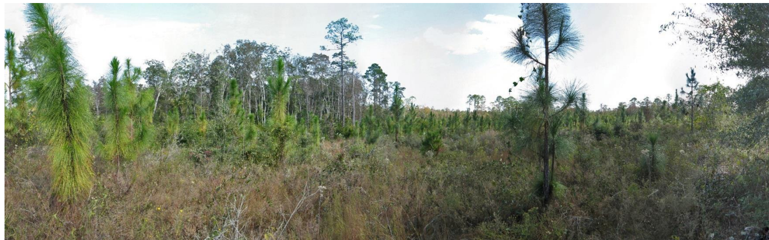
Plum Creek Photo Point No. 2 – 11/2/2017