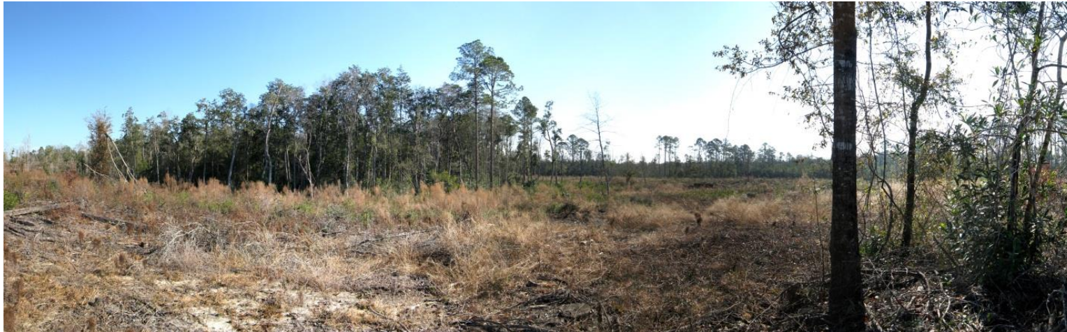
Plum Creek Photo Point No. 2 – 1/19/2010