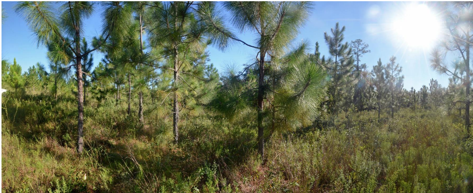
Plum Creek Photo Point No. 2 – 9/23/2021