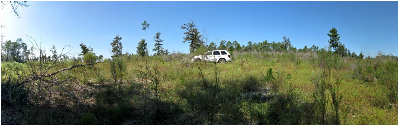
Plum Creek Photo Point No. 2 – 9/12/2013