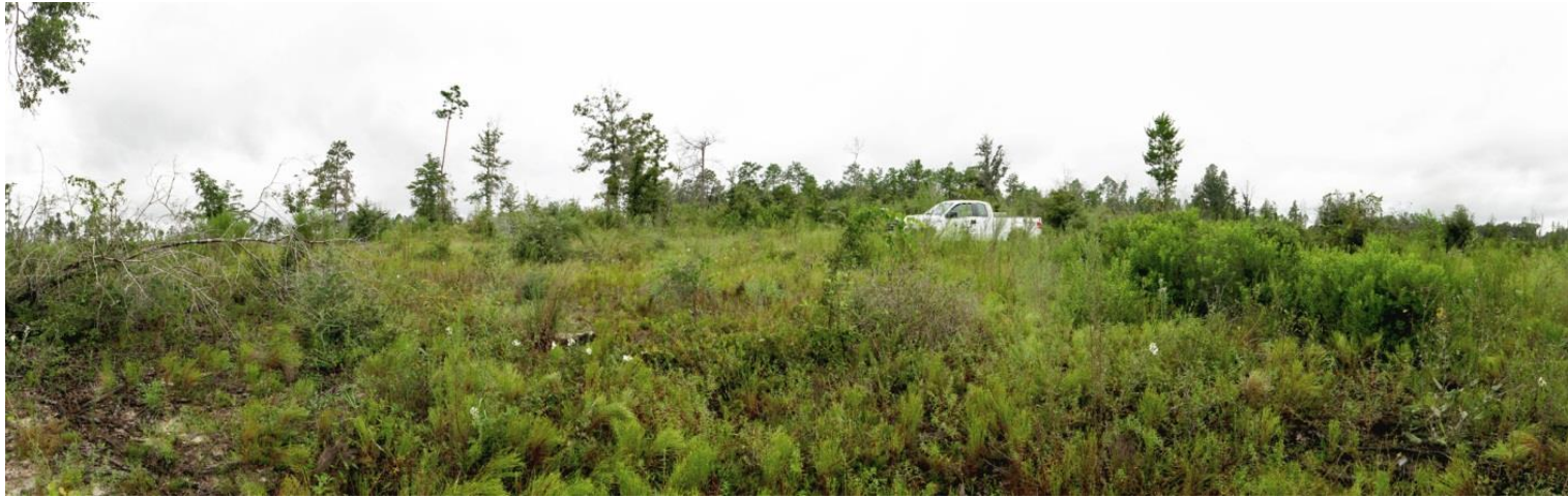
Plum Creek Photo Point No. 2 – 9/5/2012