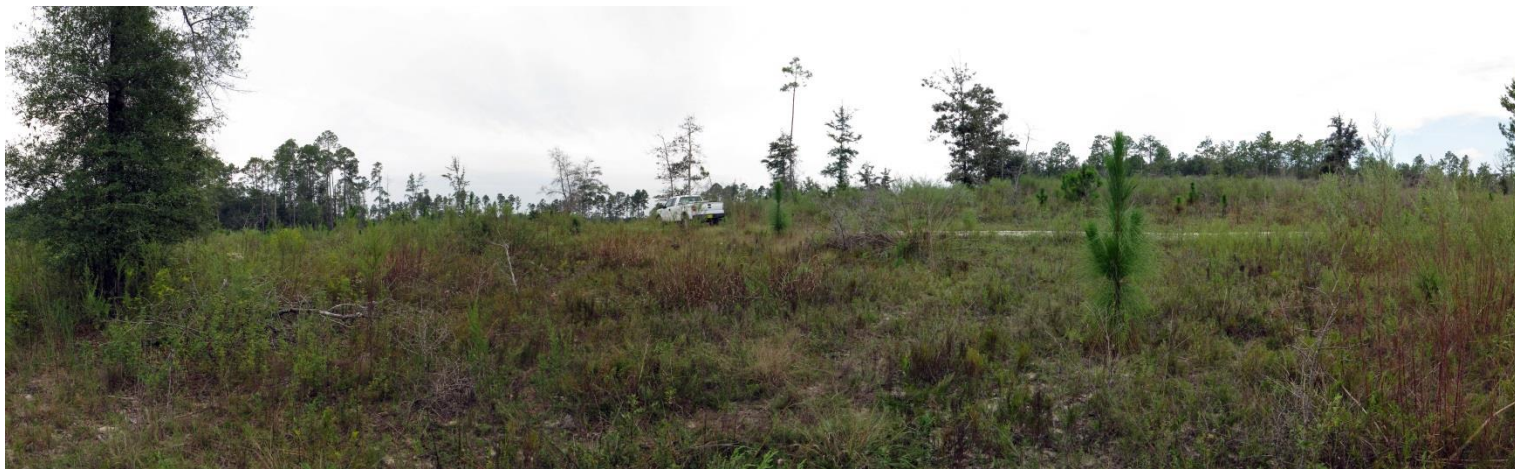
Plum Creek Photo Point No. 2 – 9/19/2014