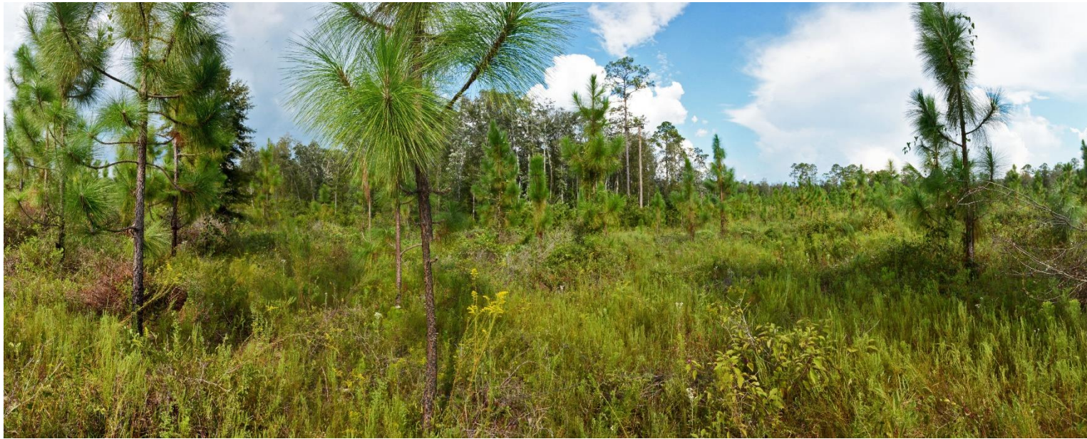
Plum Creek Photo Point No. 2 – 9/18/2018