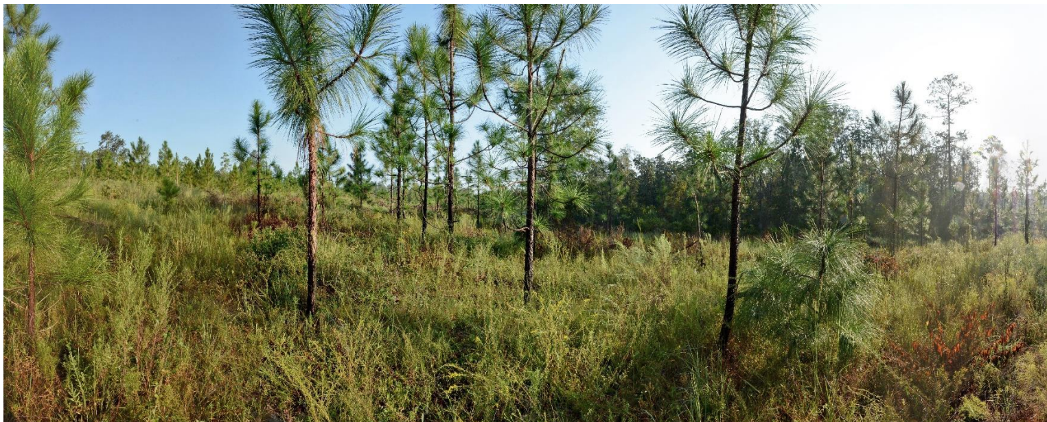
Plum Creek Photo Point No. 2 – 9/11/2019