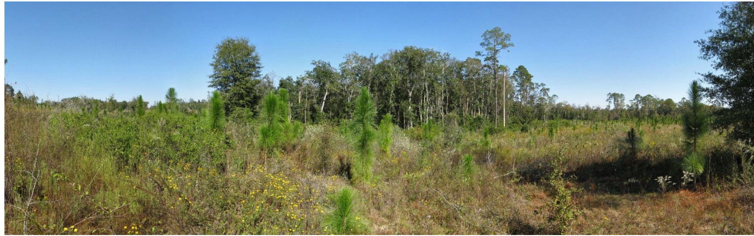
Plum Creek Photo Point No. 2 – 10/5/2015