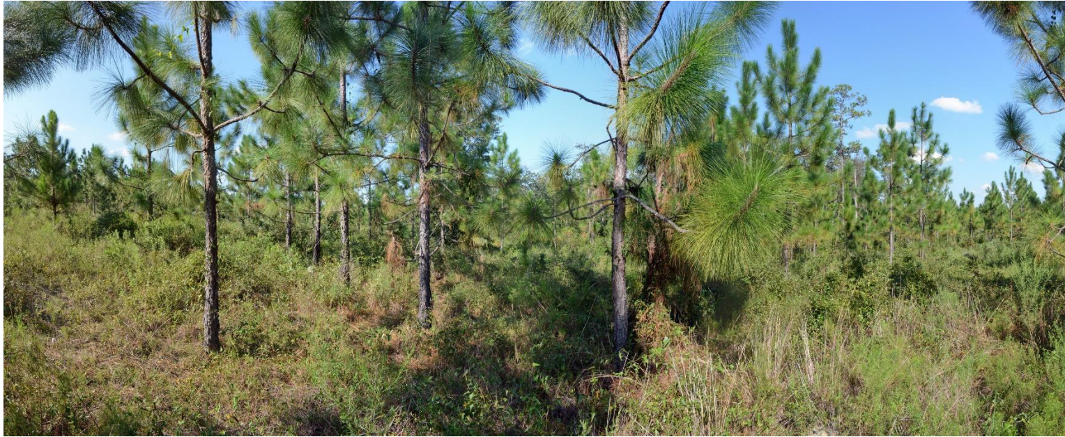
Plum Creek Photo Point No. 2 – 9/16/2022