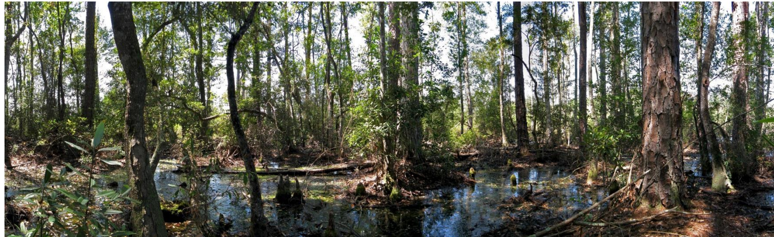
Plum Creek Photo Point No. 5 – 9/12/2013