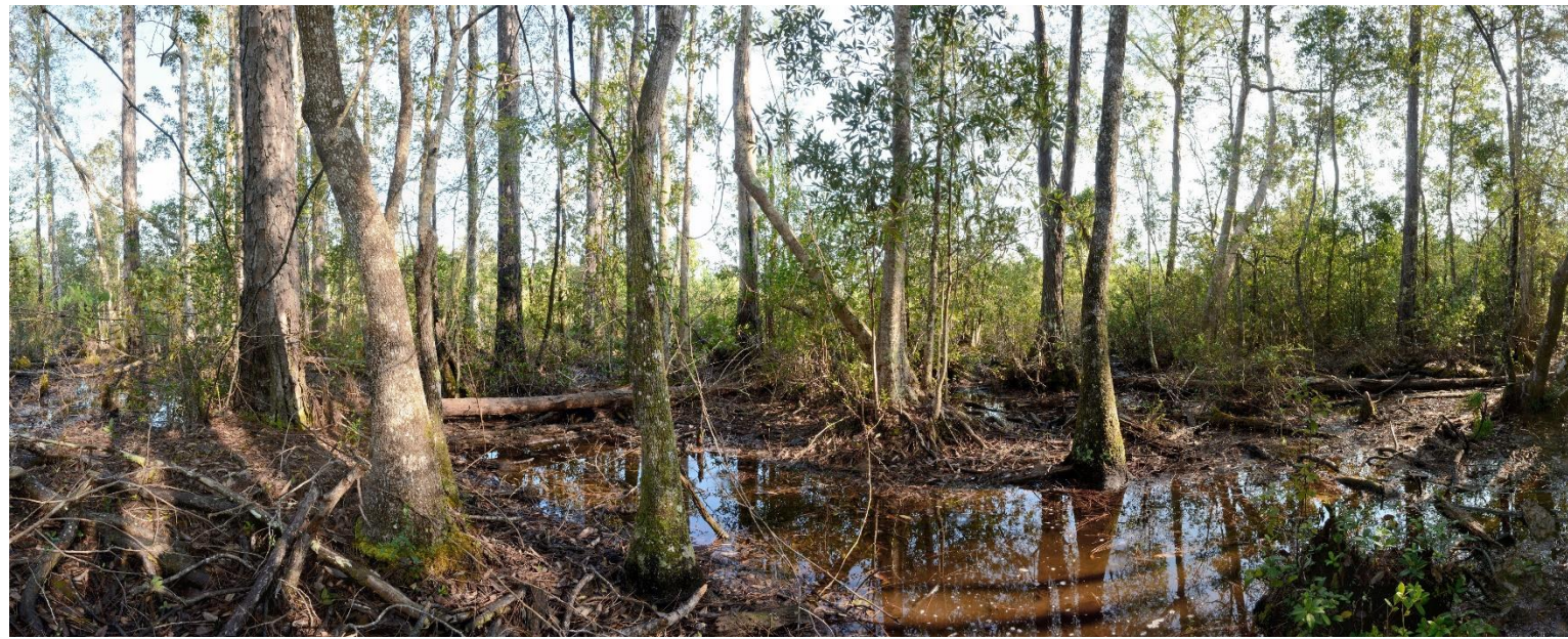
Plum Creek Photo Point No. 5 – 9/11/2019