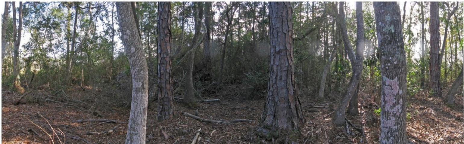
Plum Creek Photo Point No. 5 – 10/28/2011