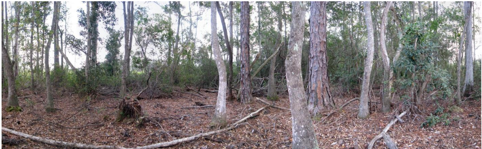
Plum Creek Photo Point No. 5 – 10/26/2010