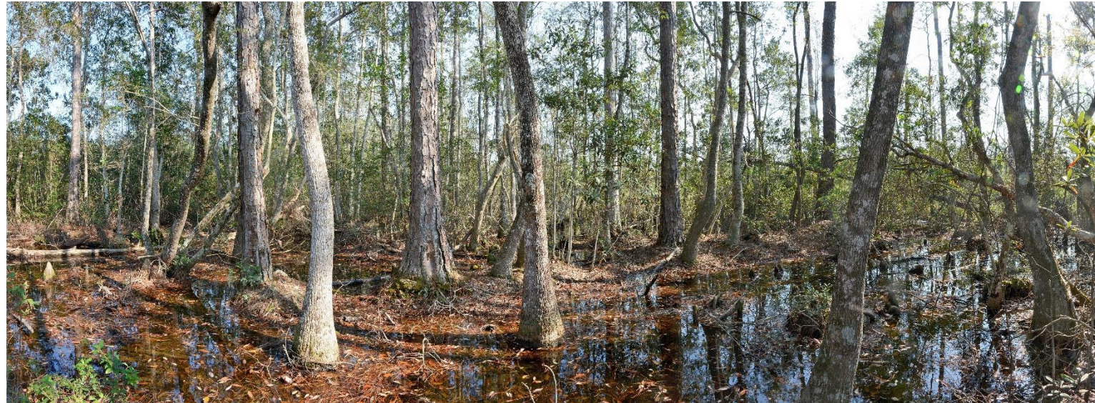
Plum Creek Photo Point No. 5 – 9/16/2020