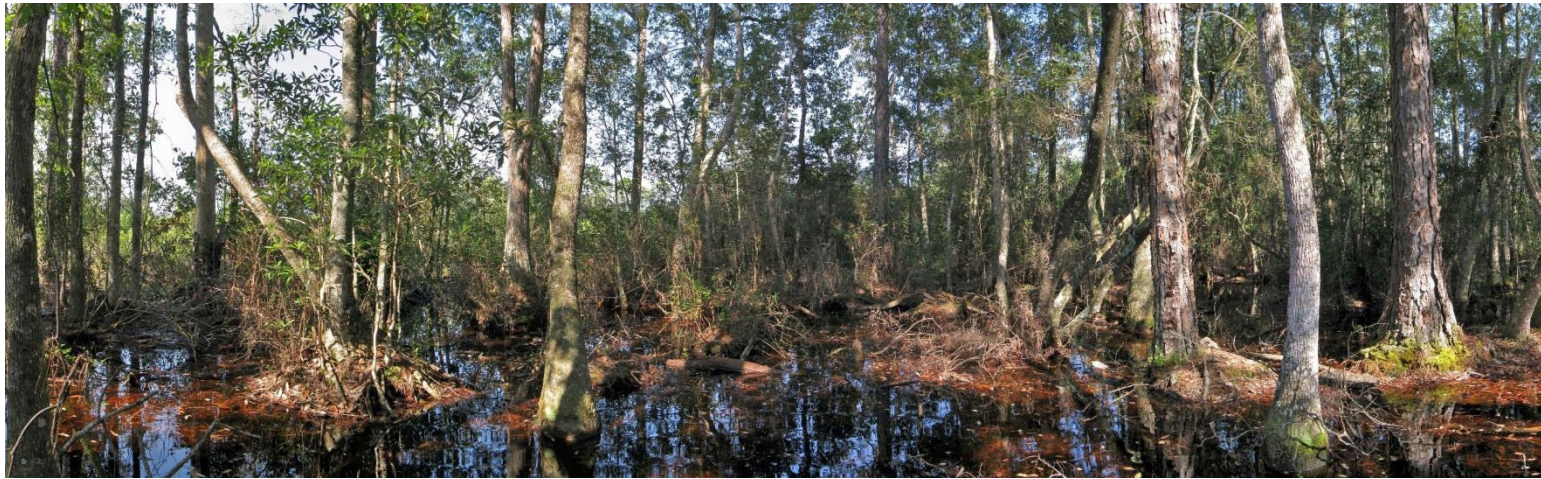
Plum Creek Photo Point No. 5 – 9/8/2016