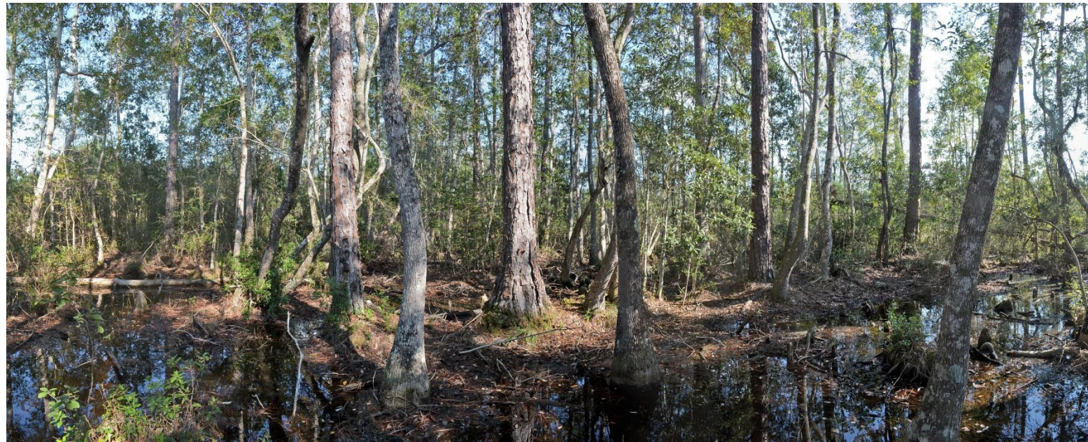
Plum Creek Photo Point No. 5 – 9/16/2022