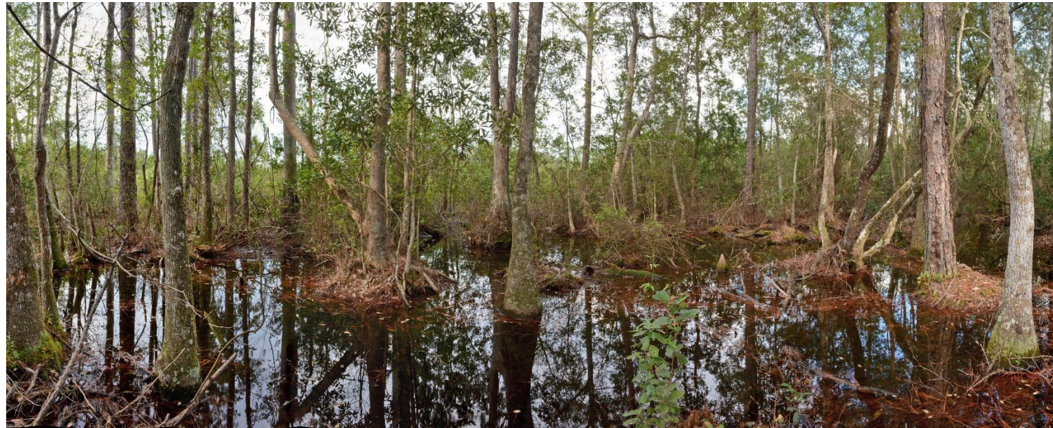
Plum Creek Photo Point No. 5 – 9/18/2018