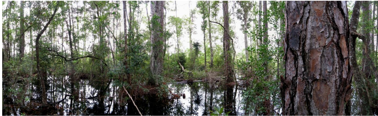
Plum Creek Photo Point No. 5 – 9/5/2012