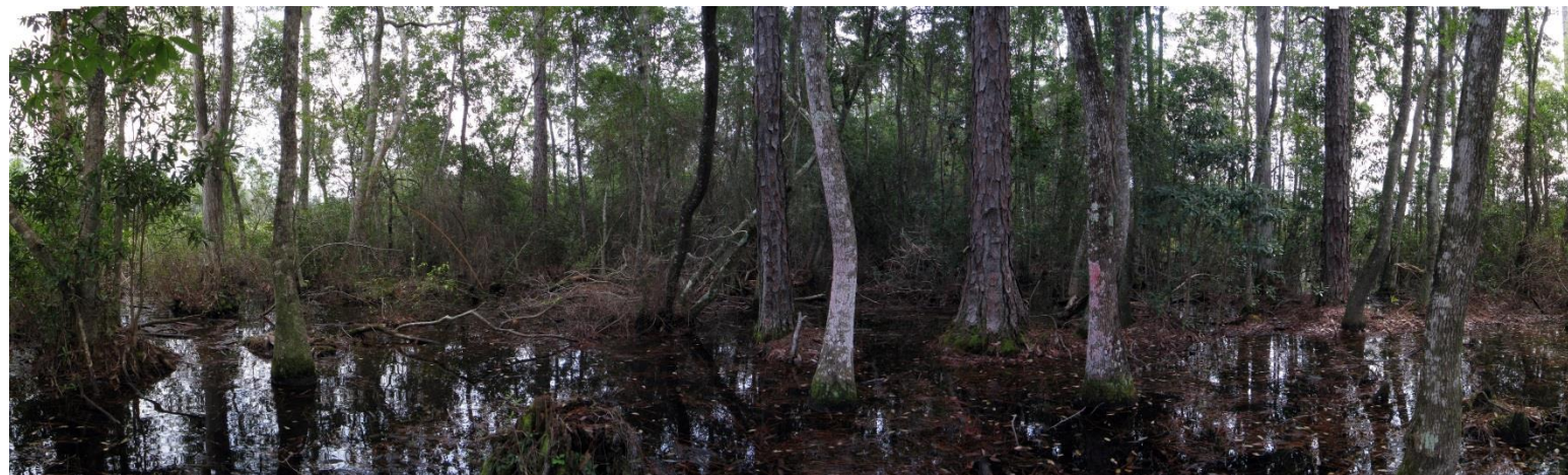
Plum Creek Photo Point No. 5 – 9/19/2014