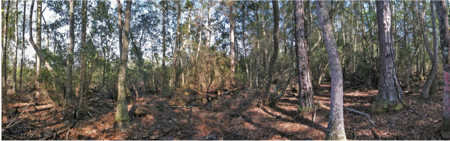
Plum Creek Photo Point No. 5 – 10/15/2015