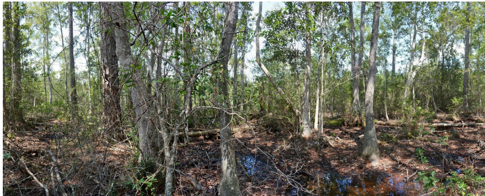
Plum Creek Photo Point No. 5 – 9/8/2023