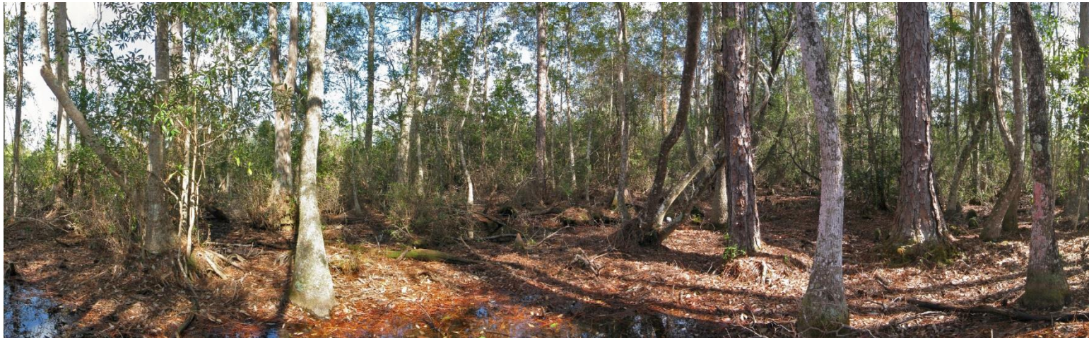
Plum Creek Photo Point No. 5 – 11/2/2017