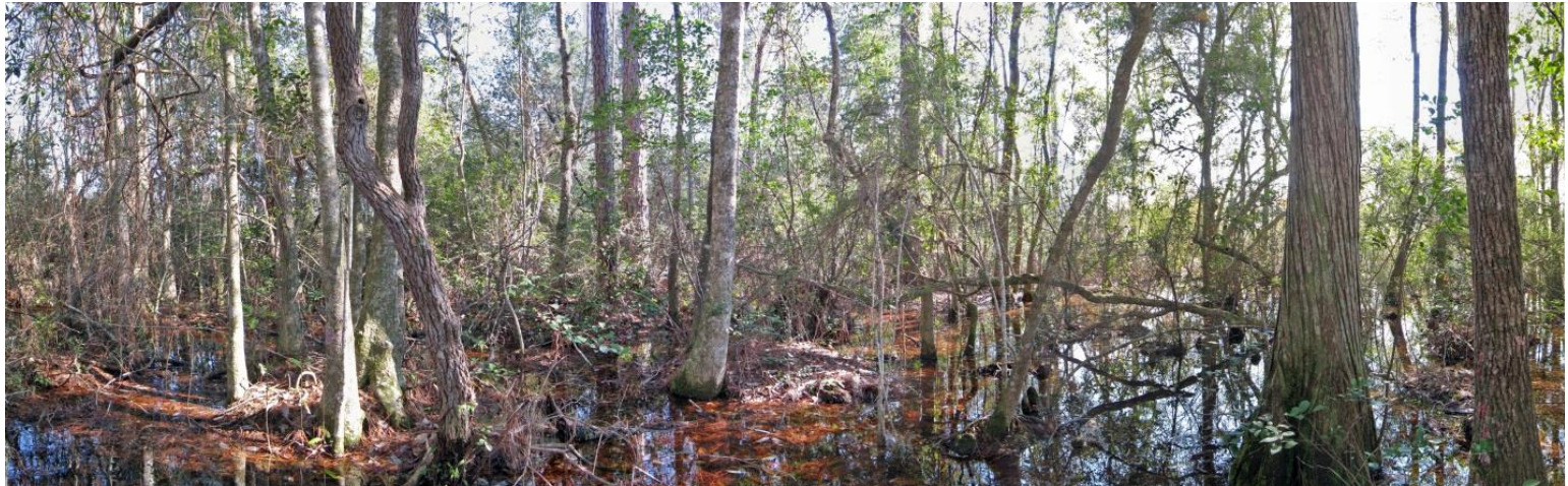
Plum Creek Photo Point No. 5 – 1/19/2010