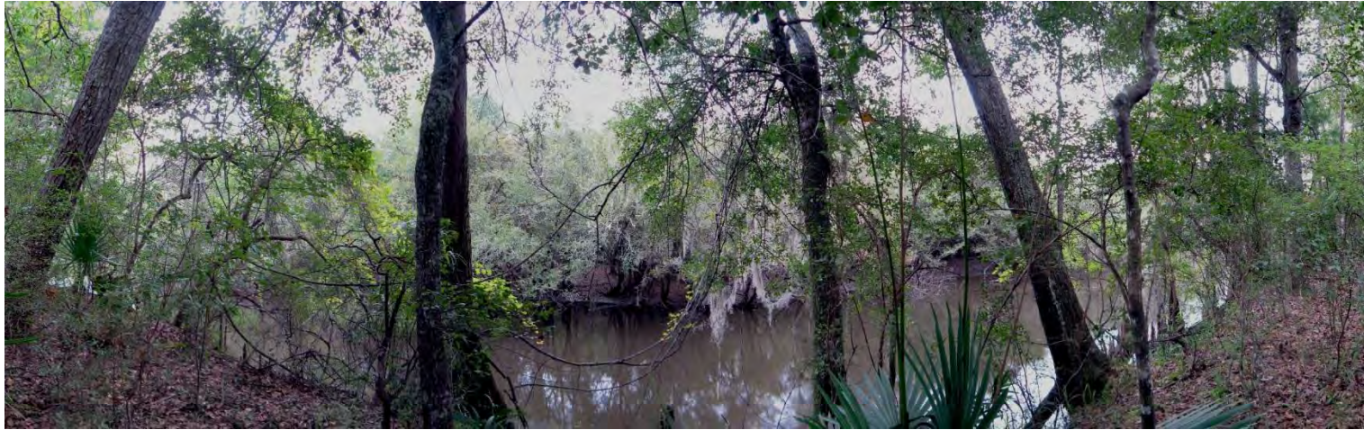
Shuler Tract Panoramic Photo Point 2 – 9/25/2015