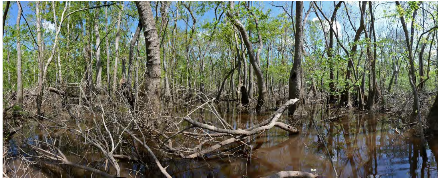
Shuler Tract Panoramic Photo Point 3 – 3/27/2019