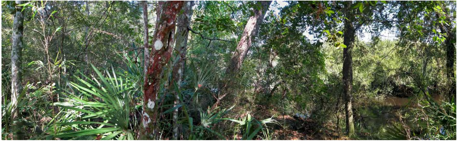
Shuler Tract Panoramic Photo Point 2 – 9/17/2013