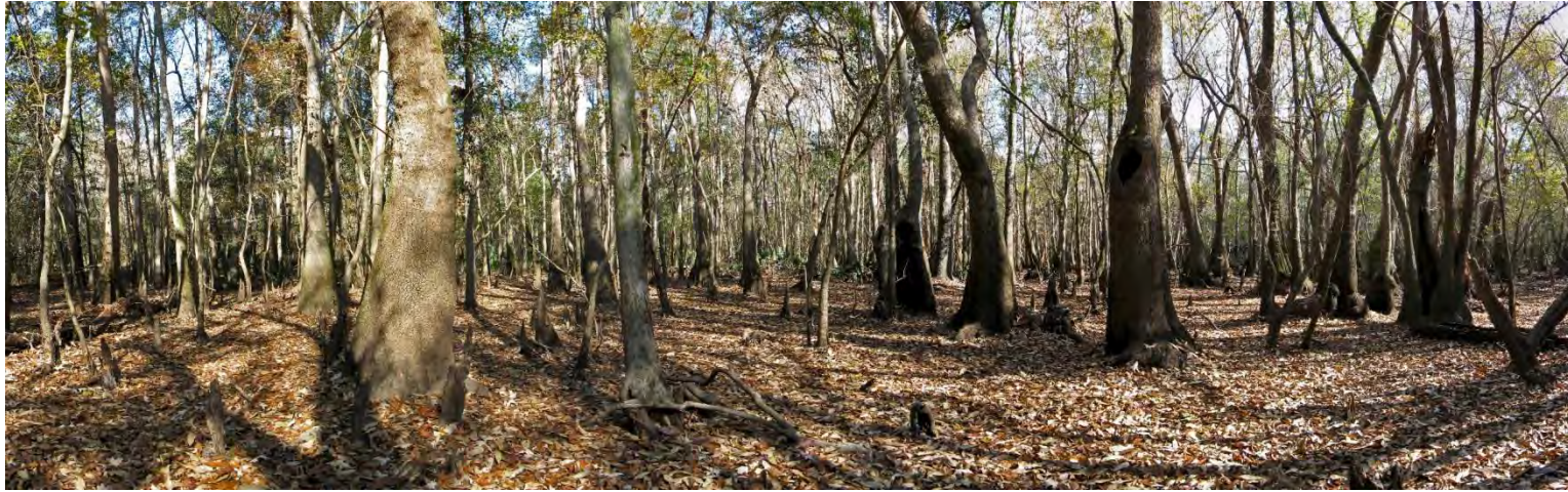
Shuler Tract Panoramic Photo Point 3 – 11/29/2012