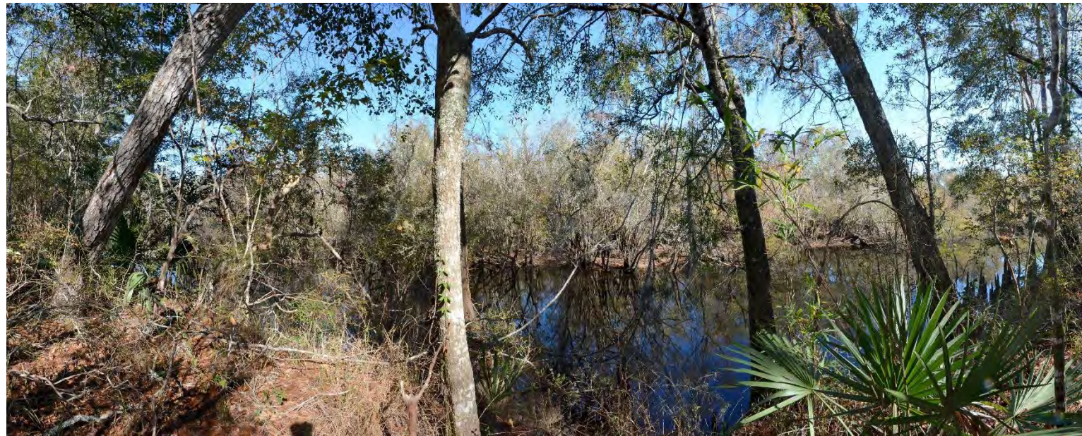
Shuler Tract Panoramic Photo Point 2 – 12/5/2019