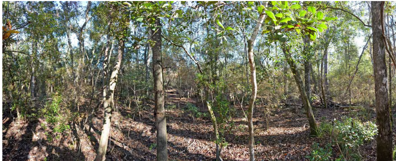
Shuler Tract Panoramic Photo Point 1 – 11/23/2021