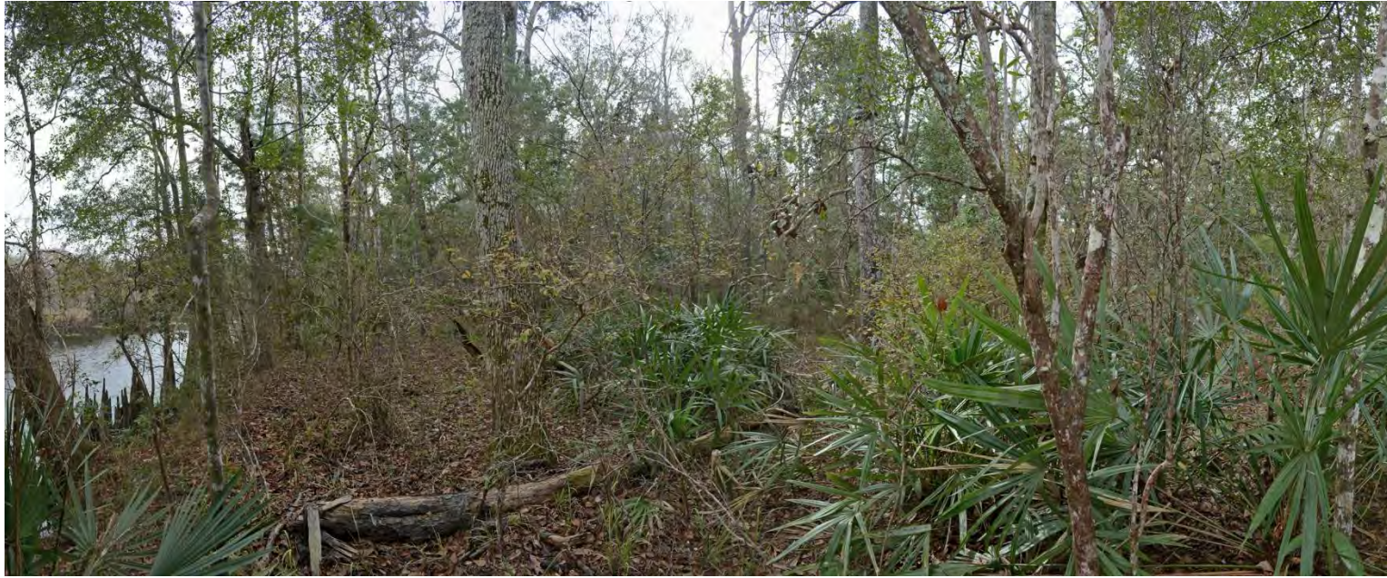
Shuler Tract Panoramic Photo Point 2 – 12/14/2022