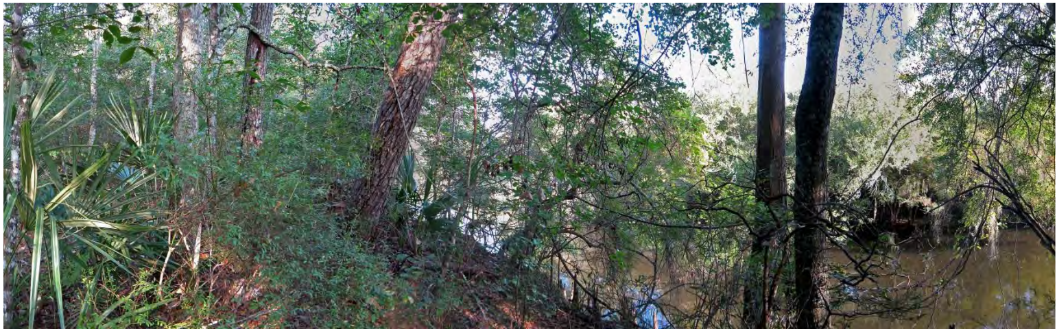
Shuler Tract Panoramic Photo Point 2 – 10/9/2014