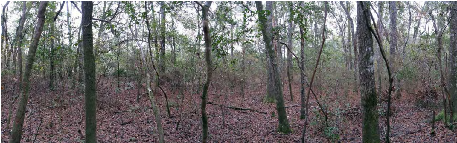
Shuler Tract Panoramic Photo Point 1 – 12/7/2016