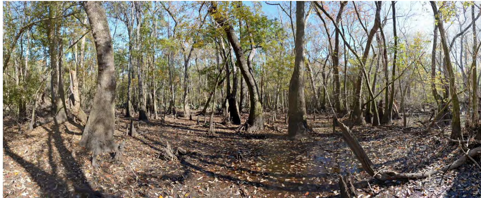
Shuler Tract Panoramic Photo Point 3 – 11/23/2021