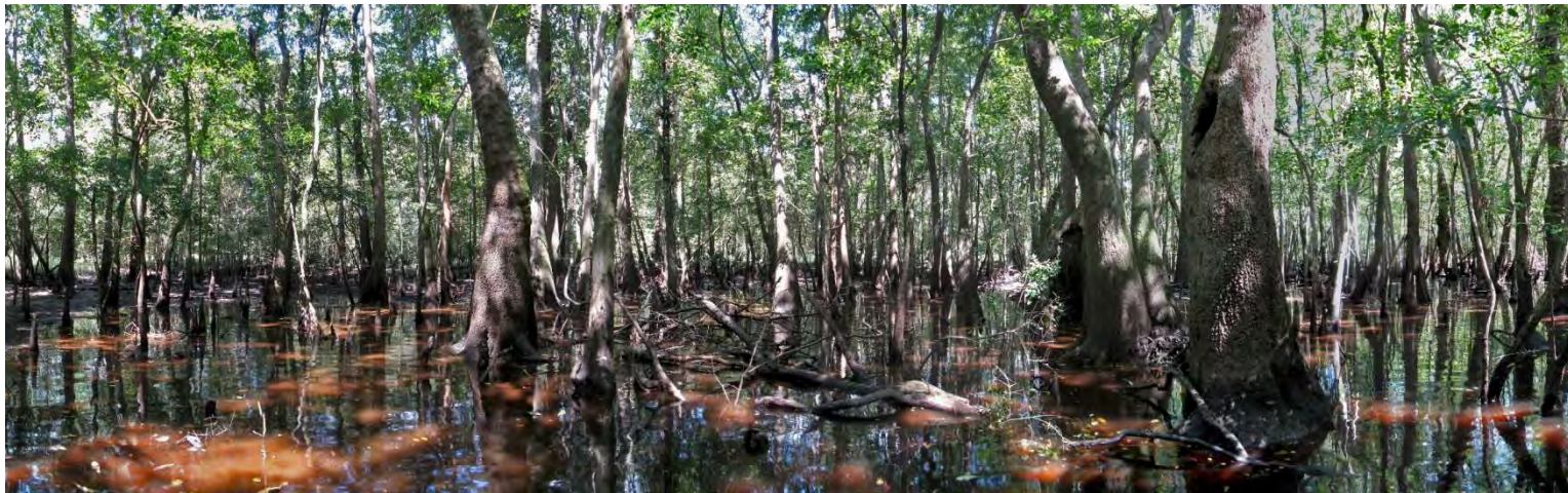
Shuler Tract Panoramic Photo Point 3 – 9/17/2013