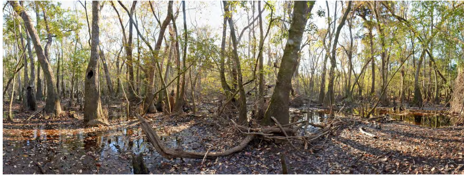
Shuler Tract Panoramic Photo Point 3 – 11/24/2020