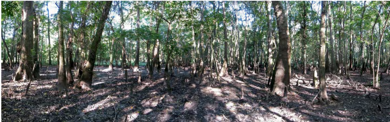
Shuler Tract Panoramic Photo Point 3 – 10/9/2014