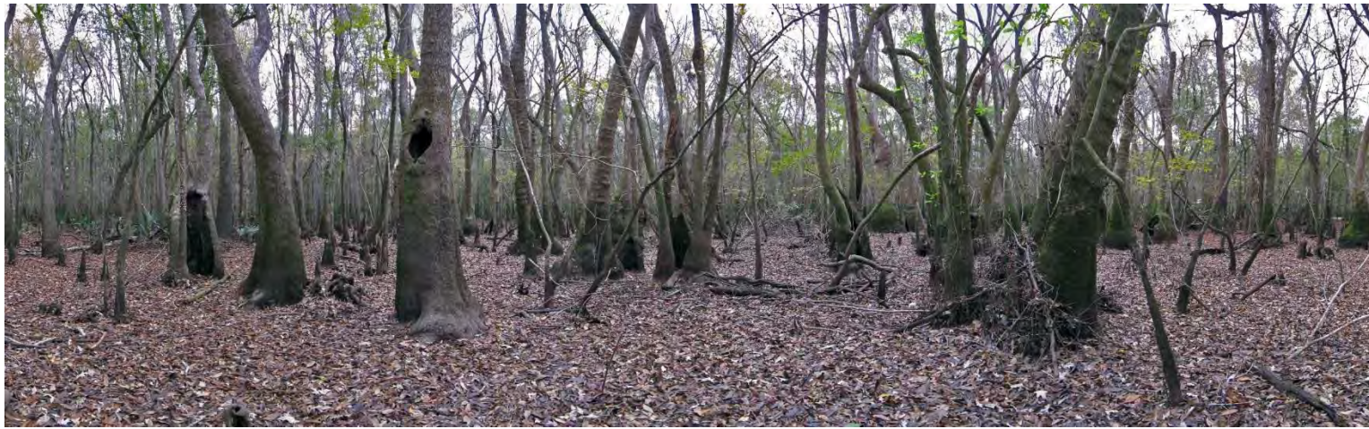
Shuler Tract Panoramic Photo Point 3 – 12/7/2016