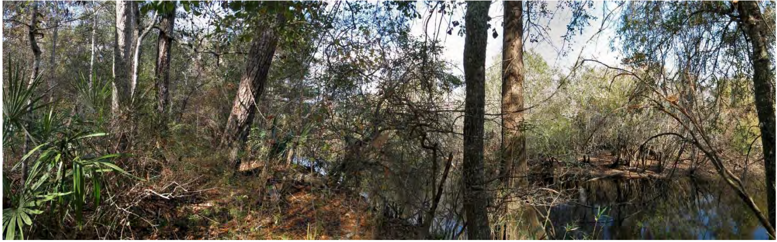
Shuler Tract Panoramic Photo Point 2 – 11/29/2012