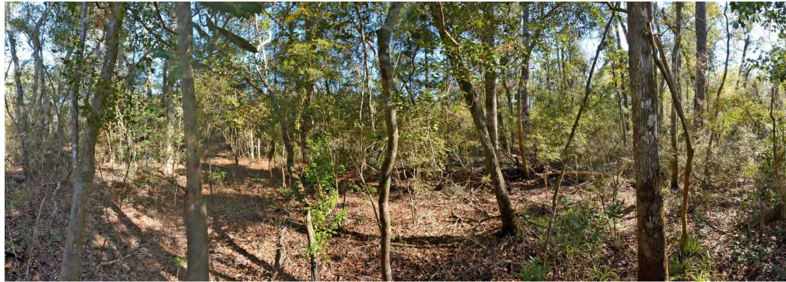
Shuler Tract Panoramic Photo Point 1 – 11/24/2020