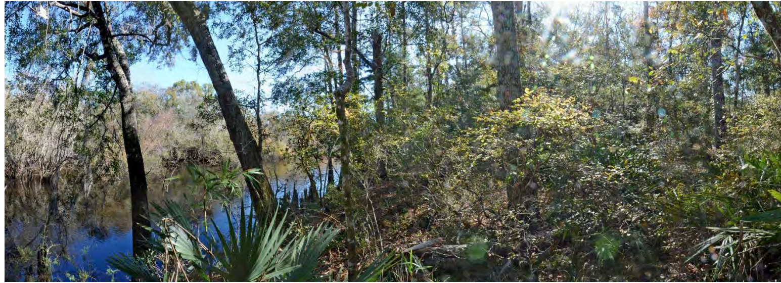
Shuler Tract Panoramic Photo Point 2 – 11/24/2020