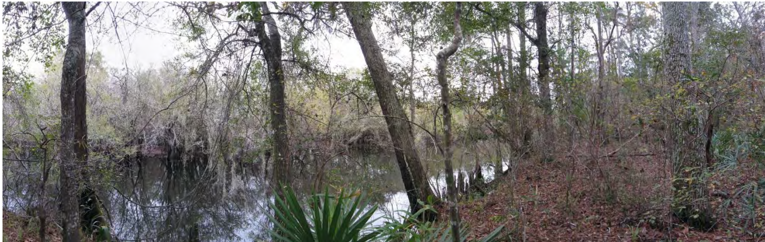
Shuler Tract Panoramic Photo Point 2 – 12/7/2016