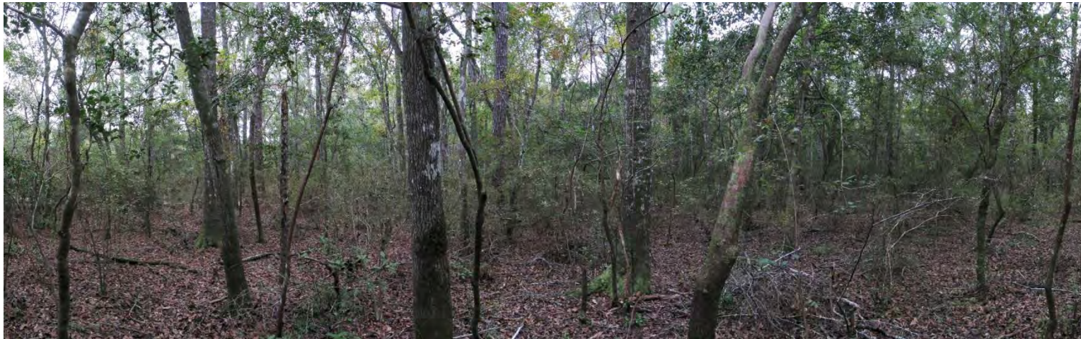
Shuler Tract Panoramic Photo Point 1 – 11/9/2017