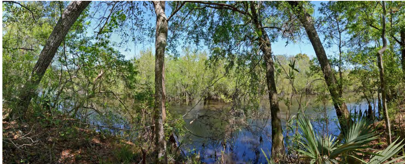
Shuler Tract Panoramic Photo Point 2 – 3/27/2019