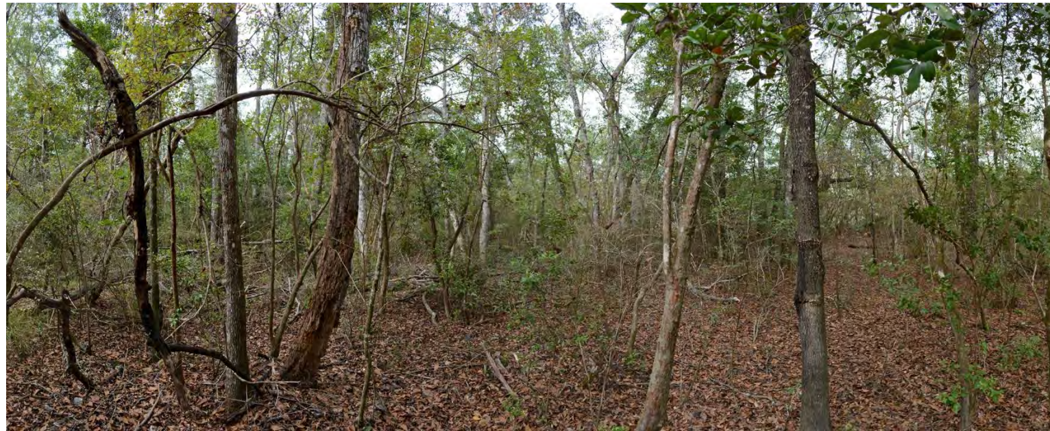
Shuler Tract Panoramic Photo Point 1 – 12/14/2022