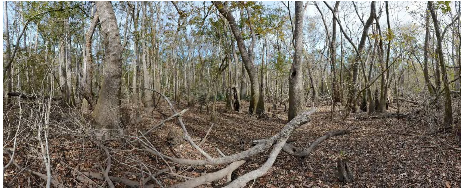
Shuler Tract Panoramic Photo Point 3 – 12/5/2019