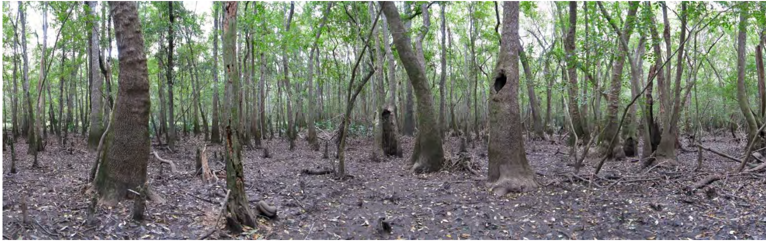
Shuler Tract Panoramic Photo Point 3 – 9/25/2015