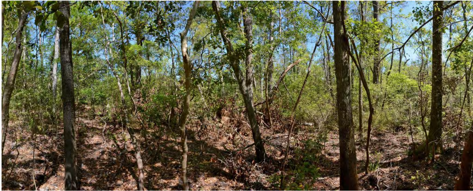
Shuler Tract Panoramic Photo Point 1 – 3/27/2019