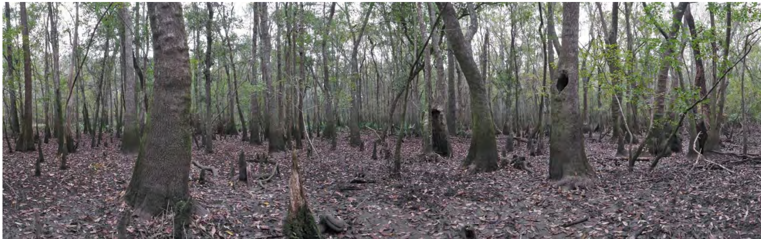
Shuler Tract Panoramic Photo Point 3 – 11/9/2017