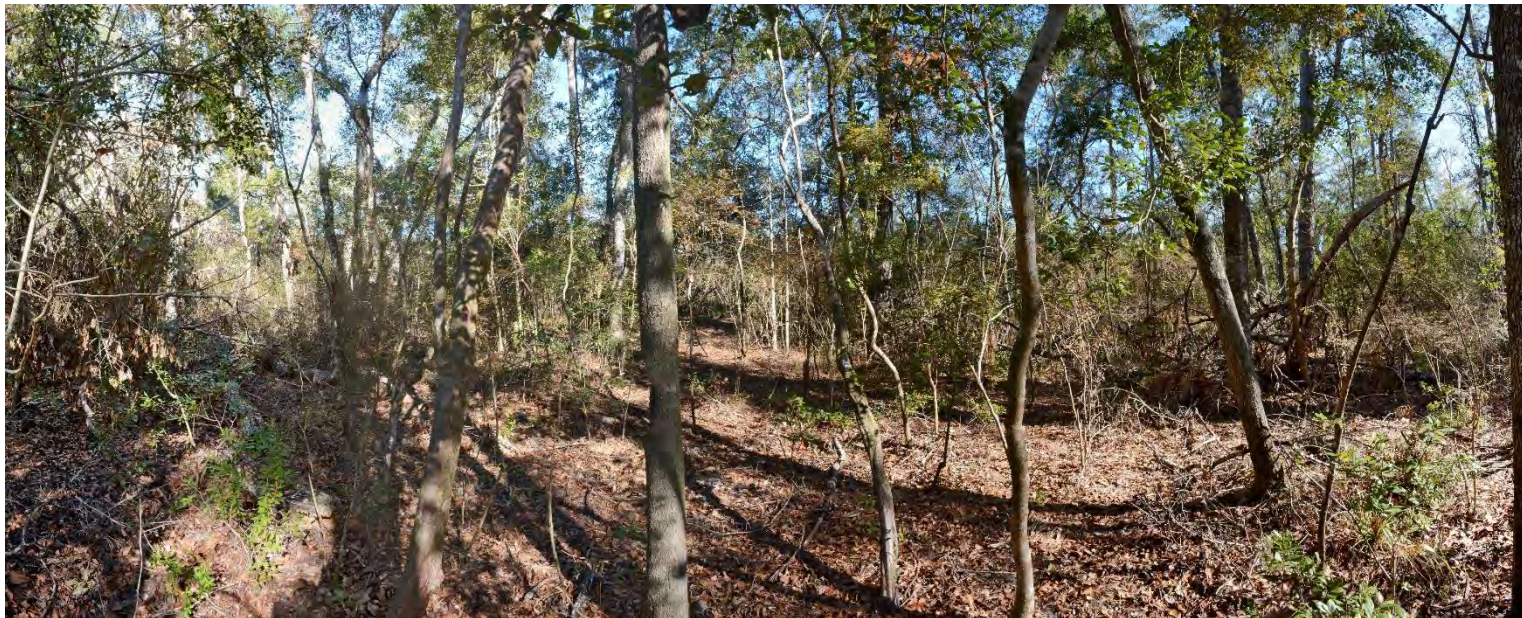
Shuler Tract Panoramic Photo Point 1 – 12/5/2019