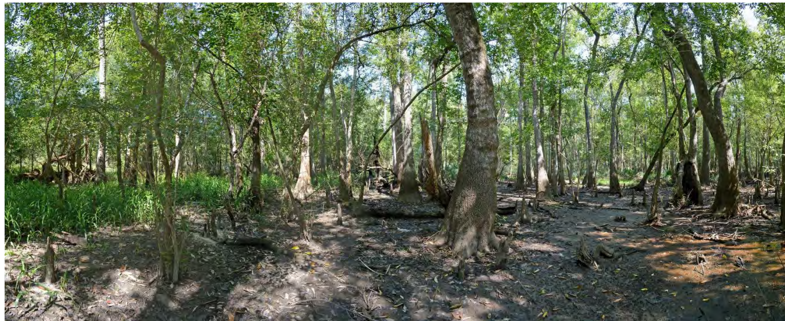
Shuler Tract Panoramic Photo Point 3 – 9/19/2023