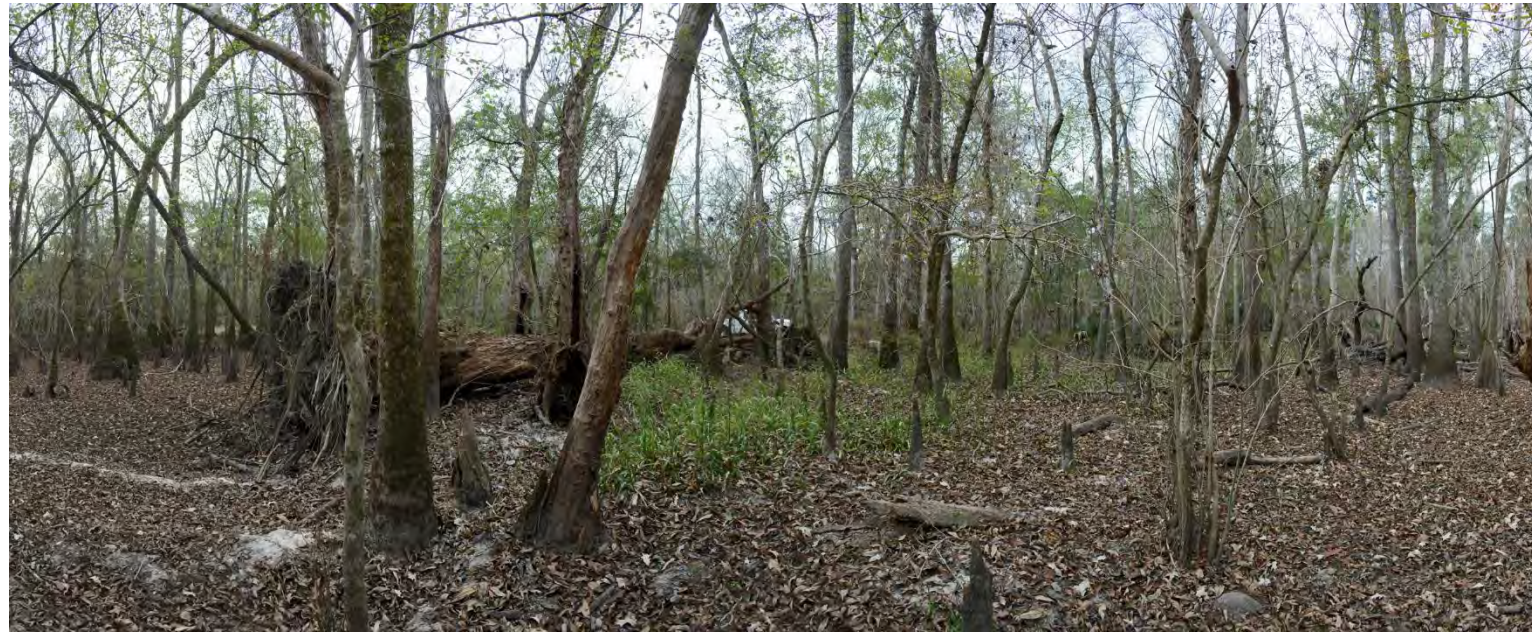
Shuler Tract Panoramic Photo Point 3 – 12/14/2022