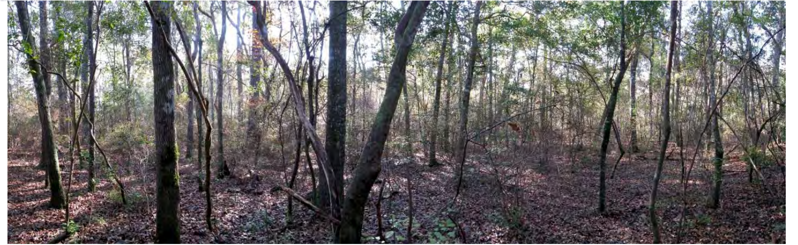
Shuler Tract Panoramic Photo Point 1 – 11/29/2012