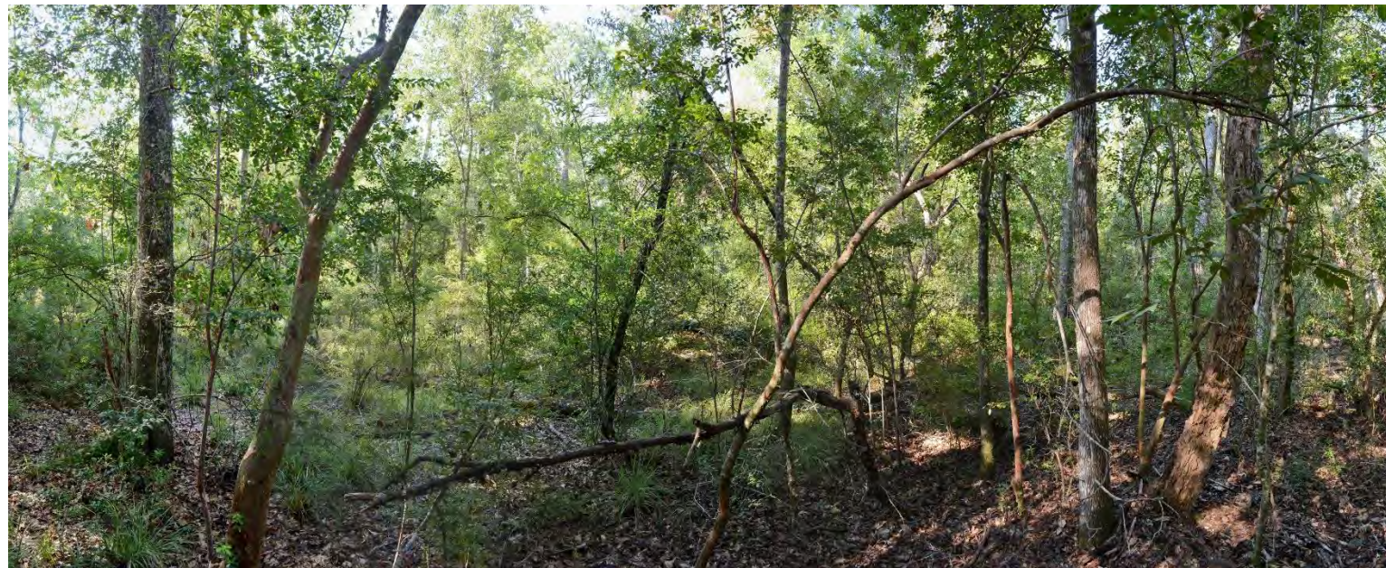
Shuler Tract Panoramic Photo Point 1 – 9/19/2023