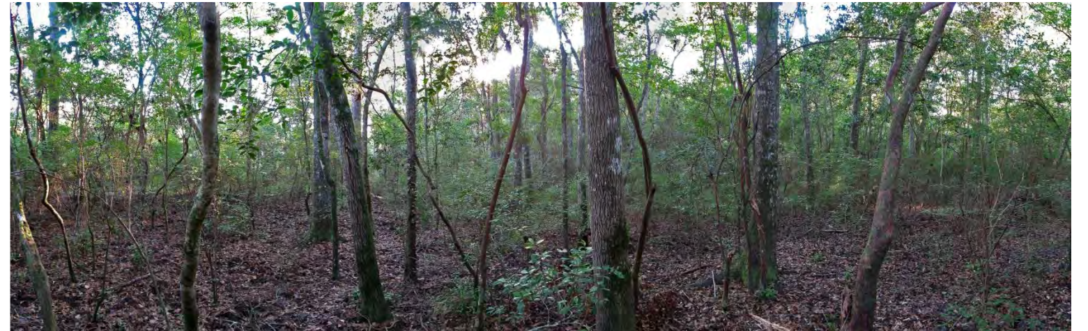
Shuler Tract Panoramic Photo Point 1 – 10/9/2014