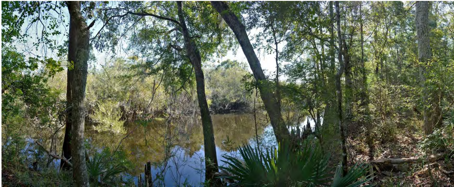
Shuler Tract Panoramic Photo Point 2 – 9/19/2023