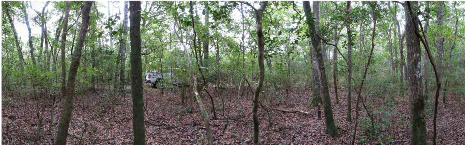
Shuler Tract Panoramic Photo Point 1 – 9/25/2015