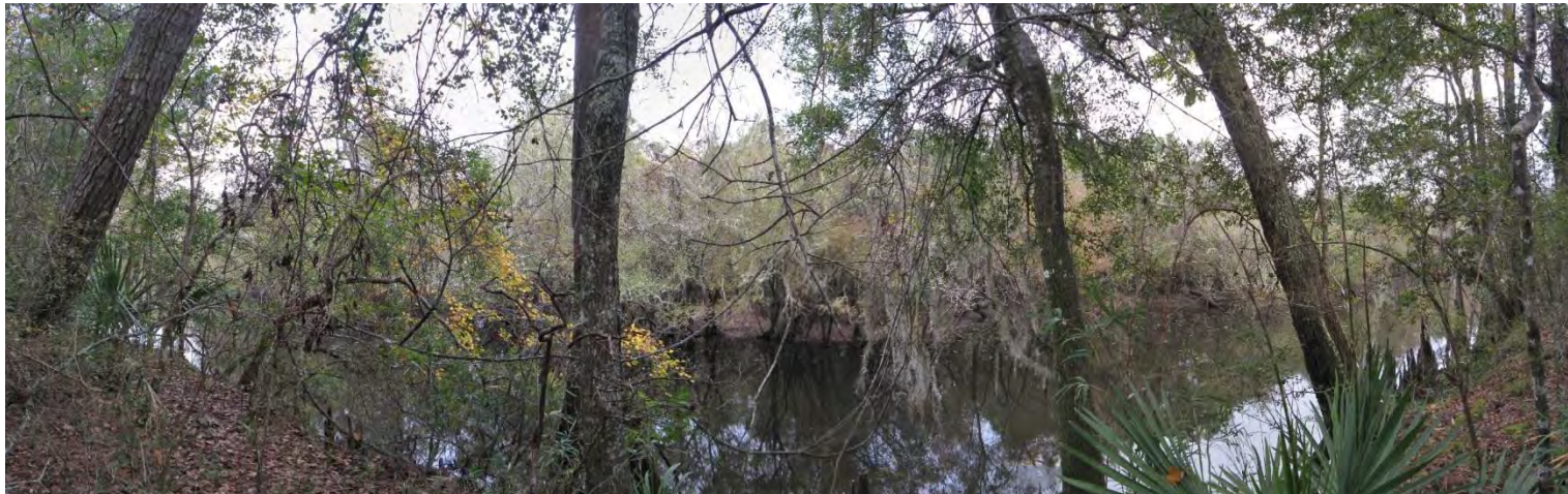
Shuler Tract Panoramic Photo Point 2 – 11/9/2017